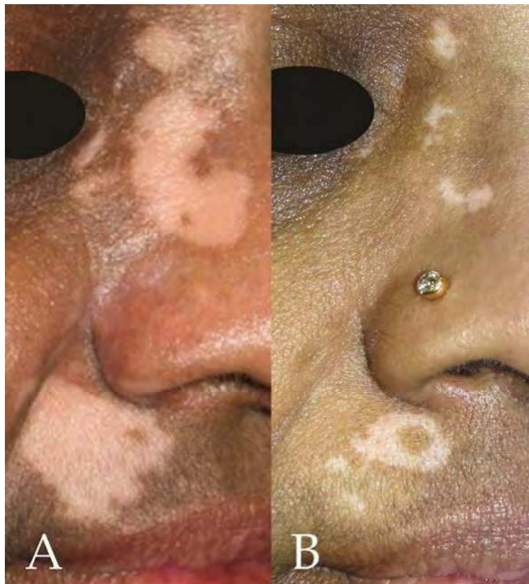
Fig. 3. A patient with facial vitiligo was treated with NB-UVB phototherapy three times weekly. A. The patient prior to initiating treatment. The patient was then started at 200 mJ based on standard protocol for Fitzpatrick skin type III. B. The patient with notable repigmentation after treatment 56 at a dose of 1001 mJ.

NB-UVB for vitiligo is most effective on the face and neck, followed by the trunk, and then upper extremities (Figure 3). Acral regions including the lower extremities, palms, and soles are more resistant to treatment. The reason has yet to be elucidated, but the regional density of hair follicles, which are reservoirs for melanocytes, are thought to play a role (Stinco, Piccirillo et al., 2009). In general, the repigmentation patterns in patients treated with NB-UVB are, in descending order, perifollicular (51.3%), then marginal, diffuse, and combined (Yang, Cho et al., 2010). However, the marginal pattern was observed to be the most common when >75% repigmentation occurred by 12 weeks of treatment (Yang, Cho et al., 2010).