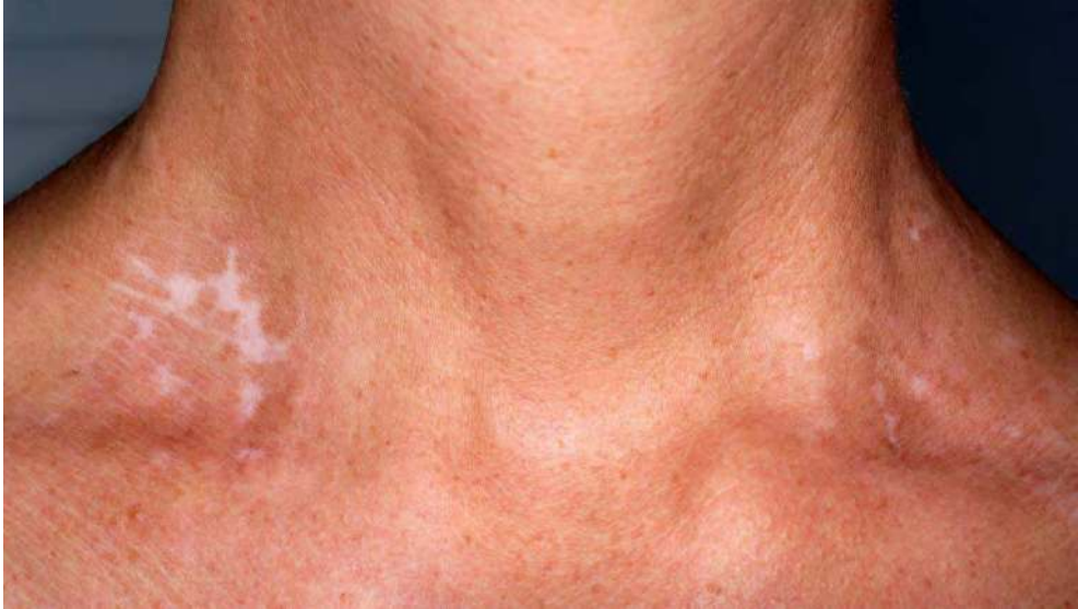
Fig. 2. Near complete repigmentation of vitiligo patches with NB-UVB treatment.