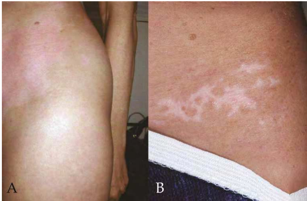
Fig. 4. A. Extensive vitiligo of the lower abdomen and hips. B. Repigmentation of vitiligo patches after 24 months of NB-UVB treatment.

Home UVB therapy may be a valuable and convenient option for select patients. Patient-reported outcomes for home NB-UVB therapy and outpatient NB-UVB therapy revealed that they show similar clinical efficacy and safety profiles (Wind, Kroon et al., 2010). Home NB-UVB is convenient and can be cost-effective in certain situations. However, more reliable long-term follow-up data is needed to further justify home UVB therapy.