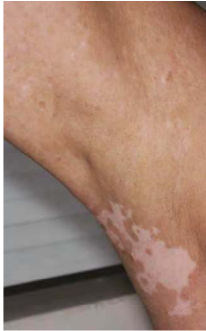
Fig. 5. Amelanotic patches of vitiligo in flexural areas undergoing involution NB-UVB therapy.