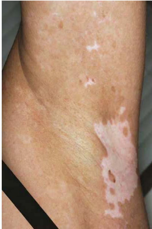
Fig. 6. NB-UVB is an effective treatment modality for vitiligo. Short term adverse effects are primarily related to phototoxicity. Long-term carcinogenic risk may not differ greatly from the general population.

When comparing UVB and PUVA carcinogenic risk, a single PUVA increases risk 7 times more than a single UVB treatment (Lim and Stern, 2005). Even with a history of PUVA therapy, patients who had less than 300 treatments of UVB had no appreciable increase in NMSC risk (Lim and Stern, 2005). Available data on NB-UVB therapy has not consistently identified a significant increase in NMSC when compared to the general population (Table 4). The majority of follow-up data was primarily taken from Caucasian populations, but the same conclusion has been drawn in non-Caucasians with skin types III-V (Jo, Kwon et al., 2010). An increased risk of BCC was noted in two Scottish studies, one with NB-UVB monotherapy, and the other with a history of both NB-UVB and PUVA usage (Stern and Laird, 1994; Man, Crombie et al., 2005). However, the temporal relationship between tumor diagnosis and phototherapy makes a relationship between therapy and cancer unlikely in either study (Stern and Laird, 1994; Man, Crombie et al., 2005). In addition, it is common to use topical pimecrolimus and/or tacrolimus as adjuncts to NB-UVB. Topical pimecrolimus and tacrolimus have not been found to increase risk of NMSC in adults. Therefore, even in combination with NB-UVB, there should be no cumulative carcinogenic effect. Therefore, UVB, in particular NB-UVB, may be the phototherapy option with the least carcinogenic risk in all skin types.