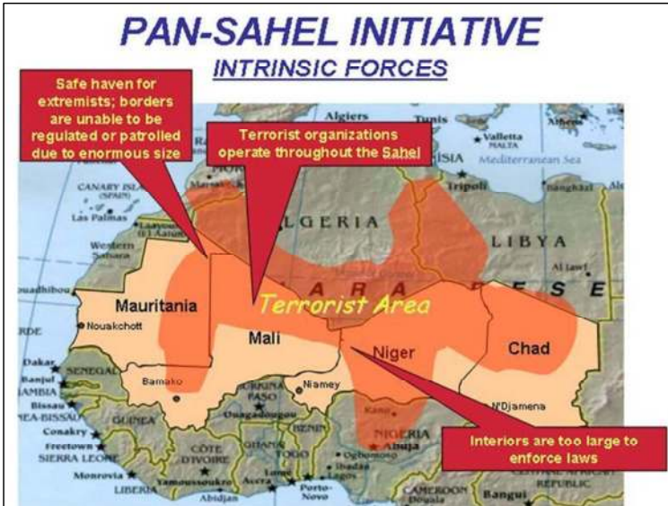
Map 3: The expanded terrorist area

Terrorism Initiative is to reinforce national borders and to control movements on the ground. The solution for the transnational problem is – at least publicly – still seen in the effective nation-state.