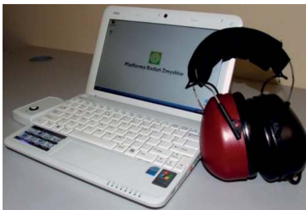
Figure 2. Platform for sense organs examinations.