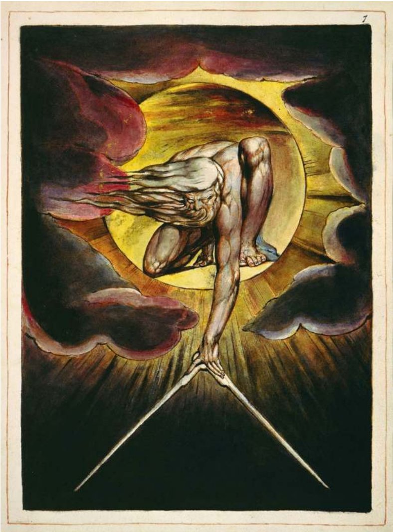
Fig 2. The compass is associated with power (in a geometrically gendered arrangement) by William Blake in Europe: A Prophecy (1794) — ‘When he sets a compass upon the face of the deep’ (Proverbs 8: 27).