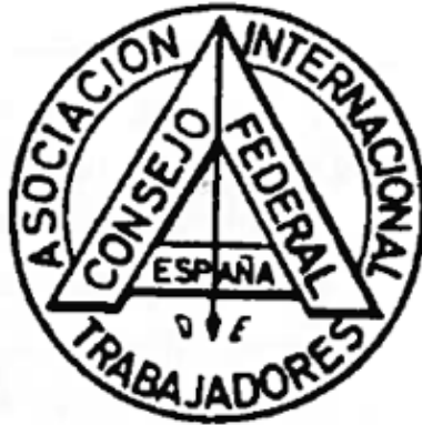
Fig 3. The seal of the Consejo Federal de España de la A.I.T. circa 1870. By Vilallonga (Own work, based on AIT.jpg.) [CC BY-SA 2.5 ( https://creativecommons.org/licenses/by-sa/2.5/ )], via Wikimedia Commons. https://commons.wikimedia.org/wiki/File:FRE-AIT.svg .

Over time these symbols have developed a new complement of meanings – many 21 st century anarchists don’t even know that the star used by communists, anarchists and Zapatistas alike is the pagan pentagram, and are not reminded of the mathematical perfection of cosmogony when they behold it, just as they do not necessarily realize there is a genealogical link between the (neo)pagan Mayday celebration and today’s anarchist Mayday marches. 42 In the 19 th century, however, these symbolic associations were well known by those involved, and their adoption reflected how much they resonated with mystical and historical weight. Even Bakunin, while he rejected the personal God of his Russian orthodox childhood, put forward a pantheistic revolutionism. In a letter to his sister (1836) he wrote, “Let religion become the basis and reality of your life and your actions, but let it be the pure and single-minded religion of divine reason and divine love. . . [I]f religion