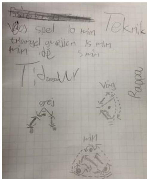
Figure 2. One players' plan for skill practice.

they went to choose the content varied. Several of the players wrote down exercises on paper (see Figure 2 ), while others only thought about how to do the session. Our field notes from practice session number eight support this: "all players had once again planned all practice tasks."