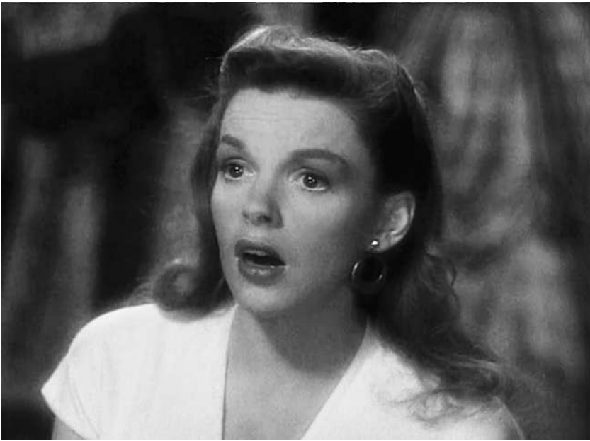
Fig. 4.5: Judy Garland lit and framed in Meet Me in St. Louis (top: "The Trolley Song") and in The Pirate (bottom: "Evening Star" verse of "Mack the Black").