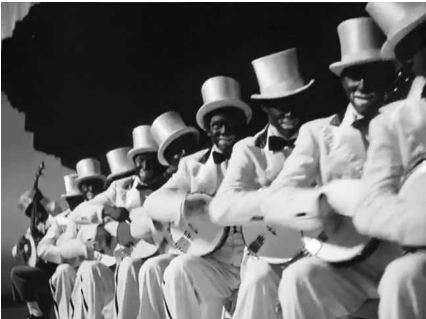
Fig. 4.6: Two frame-breaking moments in the minstrel show from Babes on Broadway : Judy Garland at the conclusion of “Franklin D. Roosevelt Jones” (top) and Mickey Rooney’s banjo choir in “Alabama Bound” (bottom).