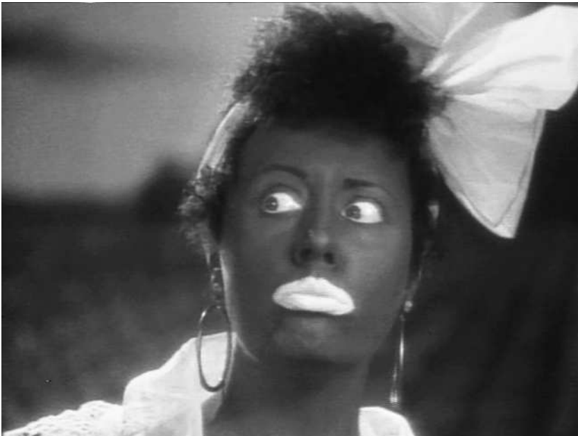
Fig. 4.2: Irene Dunne's Magnolia burning cork over a candle flame on the dressing room table while blacking up ( top ), and then performing "Gallivantin' Around" ( bottom ) in Show Boat (1936).