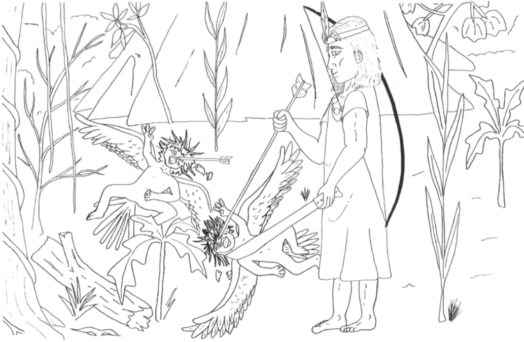
Figure 12.1 Times of human-animal undifferentiation: Edósikiana kills two harpy eagles with arrows.