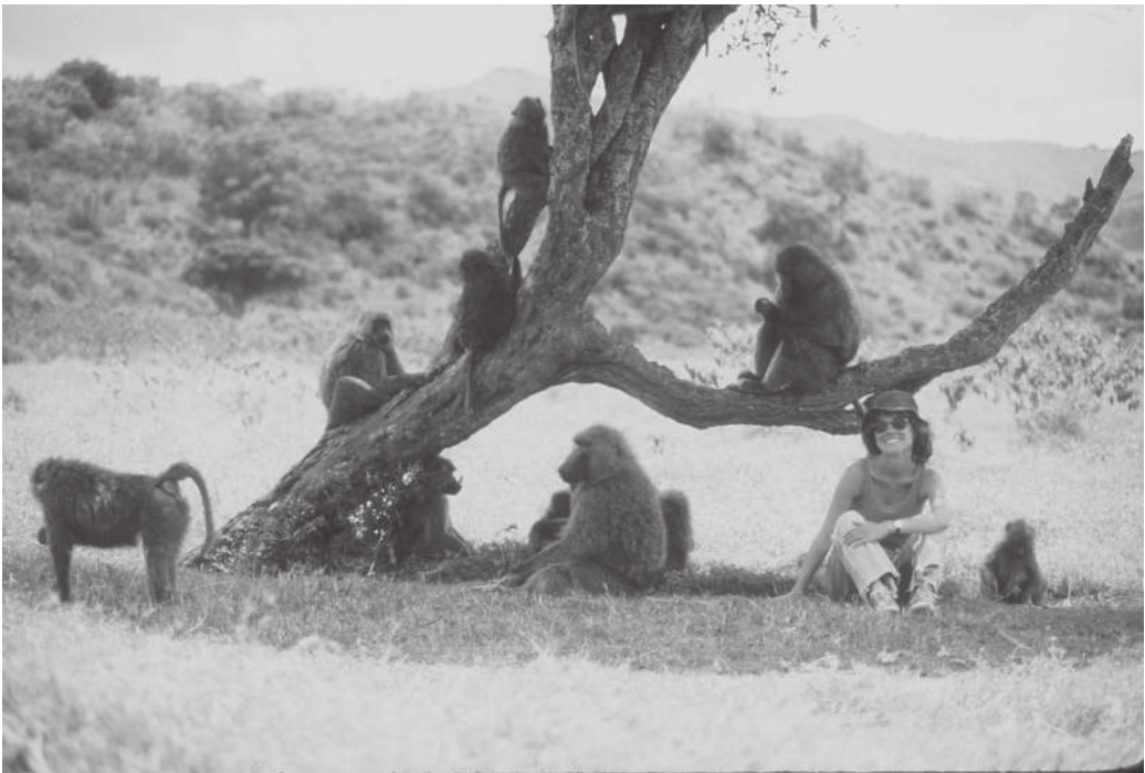
Figure 11.1 BS among several of the baboons she did research with in Gilgil, Kenya.

As one example, scientists who work with wild primates are conventionally trained to ignore them, to neutralize any effect human observers might have on their behaviour. Yet as one of us [BS] discovered during her fieldwork with baboons in East Africa, ignoring the baboons was not a neutral act, because she was not a neutral object in their environment (Figure 11.1). The baboons treated her as a social being, which meant that in some contexts, she had to treat them as social beings in return. This empathic dynamic helped baboons relax in her presence (and vice versa), enriching her observations and providing a unique window into animal (inter)subjectivity