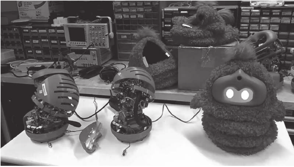
Figure 13.1c Tega robots, showing the electromechanical body on the left and covered in a fabric skin on the right. Personal Robots Group.