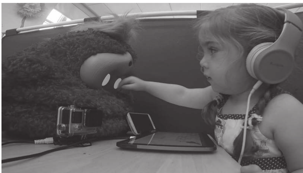
Figure 13.1b A girl reaches out to touch the Tega robot's face during interaction.