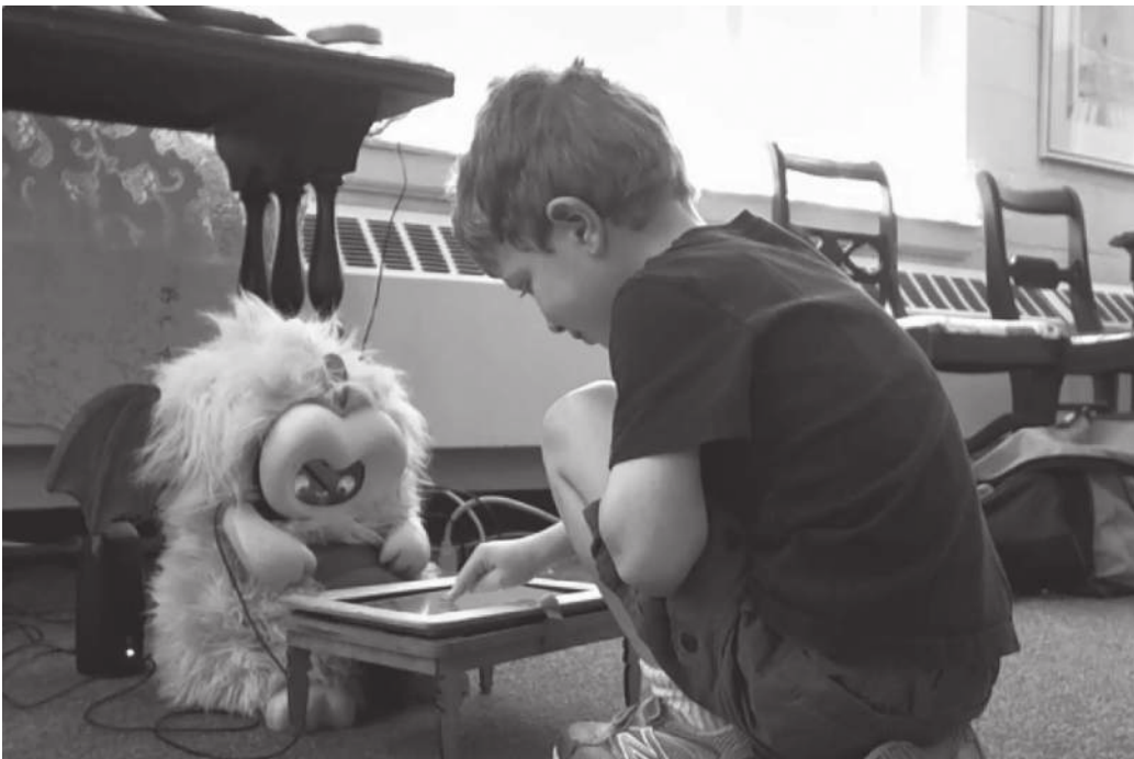
Figure 13.1d A boy plays a storytelling game with the Dragonbot robot on a shared game table surface. Personal Robots Group.