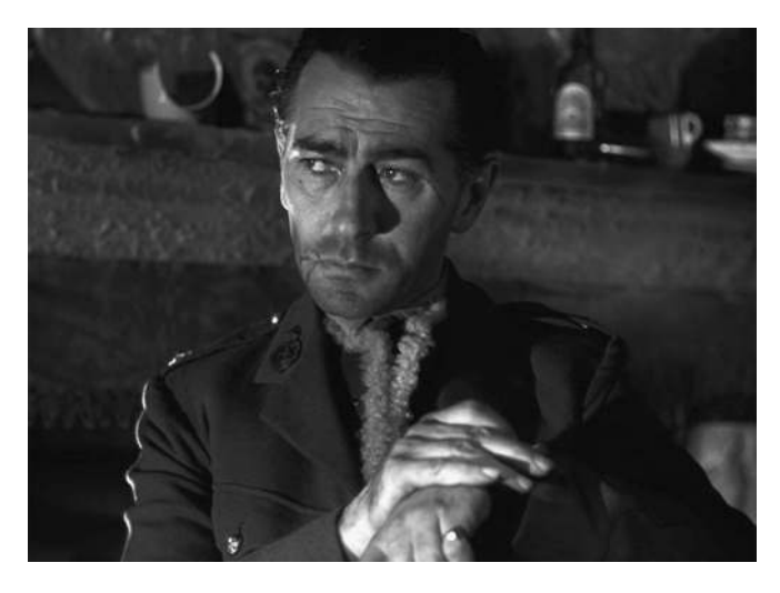
"A simple South African."

otherwise committed.80 Indeed, the appearance of the brutally effective South African officer, Major Van Zijl, in the film's middle section suggests as much: "Now listen! I am in command here now and I know how to deal with you scum. I am not a simple English gentleman but a simple South African and I assure you that I have means to get what I want."81 While the film draws a clear and immediate distinction between his apparent willingness to torture World War I German prisoners and Clive's more humane and less successful approach, the scene and Van Zijl's scarred face seem tacitly to suggest that his expertise might have been hard won at English hands a decade and a half before, a possibility that hints at something darkly tenacious within Powell and Pressburger's history of British violence.