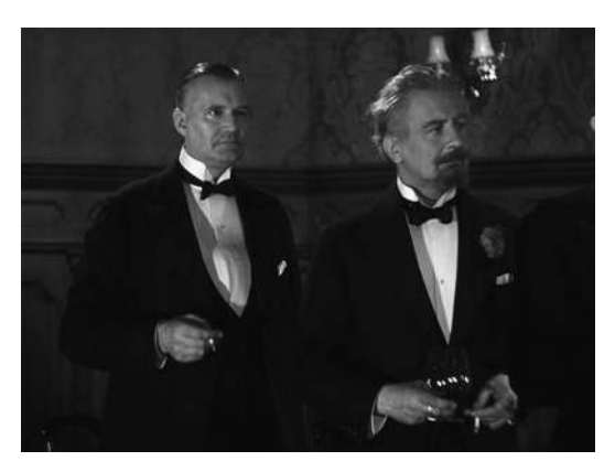
The dinner party.