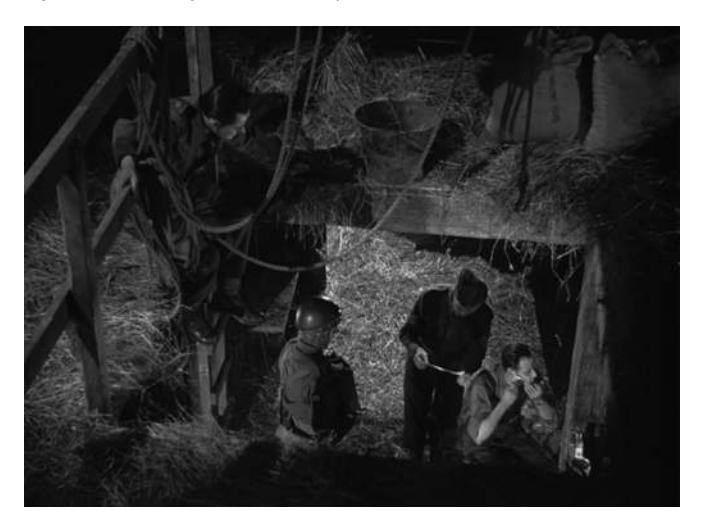
"The real thing!"

civilian and soldier that defined the conduct of almost all parties during World War II: "The preponderance of [civilian deaths] was no accidental or peripheral feature of [World War II]; it reflected the central significance of civilians in the conflict, the indispensable roles that they played in the war's outcome, as well as the vulnerabilities that they shared, as a direct consequence, with the soldiers."39 In addition to reflecting technological advances and, in particular, the exponentially expanded reach of aerial warfare, the broad militarization of the home front had far-reaching effects on the very idea of what war was and what it meant to imagine an end or an outside to war. As I suggest in the introduction, total war was as much a concept as a situation during World War II; it was how people thought about themselves and each other during war time.