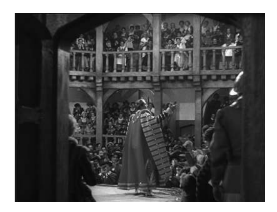
"Where is my gracious Lord of Canterbury?"