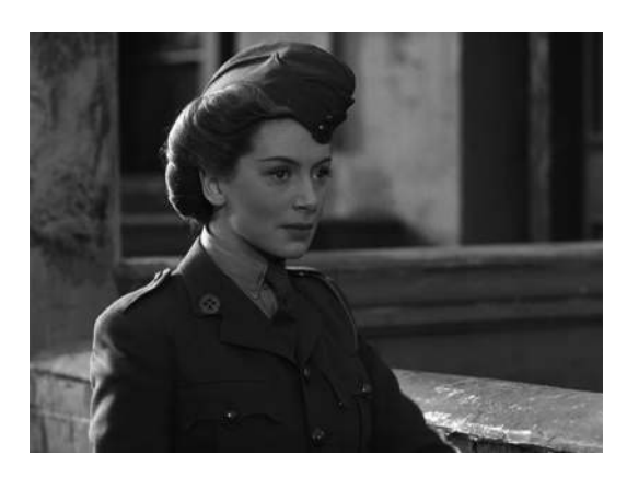
"I never got over it."