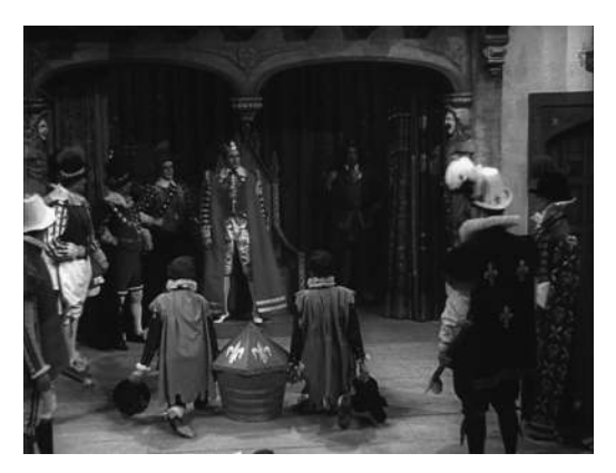
"I crept the camera back and back \dots "