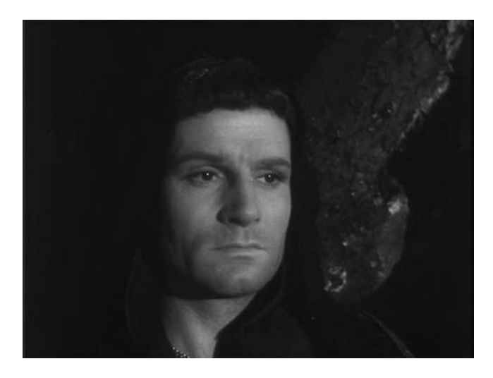
"What must kings forgo?"

Olivier thus uses specifically cinematic effects in order to offer the transformation of actor into character, exterior into interior, public into private as an allegory for what Ernst Kantorowicz famously referred to as the king's two bodies, the idea that the king brought together in one person