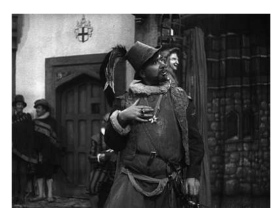
Enter ancient Pistol.