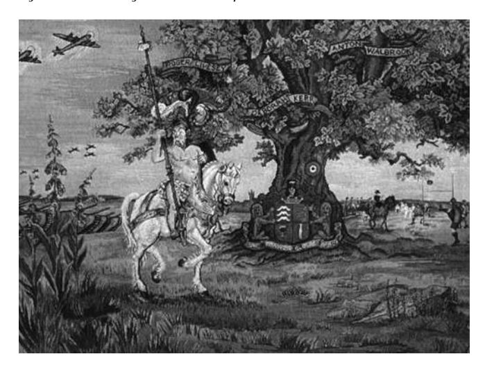
Et in arcadia ego.

history of European culture might best be understood as a continuous if serpentine line. Insofar as the film is, as I have suggested, concerned with the relation between the British past and a logic of total war that threatens to undo that past, the tapestry works both to suggest the long lifespan of courtly values in British and European life and another, darker story that calls those very values contrapuntally into question.