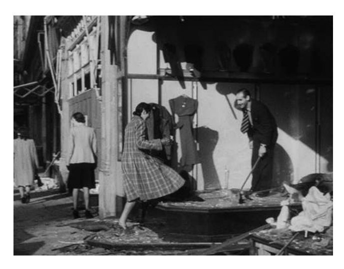
London can take it!

other avant-garde film makers—recognized how technical advances in film could be used to expand the image space and the promise of modernity to the masses: the possibility of combining collective activity with individual agency into free identity."68 Seen in these terms, Jennings's films are maybe the best because the richest expression of what we might think of as an official eccentricity, of minorness strategically cast as an ideological alternative to totalitarianism; they are instances of eccentricity—a free identity—put to work for the collective activity of national propaganda. <sup>69</sup> Jennings made the difference between his local, regionally specific, and recalcitrant propaganda and that of the Nazis explicit: "In a BBC broadcast, Jennings told listeners that [his film] The Silent Village portrayed 'the clash of two types of culture,' what he called 'this new-fangled, loudspeaker, blaring culture invented by Dr. Goebbels' against 'the ancient, Welsh, liberty-loving culture which has been going on in those valleys way, way back into the days of King Arthur."70