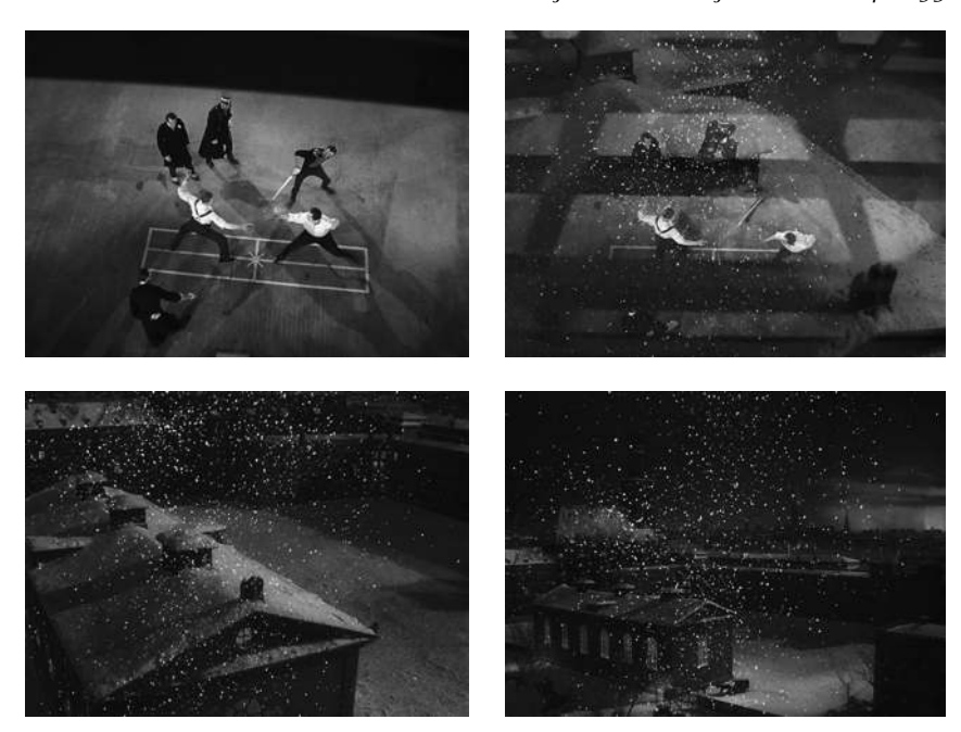
Then without a break . . .

as presence but also the difference between inside and outside. Just as the camera's long, limpid tracking motion across the pool seemed to undermine the difference between present and past, so does the subtle move toward and through the roof seem to undermine the difference between inside and out, between the interior, organized play-space of the gymnasium and the inchoate world beyond. The break or cut that shatters the effect of fluid singularity in Kane never arrives in Colonel Blimp. As a result, the scene encourages us once again to feel the absence of the cut, the break, the difference both in its own terms and in relation to cinema.