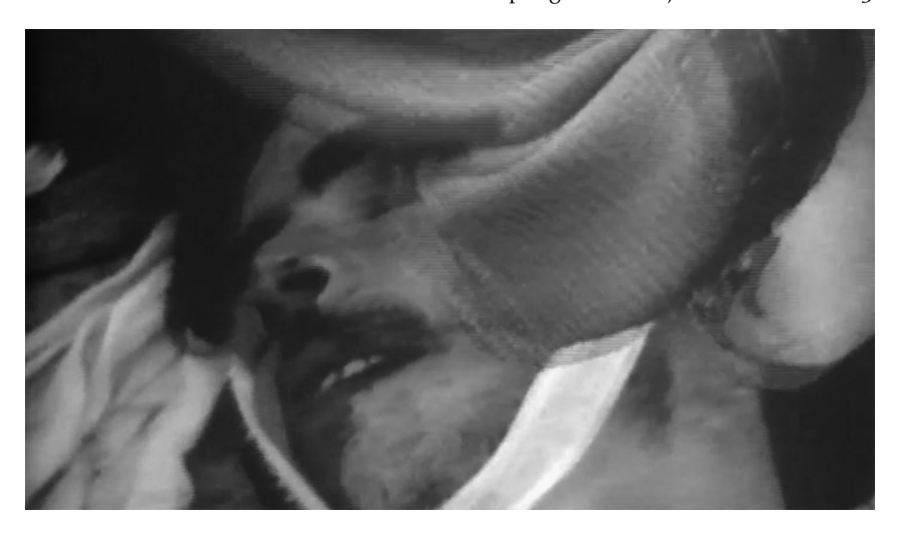
The pity of war.

in such a way as to identify what remains tragically the same from war to war: the degradation, the loss, the reduction of persons to things, and an overall sense of the tremendous, tragic waste of war.