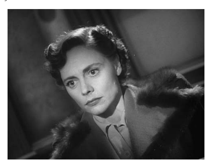
An extreme technique of emphasis.

the audience. It is a moment of emotional intensity powerful enough to tear the barrier that would keep the world of Brief Encounter separate from our own: "the camera tilts over, making her seem drunk or distraught as she goes to meet [the express]. It's a calculated effect, and Lean easily gets overcalculated—but in this case the vibrato works just because the image seems to be willed by the actress."141