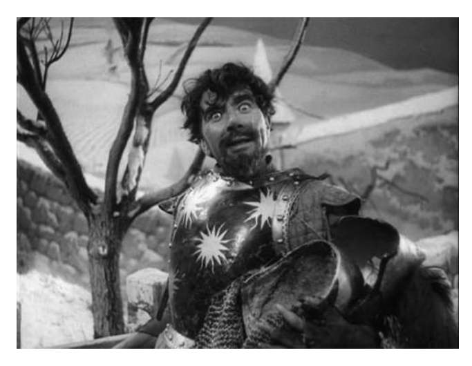
"To England will I steal, and there I'll steal."

The scene is notable for a few reasons. First, this is the only moment in the film's naturalistic third act when an actor turns to the camera in order to address to the audience directly. As already described, Olivier represents both Henry's soliloquy on the eve of Agincourt and Falstaff's dying memory of Hal's rejection as voiceovers spoken while the camera lingers closely on their pensive faces. His handling of those moments would seem to suggest the film's adherence to naturalistic rules governing the impermeability of the fourth wall. It is for that reason all the more striking that, between his beating and his departure, Pistol turns to the camera in order to engage the audience directly. This helps in part to solidify Newton's late place in the tradition of the clown or the Vice; as I said before, what differentiated the clown from other types of performances was exactly his tendency to break the performance's frame to improvise and to stake a claim as an actor or celebrity as much as a character. And, while Pistol's brief speech is not