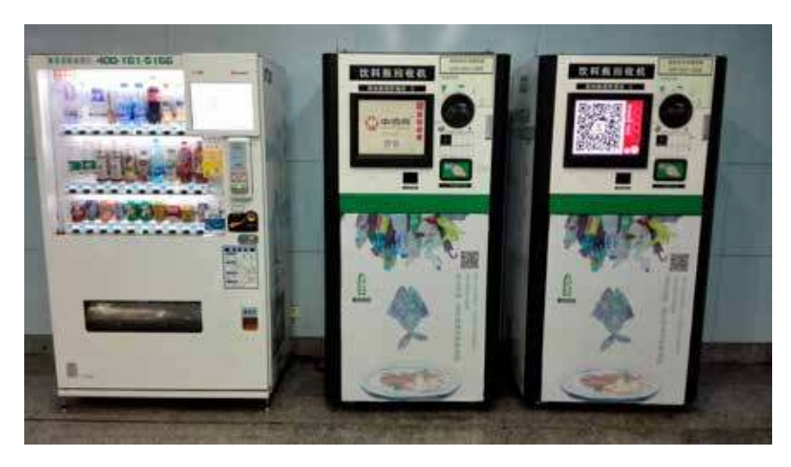
Illustration 2.2 Two RVMs operated by the Beijing Incom (Yingchuang) Resources Recovery Recycling Co. Ltd, at the Panjiayuan No. 10 Subway Station