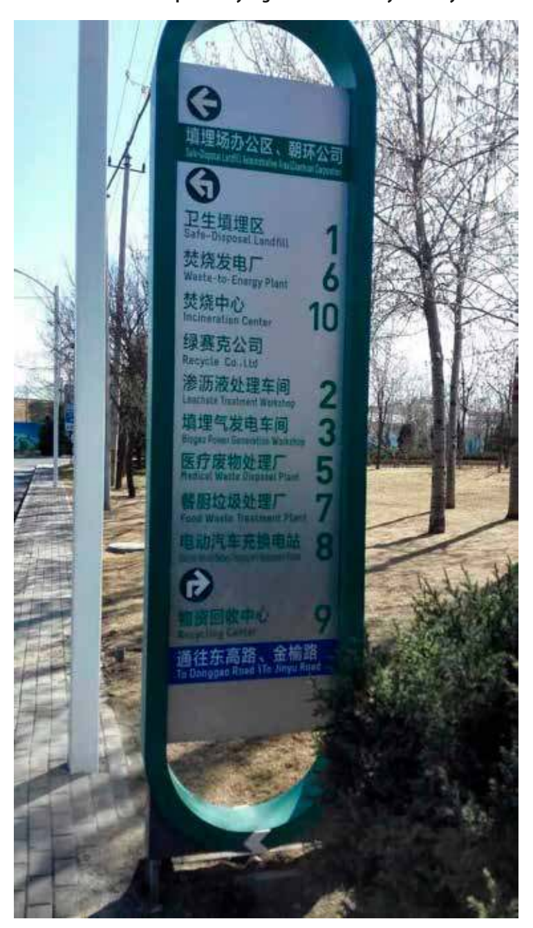
Illustration 7.1 Signpost showing directions to the various facilities at the Beijing Municipal Chaoyang Circular Economy Industry Park