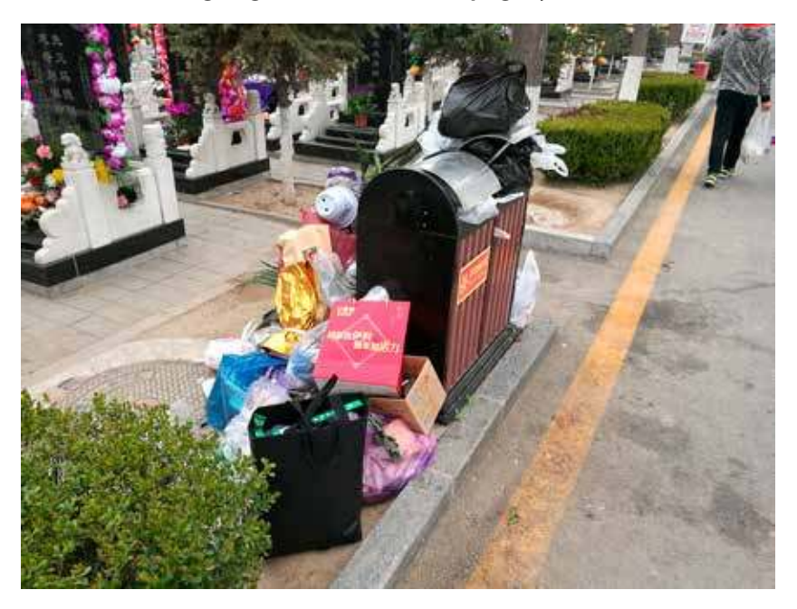
Illustration 5.1 Overflowing waste bins at a Beijing cemetery during the 2017 Qingming Festival, or Tomb sweeping day