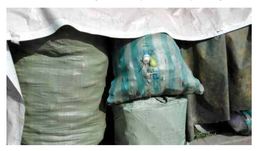
Illustration 4.1 Collected PET bottles and assorted plastics waiting to be moved to the next higher collection point for further processing, Haidian