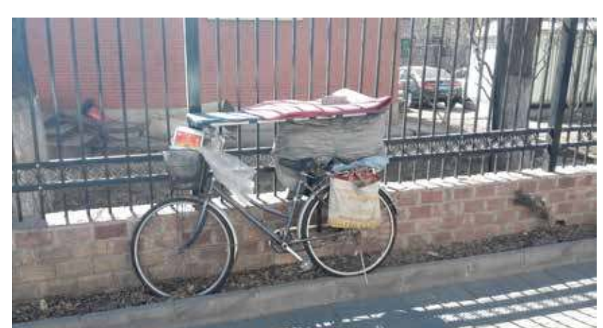
Illustration 4.3 A bicycle loaded with collected junk, Haidian District