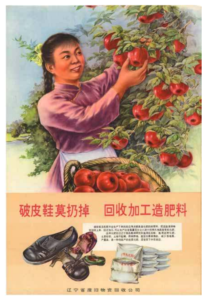
Illustration 1.1 Liaoning Old and Used Goods Collection Company (辽宁省废旧物 资回收公司). 'Don't throw away broken leather shoes, recycle them to turn them into fertilizer' ('破皮鞋莫扔掉回收加工造肥料')

Liaoning Old and Used Goods Collection Company, 1960s?, circulation unknown