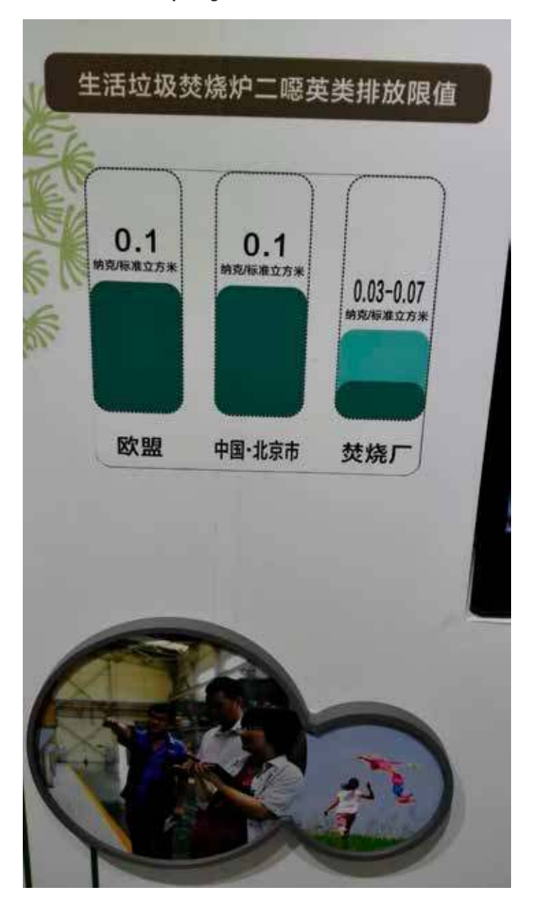
13 March 2017