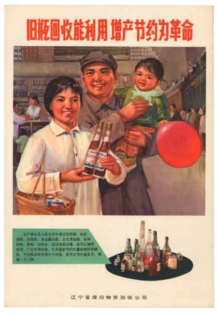
Illustration 1.2 Liaoning Old and Used Goods Collection Company (辽宁省废旧物资回收公司). 'Recycle old bottles to use them again, increase production and be thrifty for the revolution' ('旧瓶回收能利用增产节约为革命')

Liaoning Old and Used Goods Collection Company, 1960s?, circulation unknown IISH/Stefan R. Landsberger Collection. Photo © International Institute of Social History