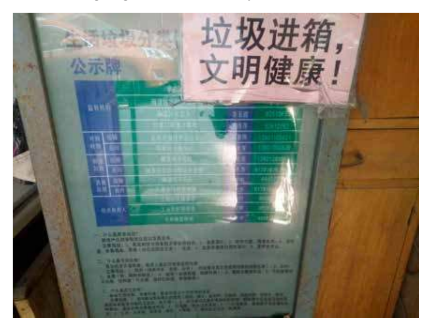
Illustration 3.2 A signboard put up in a residential community providing information on garbage classification and separation. The message stuck on the board urges people to dispose of their garbage in the bins, in order to promote civilization and health