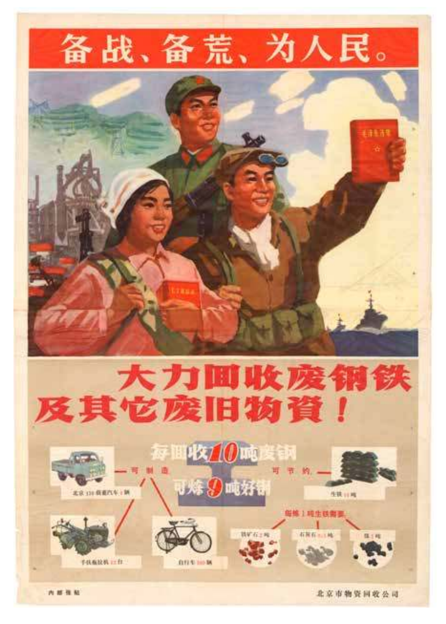
Illustration 1.5 Beijing Municipal Scrap Recycling Company (北京市物资回收公司). 'Strive to collect scrap metal and other waste materials!' ('大力回收废钢铁及其他废旧物资!')

Beijing Municipal Scrap Recycling Company, early 1970s, circulation unknown (internal use)