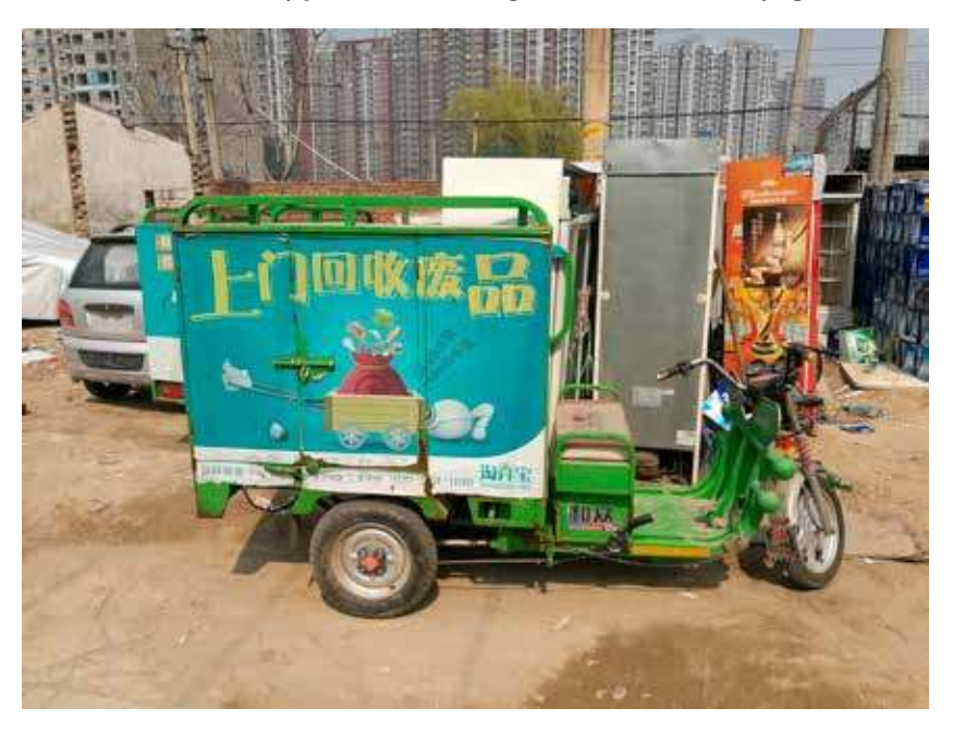
Illustration 2.3 A van operated by Taoqibao, at a Qianbajia waste collection point, formerly part of Henan Village, Haidian District, Beijing