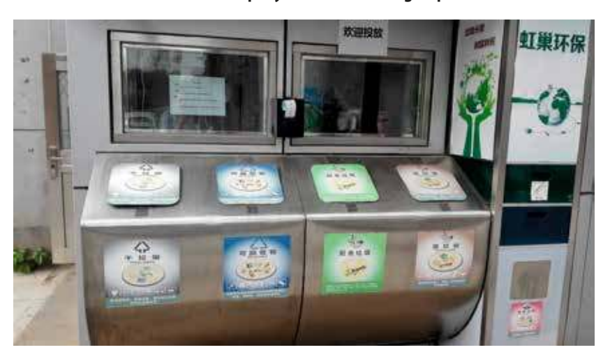
Illustration 3.4 Front view of a Red Nest in a Shunyi District residential community, designed and operated by the Hong Chao (Red Nest) Enviro-Tech Company. Note the RFID tag dispenser