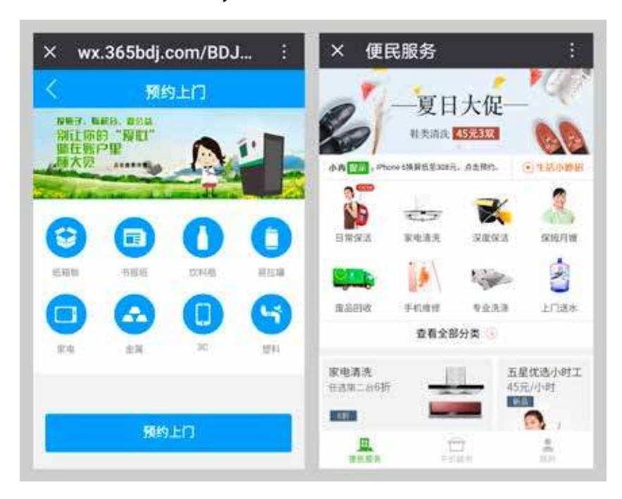
Illustration 2.1 Screenshots by the author of the Bangdaojia (left, Incom) and Zaishenghuo (right, Anewliving) apps showing some of their services. May 2018

seemed to have disappeared remained unclear. More and more frequently, information circulated that Taoqibao's board of directors had vanished, taking the investors' money with them; according to people familiar with Beijing business practices, this has happened often (Interviews, 2017). A year later, in 2018, the Taoqibao website has ceased operations and been taken over by a company called Men's Heaven (男人天堂); the site is unresponsive.