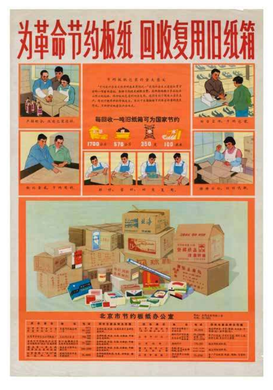
Illustration 1.4 Beijing Municipal Office for Saving Paper (北京市节约板纸办公室). 'Economize on paper for the revolution, collect and re-use old paper boxes' ('为革命节约板纸回收复用旧纸箱')

Beijing Municipal Office for Saving Paper, date of publication unknown, circulation unknown