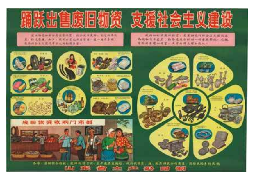
Illustration 1.3 Shandong Provincial Local Products Company (山东省土产公司). 'Eagerly sell old and useless materials to support the construction of socialism' ('踊跃出售废旧物资支援社会主义建设')

Shandong Provincial Local Products Company, 1960s?, circulation unknown IISH/Stefan R. Landsberger Collection. Photo © International Institute of Social History