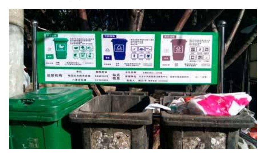
Illustration 3.1 Communal garbage bins on the grounds of a residential community. The sign indicates which garbage needs to go into which bin