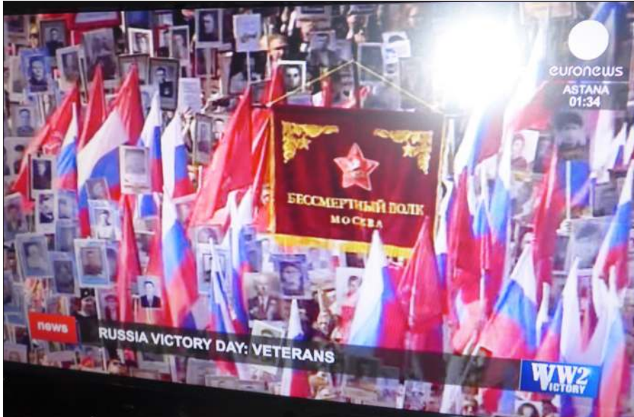
Figure 1. The bessmertnyi polk - Moscow, Red Square, May 9, 2015

Figure 1 illustrates a powerful recent political effort to mobilize the personal family ties into the service of expansion of patriotic unity feelings around the issue of celebrating 70 years from the end of World War 2 in Europe. The history of a war won (or lost) matters – and is made to work for – the future. New generations, carrying the photographs of their deceased relatives who were in the war, join the promotion of the new vigilance of defense of their country in the future. Adding the notion of eternity ( bessmertnyi , immortal) to the collective military unit ( polk , a battalion) carries the affective personal links with one's relatives forward to future readiness to devote the lives of the young (and their children) to the future political needs of the “fatherland”. Patriotism is promoted in all societies (Carretero 2011) and its function is set up ahead of time when it is needed to achieve concrete political goals. The nature of wars may change in history (Beck 2005; Leach 2000) yet these remain – as von Clausewitz (1908/1832) pointed out in the nineteenth century – a continuation of politics through military means (Roxborough 1994). The wars fought in the courts of law in any country, or between them, are peacetime continuations of the military acts on real battlefields.