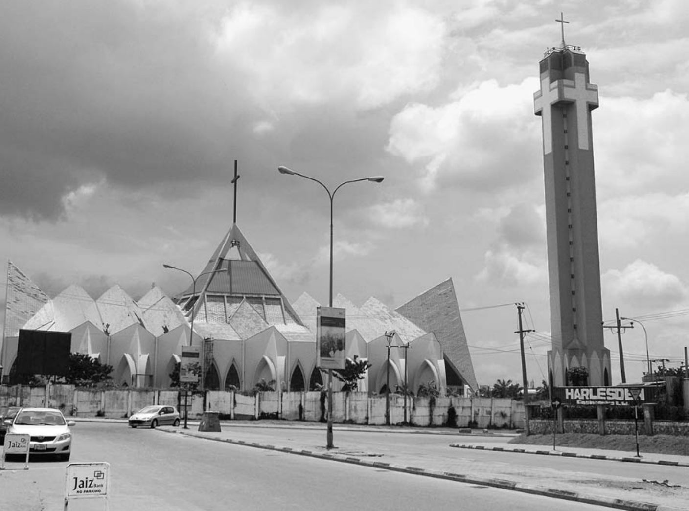
FIGURE 3.1 National Christian Centre in Abuja.

that of Living Faith, where hundreds of thousands of people gather during the church's annual Holy Ghost Congress.