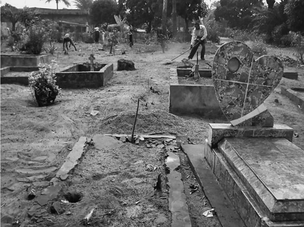
FIGURE 6.2 Cleaning session at the Nsele cemetery, Kinshasa.

The aim is not to judge who was good or bad, but rather to integrate the past and its actors into the sentimental consciousness of the present. EMM thus promotes a politics of memory and, through its tactile cleaning service, also of temporal atouchment , which aims at positing and inscribing the present into its own respective historical Gerwordensein , its have-become trajectory. This can be seen as a criticism not of contemporary politics but of the widespread culture of presentism and timelessness, the never-ending present in which so many Kinois are continuously locked up.