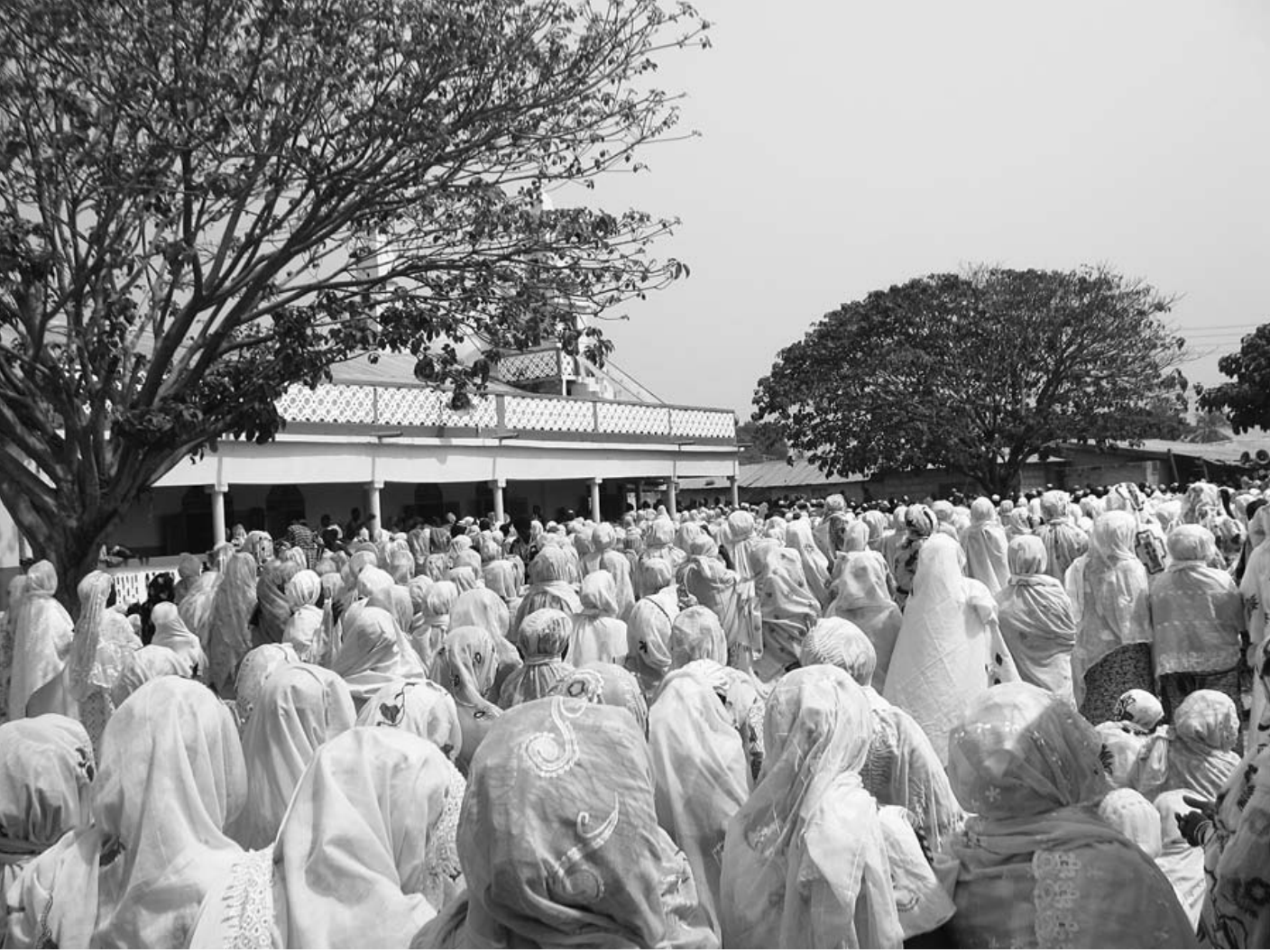
FIGURE 8.1 Women gathered for prayer at the Mawlid in Prang.