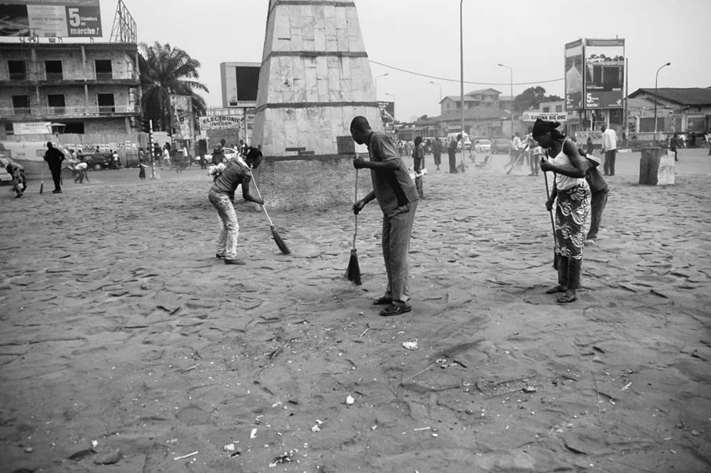
FIGURE 6.1 Messianiques during salongo at Rond-point Victoire. In the background, billboards advertise Joseph Kabila’s “Cinq Chantiers” program for the restoration of public infrastructure, to which Messianiques implicitly contribute.

costalism, contrasted with the focus on wider social issues that the Catholic Church had prioritized under its “liberation theology” (Matsuoka 2007, 53).