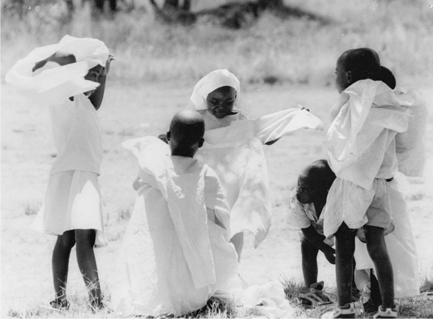
FIGURE 2.1 Children of the wilderness church.

anthropology and sociology of religion, where one must employ empirical methods of research, it became clear that my first book was not going to be about gender imagery in theological language. By the time I finished my first year as a lecturer in the history of Western theology at the University of Zimbabwe in 1996, I was used to seeing men, women, and children dressed in white robes walking past my house into the meadow across the road to pray; I also learned from watching the quiet mood associated with walking toward the sacred sites for prayer. “We are going to the masowe [wilderness],” said one of the young mothers, making sure I did not distract her by holding hands with a little boy of five or six years. Such direct encounters opened my eyes to fieldwork before I came across Ninian Smart’s book The Phenomenon of Religion (1978), an exploration of empirical ways of studying religion with what can be observed of religion, rather than its claims of truth as primary sources of knowledge.