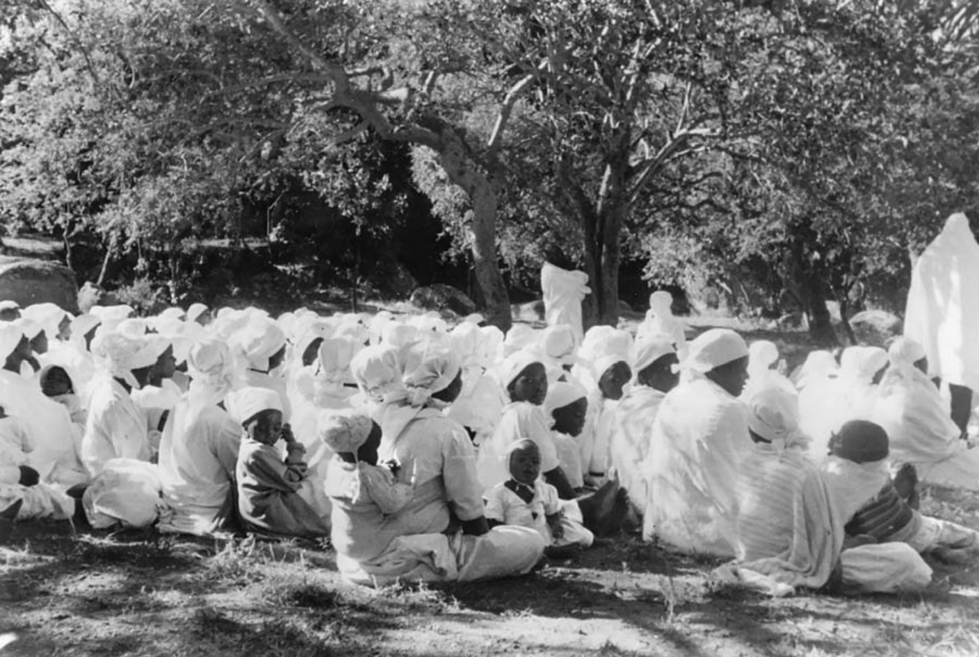
FIGURE 2.2 Revelation 3:8. “Wear white garments so that you may clothe yourself, and that the shame of your nakedness will not be revealed.”

are central to this chapter, where theology faces a rather special analytical challenge rooted in social anthropology.