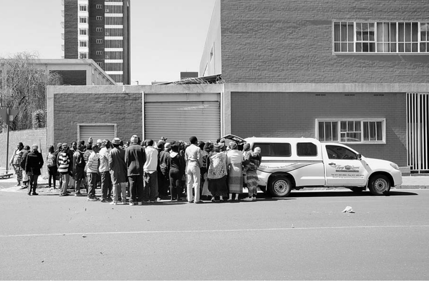
FIGURE 1.1 Mourners conduct a street-cleansing ceremony at the site of a murder and next to a newly gentrified area.

deeds, is common in the inner city. The affective force of fire and dereliction elicit multiple responses encompassing an array of actors and forces. In Cape York we see the contrasting dynamics of private-sector regenerations encounter affective regenerations inasmuch as they concern the lived experiences and security of the same spaces. Furthermore, this is not to place affect and emotion solely on the side of those who live in dark buildings: emotion is invoked by different actors, including property developers, as well as those who live in dark buildings—an act of coding, the affective responses to the instability and politics of urban infrastructures.