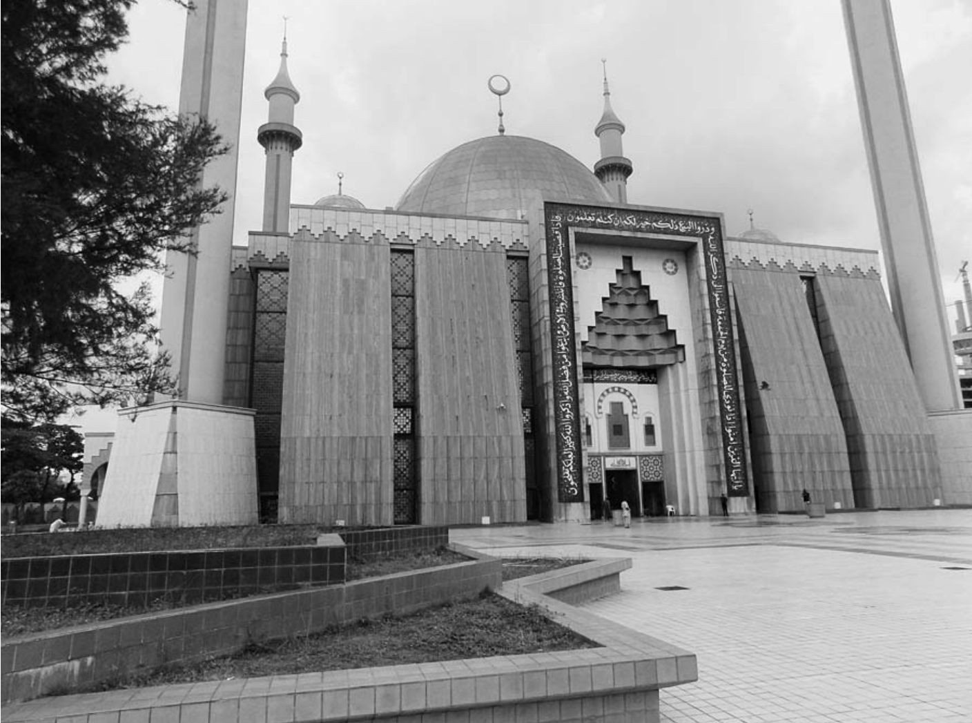
FIGURE 3.2 National Mosque in Abuja.

church that can accommodate tens of thousands, as in the case of its headquarters in Lagos, Christ Embassy built numerous churches in different parts of the capital city. The central church, which serves as the church's regional headquarters, is located at Durumi, Area One. It is a huge, impressive structure designed like a modern secular building, able to accommodate up to five thousand people in my estimate. The stage is designed and decorated with small geometric objects like cylindrical forms, pyramids, and polygons coupled with colorful flower arrangements. The stage's main color is blue, combined with other colors, such as gold and white. The entire stage is illuminated by different colors of light.