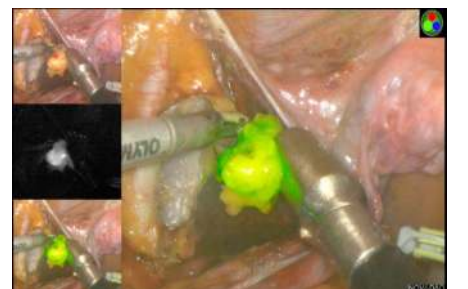
Fig. 4: Excellent discrimination between fatty tissue und lymph nodes in the parametrium