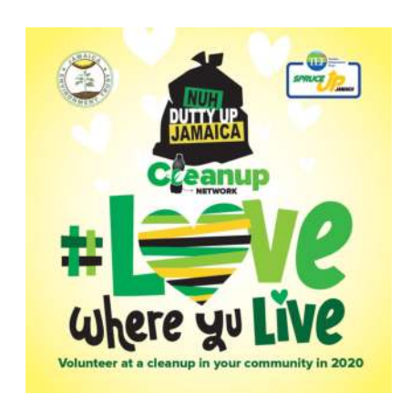
Figure 4: Love where yu live (Jamaica Environment Trust 2016)