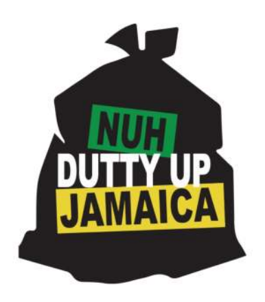
Figure 1: Anti-Litter Campaign Logo (Jamaica Environment Trust 2016)