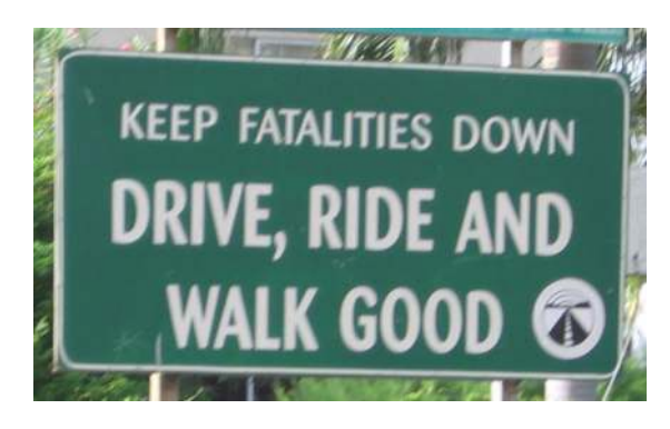
Figure 5: Government road sign using elements of Jamaican (Dray 2010)

For this sentence to be fully Jamaican, "where" would have to become "we" or the more popularly used form "weh". The limited use of marked words such as "di" and "yu" reflects a mere token usage of Jamaican.