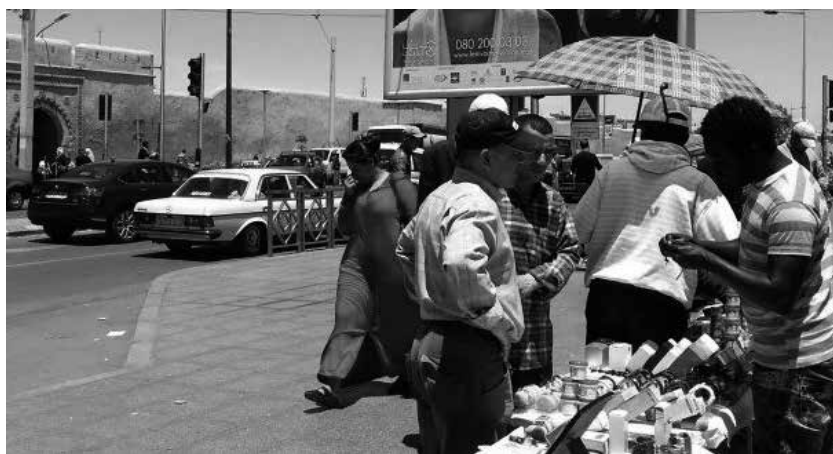
Figure 3.2 Street pedlars along the main road, next to the walls of the Medina, Rabat