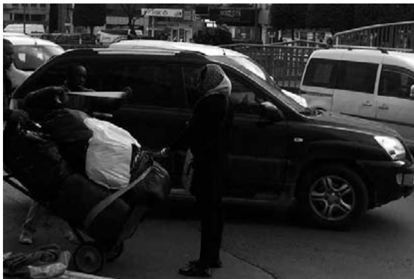
Figure 4.1 Kumkapı, packing and carrying goods before shipping them overseas