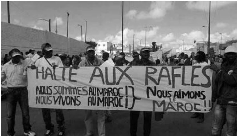
Figure 3.1 A protest by migrants in the streets of Rabat, ‘Halt Raids, we are in Morocco, we live in Morocco → we love Morocco’

Source: Unknown. The picture has been used on several occasions since 2012. See for instance, Le Gadem dévoile la liste des lieux de detention des migrants au Maroc [Gadem disclose the list of detention places of migrants in Morocco]. Retrieved 15.03.2015 from http://www.medias24.com/SOCIETE/152908-Le-Gadem-devoile-la-liste-des-lieux-de-detention-des-migrants-au-Maroc.html#sthash.cM7mFIU5.gbpl