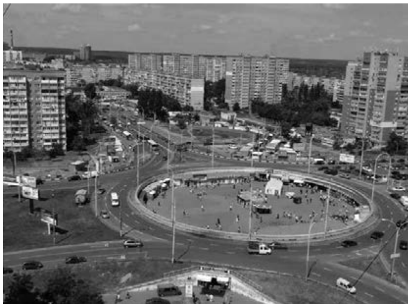
Figure 9.4 Traffic circle and Metro terminus at Heroiv Dnipra, north of the city center

sprawling high-rise residential complex on the Left Bank named Troyeshchyna. The high-rises of the Right Bank are seen in the far background across the Dnipro (also visible, but faintly). The large middle ground is what is left of the green village of Troyeshchyna that predates the high-rise landscape. There are fields, small farm houses, smaller outbuildings, and tall trees, as well some larger structures that have intruded more recently amid them as comfortable homes in the "suburbs." The new houses that are clustered in the center of the photograph on the far side of the high wall are oversized "suburban" homes on undersized plots that had once been part of village Troyeshchyna. Some or all of them were probably erected by a developer on speculation, while others are homes that people put up for themselves on land they had bought from a speculator. The structures that are arranged in the horizontal pattern in the foreground are parking garages for private automobiles. They are rented spaces, but some could also be owned, and some could be used to store belongings other than an automobile. There are hundreds of spots in this garage complex. It provides secure, gated, and guarded parking for owners of cars who live in the high-rise buildings such as the one from which I took the photograph. While some people might use