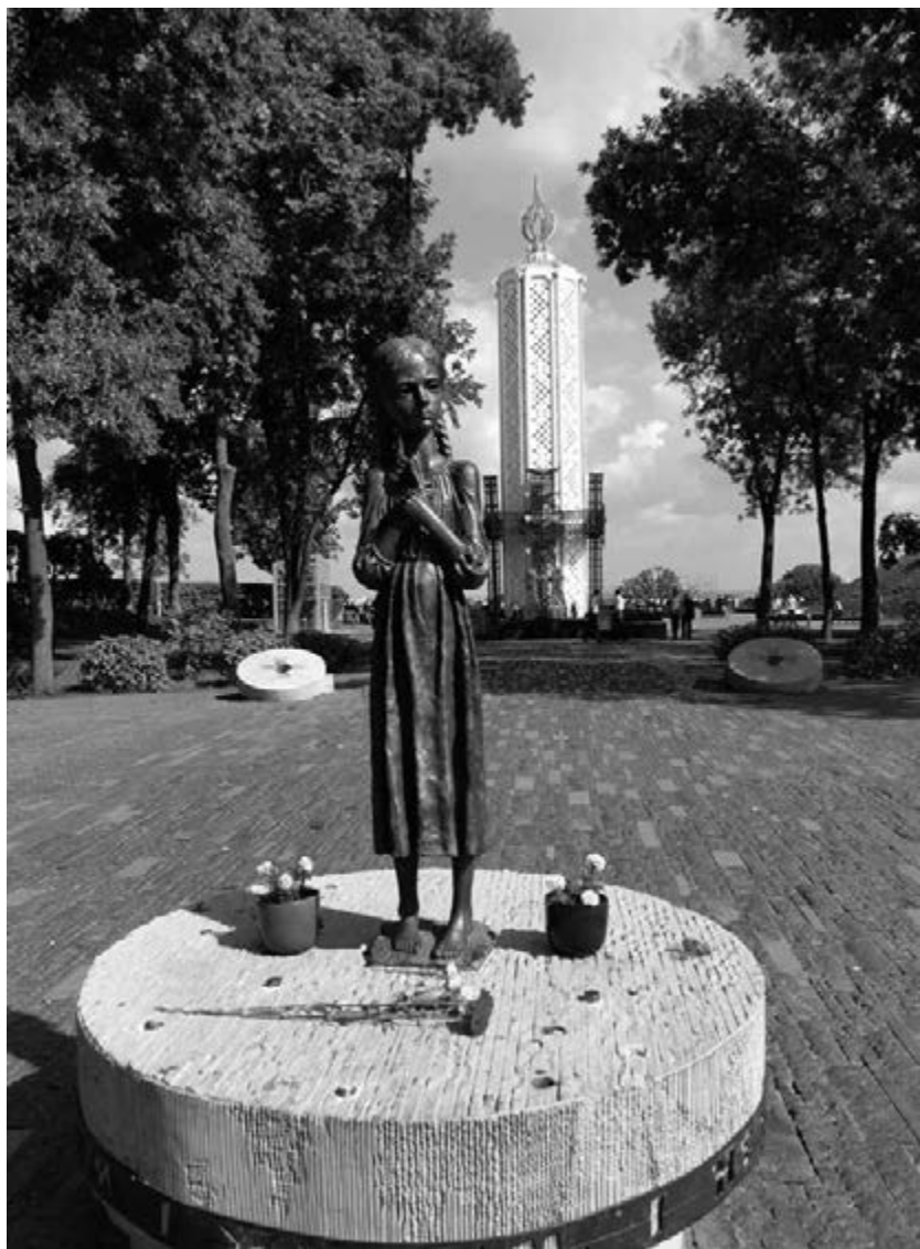
Figure 5.3 The candle-shaped Holodomor Monument and Museum and a statue of a hungry girl

some of the older visitors appeared to be survivors; they searched the lists for the familiar names of neighbors and family members and to seek out other memories. Lingering in this somber, darkened space seems natural, and when we finally do emerge into the daylight, it is through a door opposite