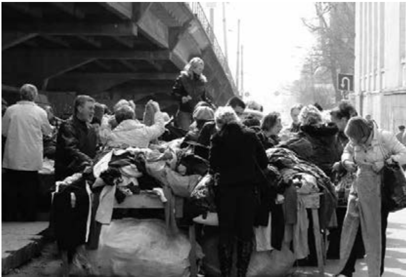
Figure 8.4 A view of a table at the secondhand market at Shulyavska before the market was burned down

The situation is more precarious for other categories of markets. For instance, since the Soviet period, there has been an explosion of bazaars that specialize in sales of used clothing and other secondhand goods. They are popular with bargain hunters who look for just the right item, even a famous brand, at deeply discounted prices. Some of the goods originate as items that had been worn locally, but most of the inventory comes from abroad, and much of that had been donated by foreign charities with an interest in helping the poor. Foreign aid shipments, in turn, have a way of being hijacked by shady entrepreneurs who sell what they have taken instead of distributing it free, with the result that in cities and towns all over Ukraine (and in other poorer parts of Europe and other continents, too) there are booming “secondhand” markets where people know to go for used clothing in good condition and foreign cachet. In Kyiv, the biggest such markets have been at Shulyavska and Lisova (Figure 8.4). Both are names of Metro stations, with Shulyavska being on the Right Bank near the huge Bilshovyk (Russian: Bolshevik) industrial complex that was once a key