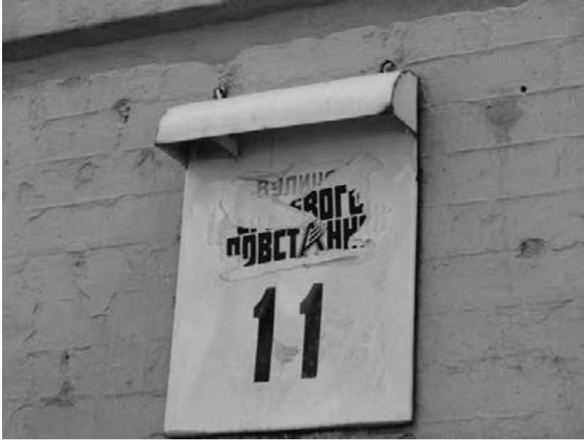
Figure 5.1 Sign with conflicting street names

dimensions. Furthermore, there are quite a few instances of “place-name wars” to be seen in which opponents of a given street name paste a printed sticker with a preferred name over the one they dislike, and then where opponents of the opponents either tear way the graffiti sticker, or slap one of their own atop it.