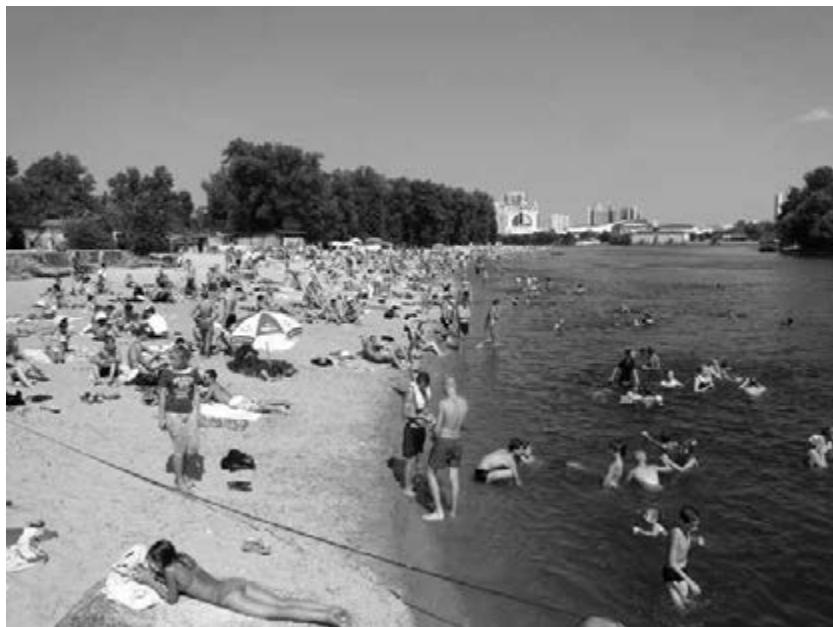
Figure 12.1 Kyivans in the sun together