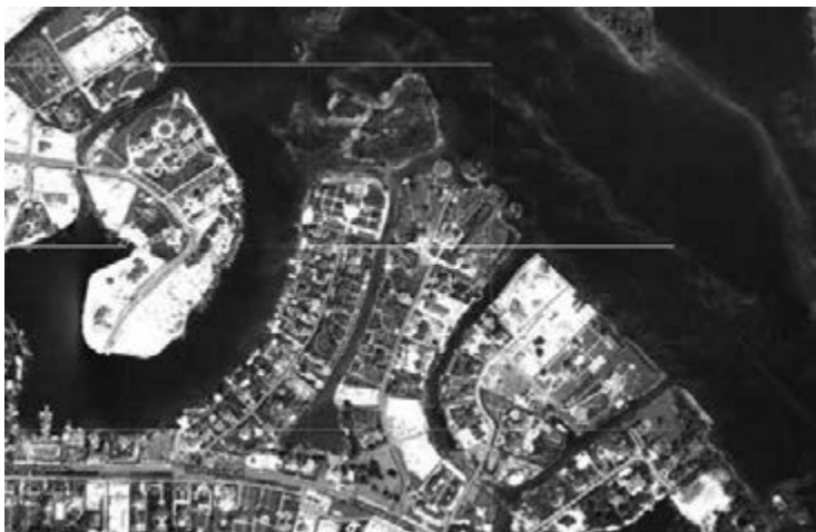
Figure 7.4 The mansions of Koncha Zaspa as seen via Google Earth

Koncha Zaspa is the neighborhood where every past and present president of Ukraine lives (yes, president Yanukovich lives here, too, in addition to being Lord of Mezhyhirya), as well as so many other of Ukraine's richest and most influential leaders. Among the other people we have met in this book, Koncha Zaspa includes controversial Minister of Education and Science Dmytro Tabachnyk, former Mayor of Kyiv Leonid Chernovetskiy (when he is not on the lam), and former Prime Minister Yulia Tymoshenko (when she is not in prison). Other residents are current Prime Minister Mykola Yanovych Azarov, Head of the Verkhovna Rada Volodymyr Mykolaiovych Lytvyn, Prosecutor General of Ukraine Viktor Pshonka, former Kyiv Mayor Oleksandr Oleksandrovych Omelchenko, former Head of the Verkhovna Rada Oleksandr Oleksandrovych Moroz, and another former Head of the