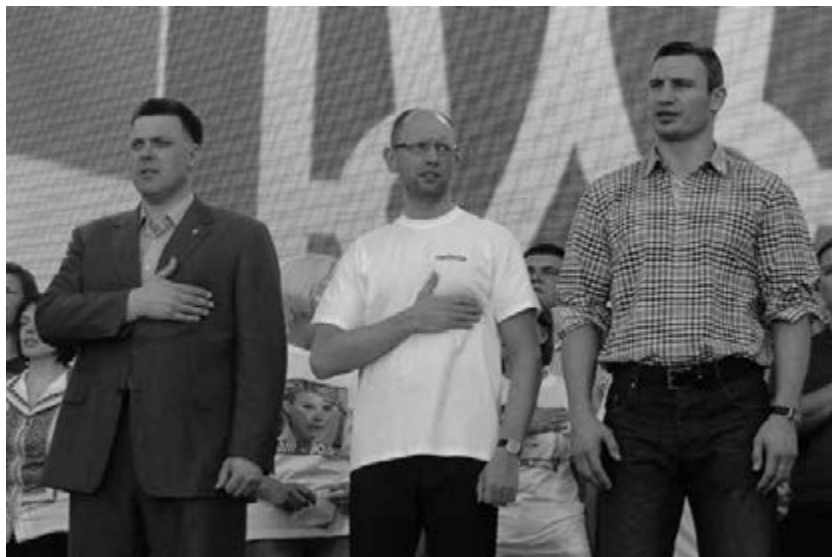
Figure 4.2 Leaders of the three main opposition parties in Ukraine singing the national anthem after signing their historic accord. From left to right they are Oleh Tyahnybok, Svoboda Party; Arseniy Yatsenyuk; Batkivshyna Party; and Vitaliy Klitschko, Udar. In between these men, we can see other dignitaries wearing T-shirts in support of freeing former Prime Minister Yulia Tymoshenko from prison.

had in turn been vacated by their marching nemeses. They called their event a “rally against fascism.” Because their political base is the Russian-speaking east and south of Ukraine, the Party of Regions strategy is to demonize the opposition as dangerous Ukrainian nationalists, Nazi sympathizers, and bigots against all things Russian, including the very many Ukrainian citizens who speak primarily Russian. They are enabled in this strategy by the apparent affinity of right-wing Ukrainians, including quite prominently some tough-looking skinheads, for the Svoboda Party, and by Svoboda’s own origins in 1991 as the “Social-National Party.” Its logo at the time resembled a swastika. Svoboda denies that it is racist or Nazi, and Tyahnybok gives speeches that I think express love for Ukraine without being bigoted, but again and again I have seen and heard creepy people and disgusting words from those who attend Svoboda rallies. Maybe they are plants, maybe they are not, and maybe Svoboda itself is a plant in order to discredit the opposition. It seems that there are as many opinions on the subject as there are political commentators. All of this fits what we are discussing in