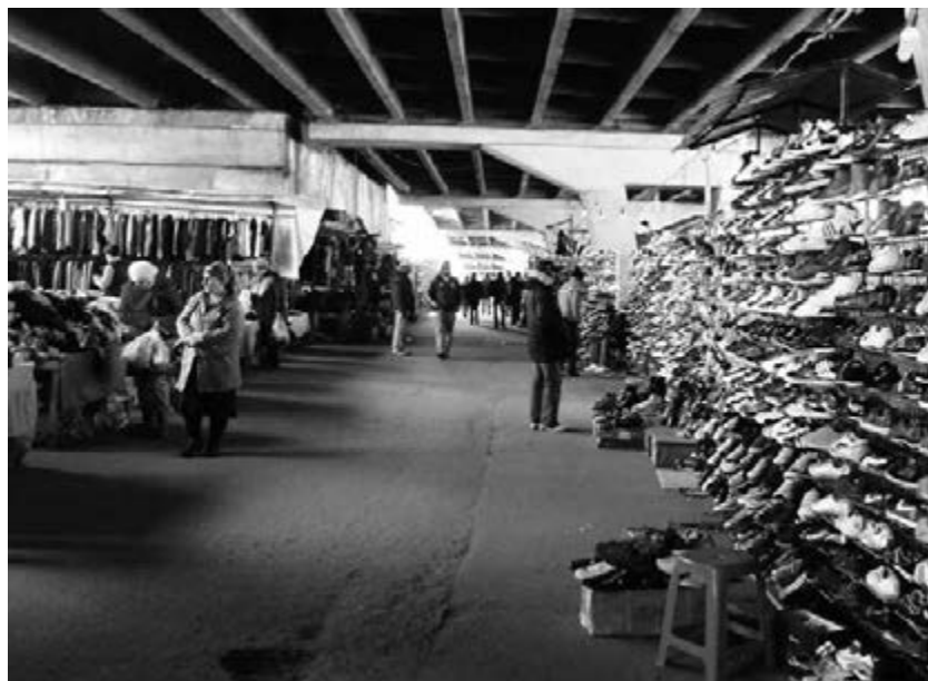
Figure 8.5 African vendors and their merchandise in the under-highway section of Shulyavska Market