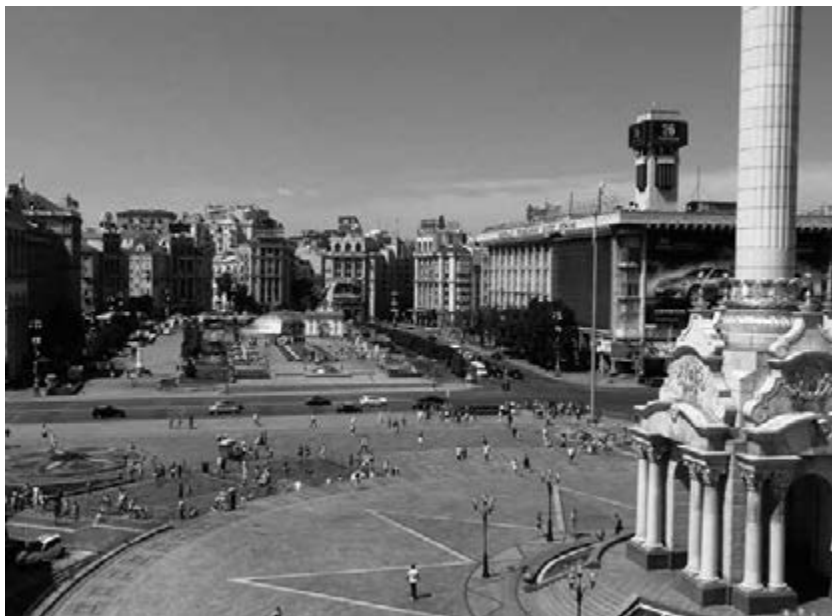
Figure 6.2 Independence Square. Khreshchatyk crosses the scene and divides the square into two halves. The lower portion of the Independence Monument is on the right.

what is wrong. Put simply, reconstruction after World War II created an ill-conceived architectural ensemble that has never been undone and that seems to be getting worse as “improvements” are added. Moreover, Maidan seems to be a lot less “public” than it used to be, with increasing restrictions as to access and what can take place.