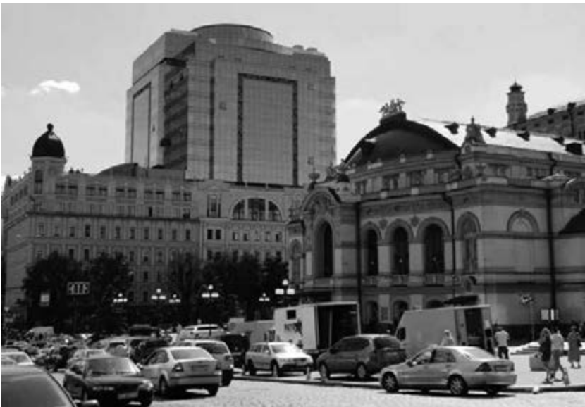
Figure 7.1 A glass-skinned “monster” rising from within historic buildings in the center of Kyiv. The building to the right is the city’s famed Opera. Note also the traffic and the vehicles parked on sidewalks.

The word monster is used in both Ukrainian and Russian to refer to intrusive new buildings that are built without neighborhood welcome. They rise up from the earth and devour the city, something like the monster Godzilla emerging from Tokyo Bay to wreak havoc on Japan's capital. In Kyiv, the most aggressive monsters tend to be high-rises for rich people. They wreck history, historic cityscapes, and the natural environment, and impose themselves on existing infrastructure such as transportation or parking spaces, where they wreak havoc as well (Figure 7.1). They are built without reference to any overall city plan, in part because Kyiv does a very poor job of planning where to build, as well as without attention to zoning, in part because Kyiv zones so poorly. They simply appear wherever a developer has