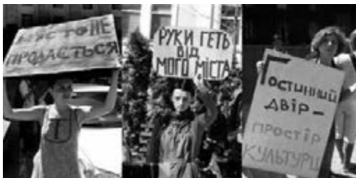
Figure 11.2 “This city is not for sale!” (right), “Keep your hands off of my city!” (center), and “Hostynyi Dvir – A Space for Culture” (right)

The main objective of anti-development protests is to gain a greater voice in decisions about changes in land use and other aspects of city planning. To this end, activists are learning how to organize and fight back, how to