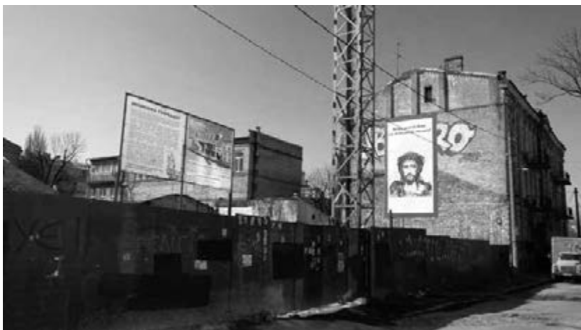
Figure 11.3 A controversial new construction site. The Ukrainian Orthodox Church, Kyiv Patriarchate, is building the new office building that is shown on the billboard in an historic part of the city, on the site of old buildings that had been taken down. The Jesus Christ with thorns placard reads, "Dear Lord, help us to save Kyiv from illegal construction."

The most recent (2012-2013) hot spot for Save Old Kyiv and many other activists, including a fast-emerging new NGO called Pravo na Misto (The Right to the City), has been a place called Hostynyi Dvir (roughly, The Welcome Courtyard or The Hosting Place) (Figure 11.4). Since early in the 19 th century the building has served as a commercial center where craftsmen and traders from other cities could come to Kyiv and have a place to set up workshops or studios and to sell their wares. The structure is located