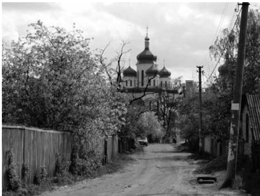
Figure 5.4 Cathedral of the Holy Trinity, a new church in Troyeshchyna

where the church envisions a greater national presence for itself. This was a decision that the hierarchy of the Orthodox Church opposed, particularly the Moscow-based Orthodox Church, on the grounds that Catholics were making incursions onto their turf.