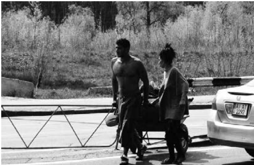
Figure 8.6 A Roma husband-and-wife team of metal scrap collectors at work

Roma camps sometimes have sizable piles of rusted and twisted metal that await truck transport for sale. Those same camps are also known to have terrible housing conditions that are sometimes nothing more than plywood or cardboard, or a rusted auto body, and essentially no running water and no sanitary facilities. They are squatters' camps on public land, and are often cleared by authorities against residents' protests on grounds of public health. There are also quite a few instances where Roma camps