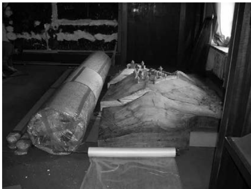
Figure 2.1 Exhibits from the Museum of the History of the City of Kyiv being packed up for moving to limbo