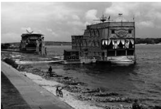
Figure 10.2 Former restaurant-nightclub boats docked in limbo along the Dnipro River

Until about mid-2010 when there was a government crackdown for reasons that I speculate about below, Kyiv’s beautiful river, the Dnipro, was lined at certain banks with some 20 or 24 (sources are inconsistent) floating hotels, restaurants, nightclubs, and until they were banned in Ukraine in 2009, casinos (Figure 10.2). In Ukrainian, such boats are called debarkadery (singular debarkadera ), “landing-stages.” They were most heavily concentrated near the center of the city along the right bank of the river in Podil and beneath the city’s beloved bluffs and golden-domed historical landmarks. They floated on the river but were not necessarily navigable. Almost all were permanently moored to the shore and were accessible by gangplank. Not all of these places were openly associated with the sex trade, and some were