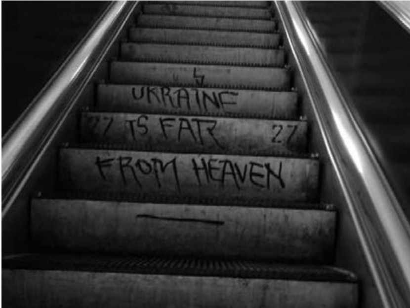
Figure 1.1 “Ukraine Is Far from Heaven” graffito

to a total now of less than 46 million – a net loss of 12 percent in less than two decades. Remittances from abroad prop up not just individual families or villages in poor regions, but the economy as a whole, as at least 7 percent of the nation’s workforce is employed beyond Ukraine. Neighboring Russia and Poland rank first and second in this regard, but Ukrainian workers are also very prominent in the Czech Republic, Portugal, Italy, and Spain, as well as in other EU countries, in North America, and in parts of Africa and the Middle East, notably Libya (medical personnel), Nigeria (oil and construction engineering), and Dubai (tourism economy). I met immigrants from Ukraine during my years living and working in Japan. As a whole, the emigration is both a brain drain and a labor drain, involving many of the best and brightest of the country, as well as many of the hardest-working individuals. The result is not only smaller population totals for Ukraine (peak in 1993 at 52.2 million; 2012 population at 45.6 million), but also a country that is poorer and more vulnerable to the demons who feed off what is left. In fact, there is so much emigration that black humor speaks of the need to turn off the lights at Kyiv’s Boryspil Airport when the last Ukrainian departs.