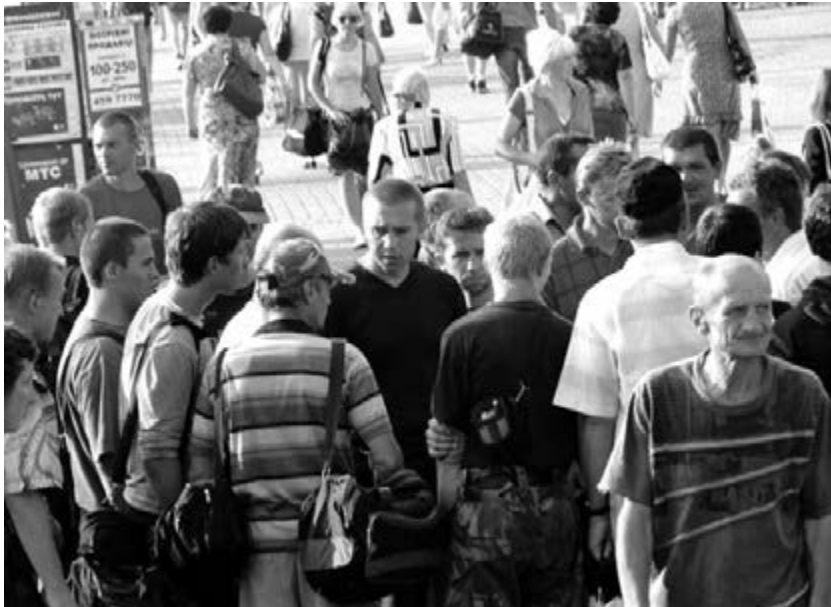
Figure 8.1 Laborers gathered around a recruiter for day work outside Kyiv's central rail station

People who are struggling seem to be everywhere in Kyiv. They are camped on benches in public squares and along main streets, work as petty vendors in pedestrian underpasses and on their stairways, and live in back lots, in derelict houses, and other hidden spaces. Away from the center, there are even more poor people, although densities might be lower. There are districts with low rents and poor-quality housing, inexpensive apartments