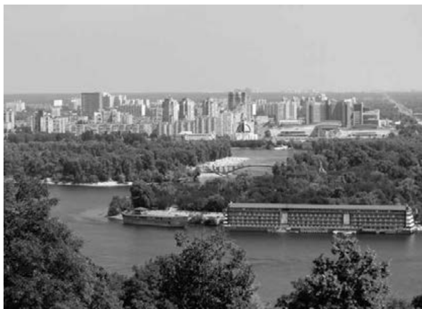
Figure 1.3 A view of Kyiv across the Dnipro River