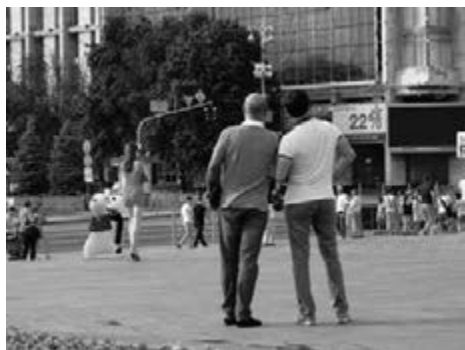
Figure 10.1 Foreign men “shopping” along Khreshchatyk at Independence Square

even a joint departure. My female students and other young women I know in Kyiv tell me that they are continually accosted by foreign men when they are in the city’s center, most often and most obnoxiously by Turks and other apparent Middle Easterners. Some women have said that they no longer enjoy going to Khreshchatyk for this reason.