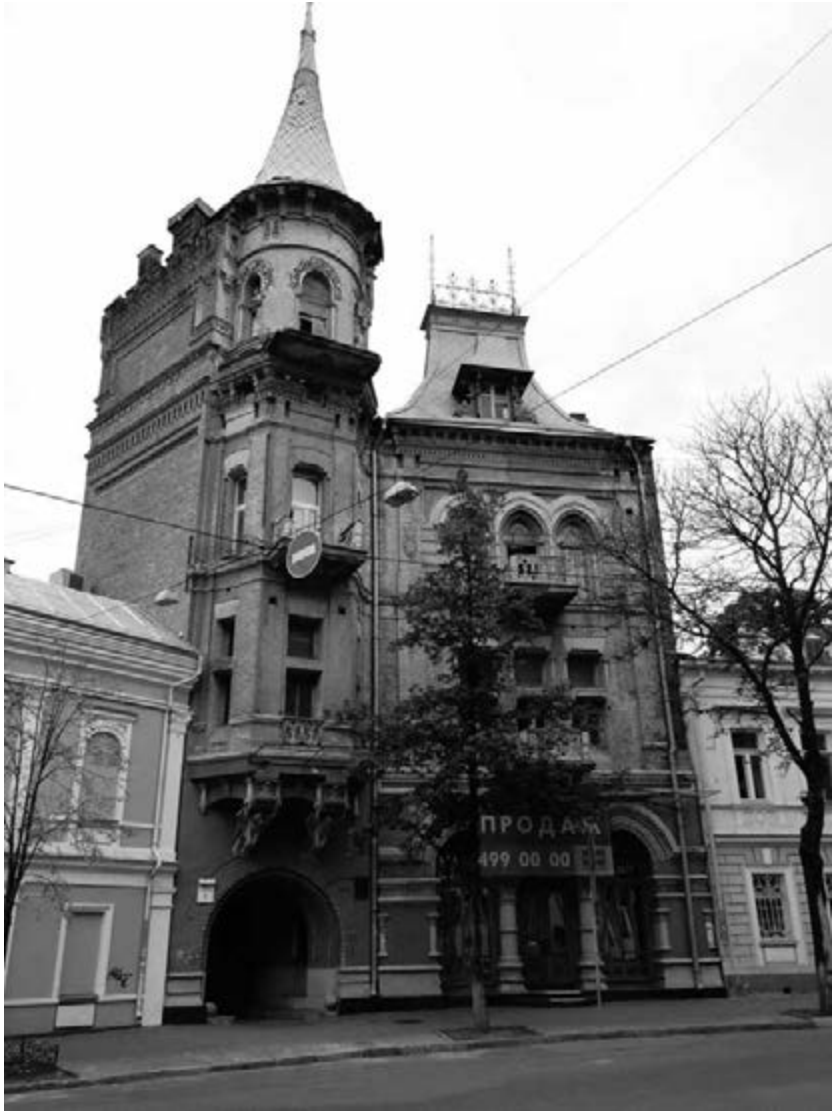
Figure 6.1 1 Yaroslaviv Val

parks and playgrounds and other public spaces that can be gotten under the table, where they hastily construct large buildings much more cheaply than the cost of restoration of old properties. The Kyiv Post article had phrased it nicely: “Developers prefer cheap and ugly greenfield construction to expensive and laborious historical renovation.” Another option for developers is to build on vacant land or on sites in the center that are easy to clear,