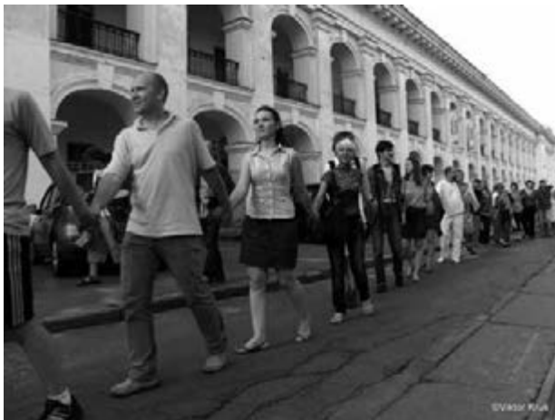
Figure 11.4 Kyivans encircling Hostynyi Dvir in a symbolic action to defend the building from developers (Photo courtesy of Viktor Kruk)

The background is this. First, Hostynyi Dvir is indeed in the very center of historic Podil (Chapter 6). It is near the Kontraktova Ploshcha Metro Station that serves Podil, and is surrounded on all four sides of its rectangular footprint by other major landmarks. Its immediate neighbor to the north, in the direction of the subway station, is Kontrakova Square and its landmark statue of Hryhoryi Skovoroda. To the south is a companion square that is centered by another landmark statue, that of Hetman Petro Sahaidachnyi