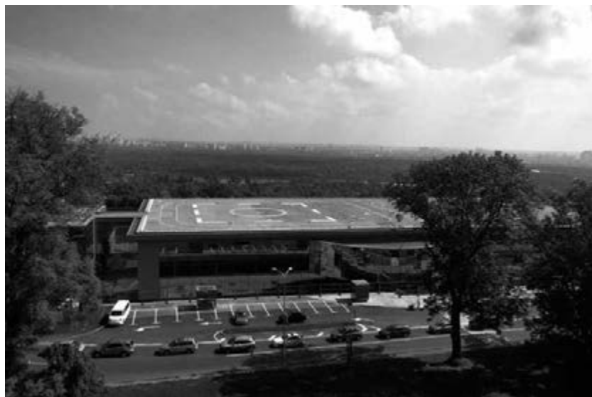
Figure 3.4 The helipad from hell