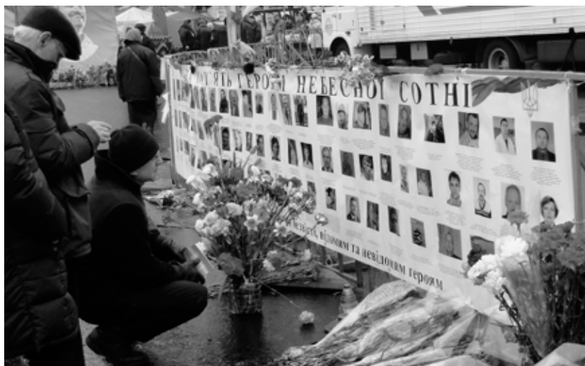
Figure 13.1 Honoring the fallen at Maidan Nezalezhnosti after the killings of mid-February, 2014