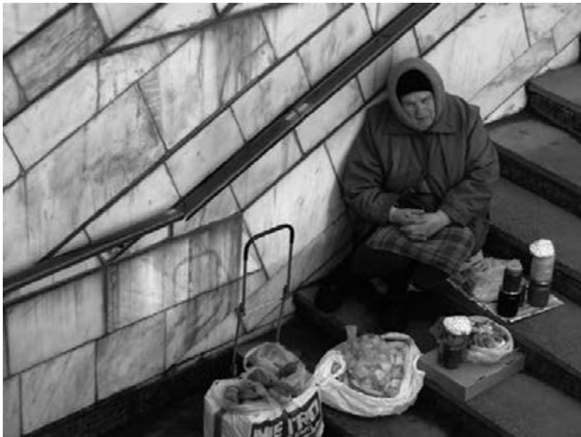
Figure 8.3 One of the countless petty vendors in Kyiv, a great many of whom are elderly women

There is hard work and little pay as well in petty trade, another occupation in which we see Kyivans of all ages struggling to make a living. There are vendors at pretty much every venue where the public gathers or passes: the central train station, Metro stations, bus and marshrutka (minibus) stops, pedestrian crossings and underpasses, busy sidewalks, the fronts of