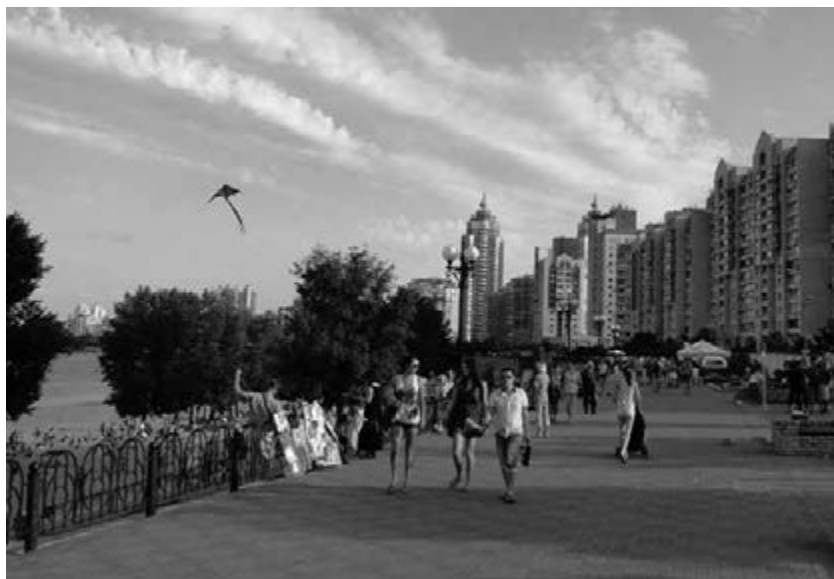
Figure 9.6 Kyiv relaxing. The photo is of the walk along the beach in Obolon.

Figure 9.5 looks across a slice of the Left Bank Osokorky district along a stretch of a wide highway (Brovarskyi Prospekt) between Osokorky and Pozniaky Metro Stations. This is a fairly new district with considerable ongoing construction. We see busy traffic on the road, tall new apartment and condominium buildings beyond, a series of new commercial structures (offices and shopping) at their feet, and a rising forest of billboards. The foreground, by contrast, is a world of pedestrians on long walks to the subway or bus stops, and some of the small, table-top businesses that serve them. The pedestrian who does not own an automobile is at a disadvantage, as the scale of the neighborhood and the distances involved are better suited for automobiles. Windy days, driving rains, the colds of winter, the summer heat and humidity all make this a miserable world for pedestrians. It seems ironic that such a difficult terrain was conceived by Soviet planners before people in any numbers owned automobiles; at least there was equality of suffering.