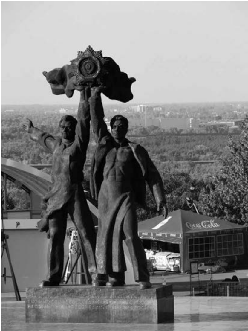
Figure 3.1 Under the People’s Friendship Arch

muscular male workers, one Russian and the other Ukrainian (which is which is neither evident nor important), who together and triumphantly hold aloft a characteristically Soviet, oversized “Soviet Order of Friendship of Peoples” medallion (Figure 3.1); while off to the side are granite sculptures of Ukrainian Cossack leader Bohdan Khmelnytskyi and other solemn principals at the 1654 Treaty of Pereyaslav that formally bound Ukraine to Russia.