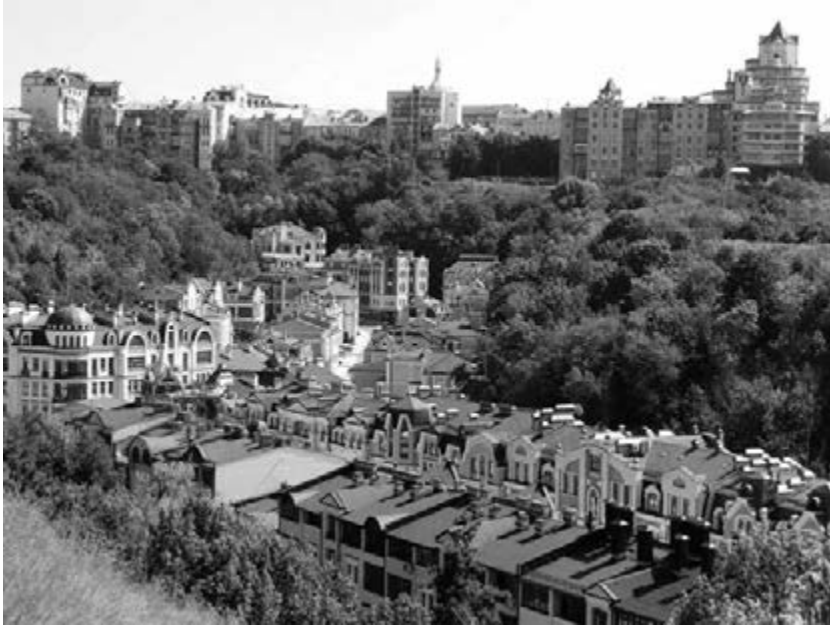
Figure 7.3 A view of Vozdvyzhenka from above

In the 1980s, while the Soviet Union was still extant, plans were cooked up to upgrade the district and to make it into an arts-and-crafts zone where tourists could visit the workshops and studios of woodcarvers, potters, metal workers, jewelry makers, painters, sculptors, and other artisans, and where these various crafts workers would also maintain residences. The idea was that this would be “Old Kyiv” as the city was in the 11 th century, i.e., a theme park of history. Oleksiy Radynski (2010) cleverly referred to this plan as a Kyiv version of Disneyland-type fantasy zones and as the city’s first postmodern urban project. By 1993, now in Ukrainian times, the City Council of Kyiv officially endorsed an amended vision that reduced the mix of arts and crafts in favor of an exhibit hall for archeological treasures, a center for “international communication,” and, quite interestingly, a casino. In Radynski’s words, this was “Kyivan Las Vegas.” However, by the end of 2002 the plans had morphed once more, and the office of architecture and planning in Kyiv put forth an alternative idea – this for a “European Square” (or “Square of Europe” more precisely) featuring hotels and exhibit halls, cafés, restaurants, movie theaters, and various shops. According to the concept that was publicized at the time, this was to be a place where one could “enjoy a Czech beer, watch a Spanish film, and become familiar with the paintings of the Dutch masters” (translated from Radynski, 2010,