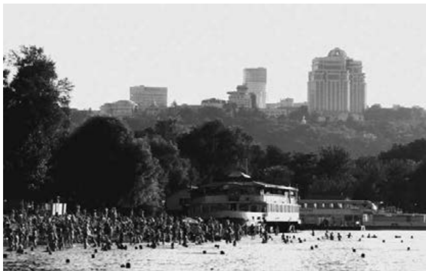
Figure 7.2 Diamond Hill rising from parkland atop the bluffs of right-bank Kyiv

buildings for the postsocialist nouveaux riches across urban Ukraine, as well as in Moscow, etc., and they are sometimes called “oligarch domes.” The one atop Diamond Hill actually looks very much like the dome that crowns Ukraine’s Verkhovna Rada building just down the street. It is easy to imagine that architects wanted to make this particular association, and that it will actually be members of the Verkhovna Rada who will purchase many of the expensive units in the building and park their cars in its garage. I see symbolism, as well, in a photo shoot at the top of Diamond Hill during its construction that I bumped into while browsing the Internet about the project. While you and I cannot go on this site because it is private property and an active construction zone, at least one photographer and his nude model were somehow allowed to the top to take photos with Kyiv as backdrop. The symbolism is this: a porno-shoot is linked to a porno-building, and the porno-building, future home of oligarch nardeps , lacks respect for Kyiv. At least the model took the precaution of wearing a hardhat on the premises.