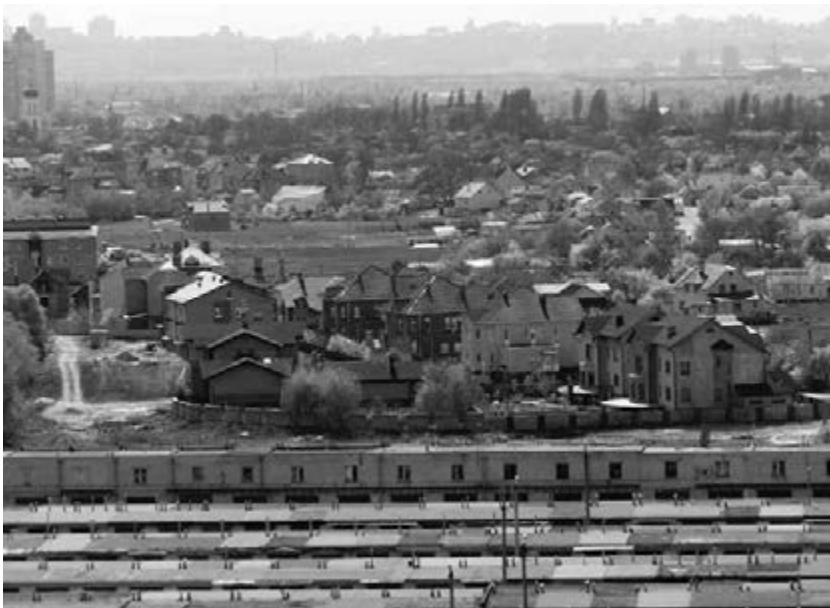
Figure 9.3 Troyeshchyna village and parking garages from the roof of a high building

In order to illustrate the changes in the residential ring, I selected four additional photographs for this section. Figure 9.3 looks west from the roof of a late-Soviet-period apartment building that is located at an edge of the