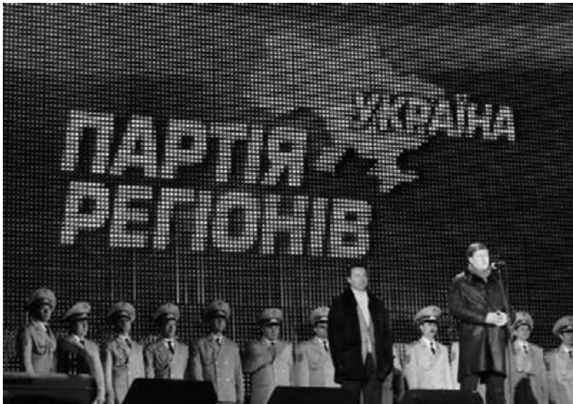
Figure 4.1 A scene from the Soviet-like February 22 (2011) “Defenders of the Homeland” celebration. The words read “Party of Regions Ukraine.”

The concert opened with a military officers men’s chorus (Figure 4.1). They performed patriotic, military anthems in Ukrainian and Russian. There were politicians from the Party of Regions in dark suits and conservative neckties. The one first spoke in Ukrainian, the second in Russian. They offered platitudes about defending the Ukrainian homeland, about the bravery of war veterans, and about the glorious Party of Regions and its love for democracy. There was a good-looking female MC and a handsome male co-MC. She spoke in Ukrainian; he alternated with her in Russian – not one translating the other, just intertwining the languages. Then came more acts. A much be-medaled (20 to 30 medals on one chest) veteran of the Afghanistan War sang songs to heroism in Afghanistan. He was followed by rock singers who performed in Russian, Ukrainian, and English as the