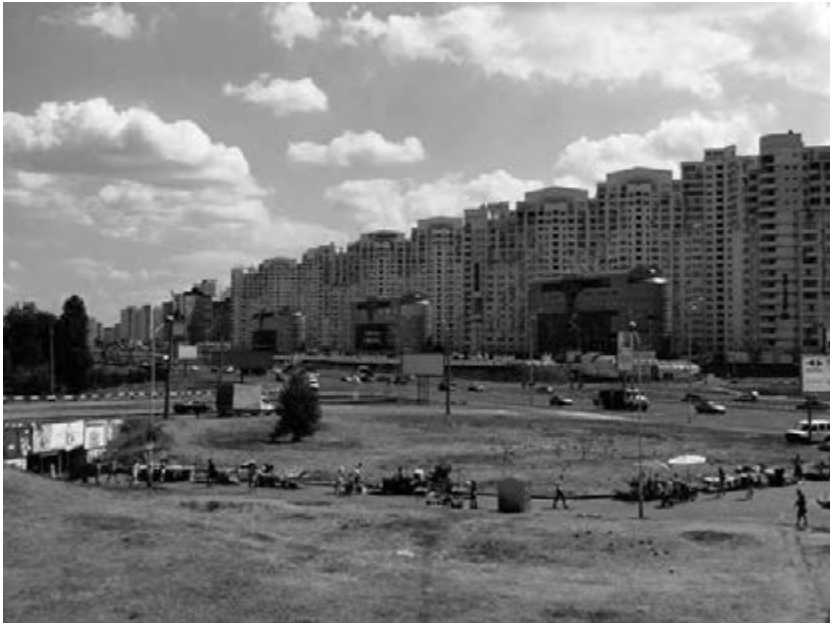
Figure 9.5 New residential high-rises, commercial strips, billboards, and harsh distances for pedestrians in the Osokorky neighborhood on the Left Bank

Figure 9.4 was taken in a residential complex called Heroiv Dnipra (Heroes of the Dnipro) at the end of a subway line on the Right Bank. Most of what we see was built in the Soviet 1980s as new, improved housing for Kyiv's upwardly mobile citizens. The subway stop is beneath the circle and is designed as the hub of the neighborhood. Wide streets extend from the traffic circle around the Metro circle and lead to various planned mikroraiion developments in all directions, each of which houses thousands of residents. Units within the buildings are now privately owned. Some of them are quite large and spectacular in design, although that cannot be seen from the outside, while elsewhere the apartments might be decrepit and old-fashioned, and common areas might be in poor repair. This photograph also shows the landscapes of commerce and automobiles. We see various small businesses both within and outside the central circle, cars parked