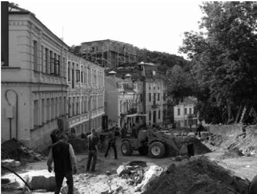
Figure 6.4 Andrew's Descent during reconstruction

Andrew's Church at the summit, which in turn had been given its name because the apostle Andrew is said to have stopped in his travels at the site, erected a cross, and foretold the founding of Kyiv. It was once named Borychevskyi Uzviz, and is referred to by this name in the 12 th -century chronicle Tale of Bygone Years . The street winds downhill from the church, possibly following the meandering channel of a diverted stream, but also possibly through a man-made ravine between two hills that were once one, and ends in historic Podil below. As such, "Uzviz" (The Descent), as the street is known for short, connects the bluff-top site of the old "upper city," where the walled capital of Rus once shone, with another face of Kyiv's history below, the trade-minded "lower city" neighborhood of Podil beside the river. Uzviz is nearly a kilometer long, is paved with coarse cobblestones, and has an average grade of about 15 to 20 percent. Until recently, the surface of the street and the walkways on either side were in notoriously poor condition, but a major reconstruction project that was undertaken before the expected flood of football fans/tourists in the summer of 2012 has made the surface smoother and safer (Figure 6.4). There is also considerable redevelopment of buildings and vacant sites. The upgrading is sorely needed because there