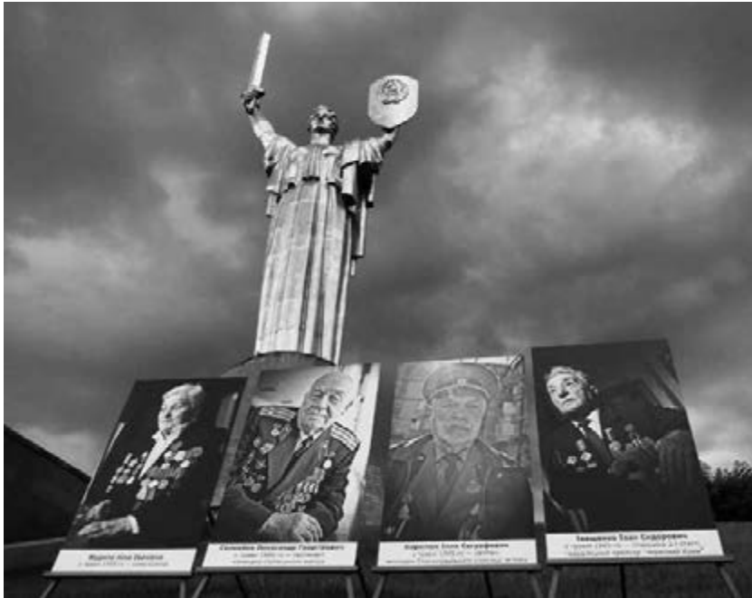
Figure 5.2 Kyiv’s iconic “Mother of the Fatherland” World War II memorial as seen from across the Dnipro River

accompaniment by echoes of heroic martial music, through a solemn, cave-like stone chamber with oversized reliefs of determined soldiers and Soviet citizens in action against the Nazis. As is the tradition, the bronze automatic rifle of one soldier has been rubbed so often by visitors that its barrel glistens. When you emerge from this “underground” passage there are more oversized heroes in action poses, but now they are bathed by sunlight, and above them the awesome steel sight of Batkivshchyna Maty , much higher and brighter than anyone could be prepared for. As we come closer on this particular holiday, we see huge posters with images of still-living heroes of that war, elderly men and women with chests full of medals, and biographical sketches that tell of exploits as sharpshooters or grenade throwers, or workers in munitions or uniform-sewing factories, or in other critical industries. The posters are adorned with enormous bouquets of flowers and great ribbons, attesting to the reverence that citizens today have for those who had fought for the cause.