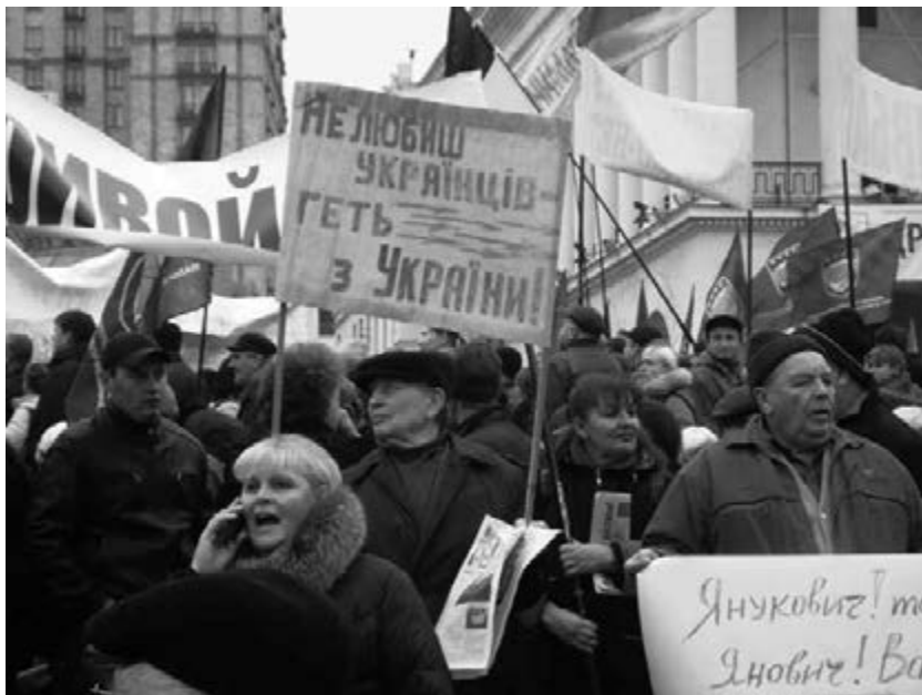
Figure 11.1 Photo of angry citizens in demonstration. The sign reads, "If you don't like Ukrainians, get out of Ukraine."