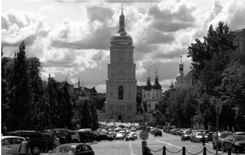
Figure 6.3 The bell tower of St. Sophia Cathedral

you up the bluff, is Mykhailivska Ploshcha (Michael's Square), an open plaza in front of the gate to the St. Michael's Church complex. The two are connected by a short stretch of wide Volodymyrska Street and some green spaces at its sides. St. Sophia dates back to the earliest period of Kyiv history and is a UNESCO world heritage site, while St. Michael's is a new church built in 1999 on the site of historic Monastery of St. Michael of the Golden Domes that had been dynamited in Stalin's notorious war against religion. These spaces are often the site of public gatherings, protests, concerts, and other events, as well as destinations for camera-toting tourists and the various kinds of local entrepreneurs who look to make a living from them. 31