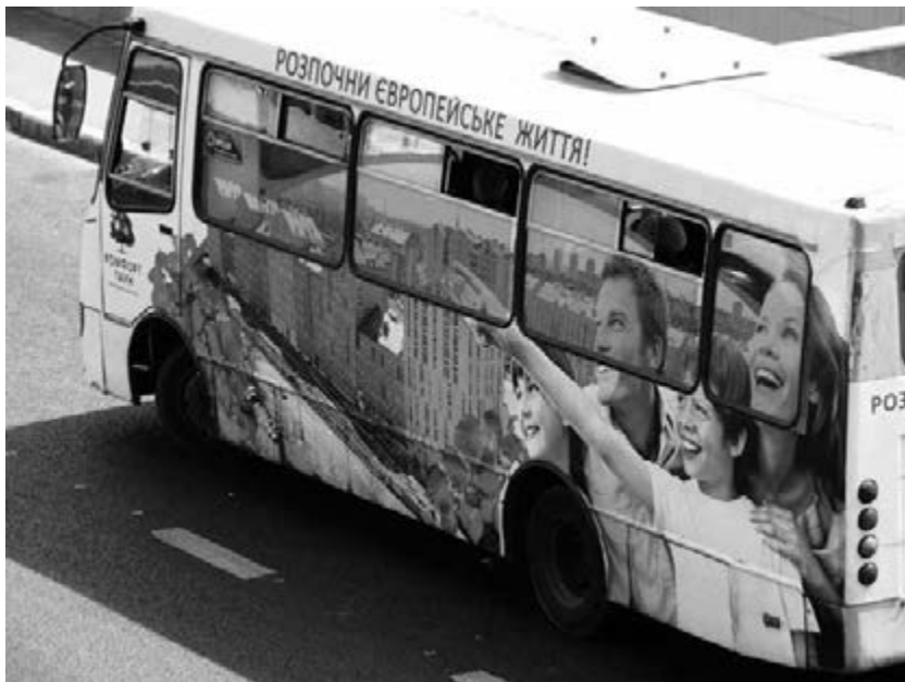
Figure 9.1 A minibus ( marshrutka ) decorated with an advertisement for "Comfort Town," a new housing development in Kyiv's residential ring. The text reads "Start Living like a European!"

In addition to planned clusters of apartment buildings, the residential ring around Kyiv also includes a second type of housing landscape, one of