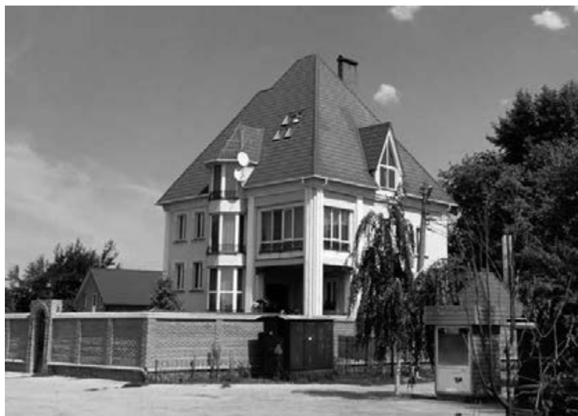
Figure 9.2 A large new private home close to Dnipro River beaches in an area that was reserved for modest dachas during Soviet times

As apartments and single homes are remade by owners, a sizable business sector has emerged to provide materials and services. The strip shopping areas that stretch along thoroughfares in the residential ring have many