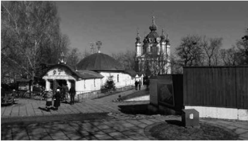
Figure 3.2 The small and controversial Church of the Nativity of the Blessed Virgin. In the background is the historic, baroque St. Andrew's Church, while to the right is a fence that demarcates the site of Desiatynna Church. The signboard announces that a museum is slated to be built. The photograph is from March, 2014.

ornate iron front gate and low iron fence of its own, a lot of loud bells to ring the faithful to services, and an attractive, modern-style Orthodox cross on the roof. Until recently it was made of timber and resembled a log cabin, but now it is larger and is finished with masonry (Figure 3.2). It also has great ambitions: depending on the source, it plans either to rebuild Desiatynna, to build a great new church on the Desiatynna site, or to build a new church beside the Desiatynna site in a way that would preserve and celebrate the sanctity of Desiatynna. Regardless of which path is true, the small structure that stands now is temporary and the plan is to erect a grand new church.