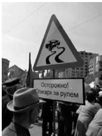
Figure 7.5 This photograph was taken at an anti-corruption in government rally by the Communist Party of Ukraine in the center of Kyiv. The protester's sign reads "Caution! Oligarch at the Wheel." As is characteristic of Ukraine's communists, the language is Russian.

totalled, the brutish Hummer was barely bruised, but David had struck against Goliath.