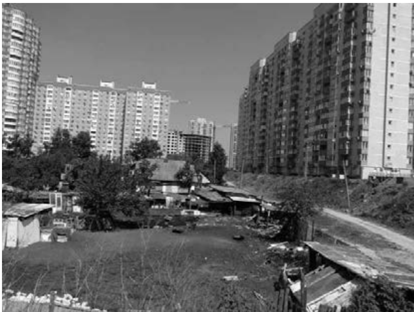
Figure 11.6 The last farmstead in Pozniaky

development. I have visited the site several times, always marveling at the contrast between this unusual small space (about the size of a football field) that the Yurchenko family still farms, and the vast scale of the tall buildings and thousands and thousands of citified new neighbors that surround it. It is the topography that is most striking, because the Yurchenko farmstead is, quite literally, in a hole. It sits five or so meters lower in elevation than the immediate surroundings because urban Pozniaky is built on thick layers of recently imported sand. When you approach the site from across the flat surroundings, the first thing you see is tree tops poking from below. The environment of the new neighborhood on sand is sterile, supporting little greenery except for some scrawny new trees and worthless patches of weeds, while the last farmstead in Pozniaky is on dark and mucky earth, and is thick with greenery and alive with wildflowers, roses, wildlife, and farm animals. There are birds and bees, as well as chickens, a dozen or more pigs, and several goats. In addition to the main residence, which is a typical old village farm house, there is another house as well and a mix of rustic outbuildings, including an outhouse, a greenhouse, a shelter for livestock, a workshop, and a sauna. Mothers from the city neighborhood bring their young children to the edge of the precipice to look down at the