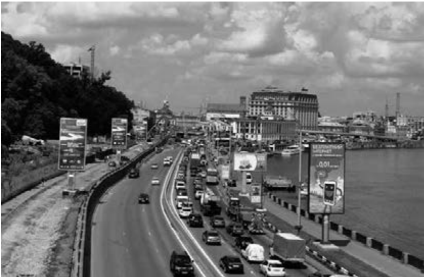
Figure 6.5 Podil at a crossroads, literally. This is a traffic tie-up approaching Post Office Square. There is construction underway in parkland on the bluffs on the left, the large new Fairmont Hotel at right-center, and some of industrial Podil in the background.

already, with many more such projects slated for construction soon, so the neighborhood is poised between a future of thorough gentrification and the possibility that life and business opportunities for ordinary Kyivans can still be maintained. Also at stake at the crossroads is Podil as a neighborhood with an active student presence, artists and their studios and galleries, theaters, and many grassroots civic organizations, cultural institutions, bookshops and publishing houses, and charming cafés. As is the tragedy of many funky urban neighborhoods around the world, Podil's charms attract developers who profit from being next to the charms, but who then with time inadvertently or irresponsibly choke them and cause displacement. Podil is at a crossroads geographically, too, located at a choke point of automobile and bus traffic between the center of Kyiv above and the highly populated residential neighborhoods of the city to the north and to northeast across the river. Those to the north especially include some newly prestigious precincts, so Podil is seen by developers as a place that can serve the new rich at a location between where they live and where they work and play. This, too, adds to the development pressure on the neighborhood. Many residents of Podil, Kyiv history buffs, and much of the NaUKMA university community, among others, oppose many of the