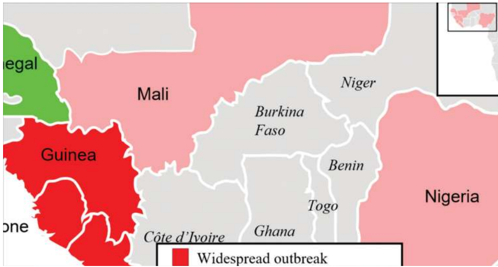
Figure 3. West African Virus Epidemic map [40].