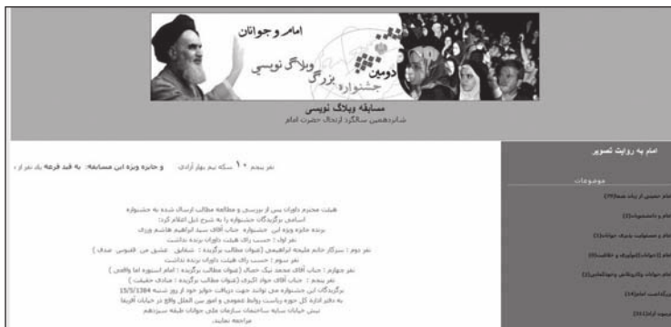
Figure 7. Announcements of the names of winners and the prizes they received on the Web site of the Imam Khomeini and Youth blogging competition.

convenient way for the ruling powers to vicariously reassert the contemporary relevance of the Islamic Republic’s founder through the virtual mouths of its young people.