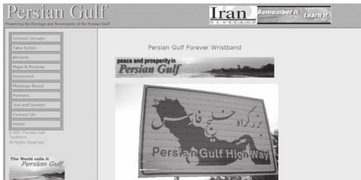
Figure 1. A screen capture taken in 2007 from the main page of the Web site of the Persian Gulf Task Force. The organization has had an online presence since at least 2001. It was formerly available at http://www.persiangufonline.org/ and until fall of 2012 was available at http://persiangulftaskforce.org/ .

becomes a central problem in other cases involving the Iranian Internet that bear more directly on local and global political developments.