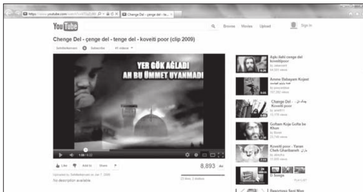
Figure 11. A YouTube video about Palestinian militant groups that uses one of the Persian-language songs affiliated with the Sacred Defense in Iran. The accompanying text is in Turkish and the video was posted by a Turkish user.

A similar dynamic is at work in another item uploaded by a Turkish user who used the same song to accompany images related to Palestine, with a specific focus on Hamas. This clip has a fleeting visual reference to Iran—an image of Ayatollah Khomeini flashes on the screen at the outset—but the remainder focuses on Palestine and all the descriptive texts appear in Turkish. 28 Again, a thematic harmony exists between the song and the images displayed, but this time without irony, since the Iranian state has been open in its support for Hamas. Yet this compatibility and the image of Ayatollah Khomeini flitting across the screen do not constitute meaningful engagement with Iranian state ideologies and thus cannot be read as either clearly disrupting or reinforcing its narratives about the Iran-Iraq war.