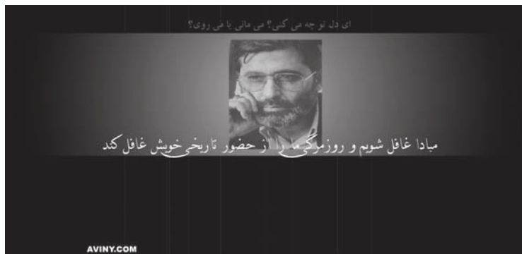
Figure 8. A 2003 screen capture of the introduction page of the Aviny Institute's Web site, one of the most well developed in Iran at the time. The site included audio and flash animation.

martyrdom” have established Web sites to memorialize the war. The Secretariat for the Coordination and Oversight of the Promotion of the Culture of Sacrifice and Martyrdom has been online since 2003. In June of that year, the site put out a call for contributions from readers, promising “valuable prizes” for the best articles. Throughout 2003, the secretariat elicited reader participation, including putting out a call that year and in subsequent years for readers who were willing to serve as official reporters. 7 According to the title of the bylaws that established the secretariat, its mission also includes “upholding the memory of martyrs and celebrating those who sacrificed for the Sacred Defense and providing cultural-artistic facilities for the honored families of martyrs and those who have sacrificed.” 8 Given this mandate, the site primarily functions to highlight news about activities that honor or support war veterans and martyrs. Similar to the Aviny Institute but on a smaller scale, the secretariat’s Web site includes war-related images that can be easily downloaded and recirculated.