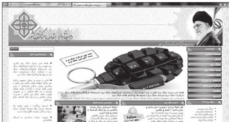
Figure 15. The Web site of Iran’s Secretariat for Confronting Soft War.

Another clear indication that knowledge production about the soft war is understood to be a core component of combating and engaging in soft war can be seen on the Web site Jang-e Narm: