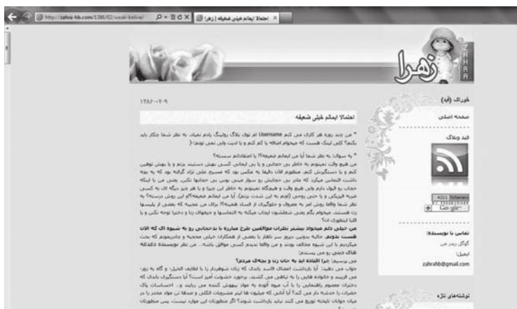
Figure 4. An April 2007 post from the blog Zahra criticizing methods police forces used to enforce dress codes for Iranian women.

Although I believe in hejab , never and under no circumstances could I hurt someone physically or mentally (and to this degree) over something like [the dress code] or anything else. Does that mean that my faith is weak? Or that their way is the right way? Do you really think this is the way to enact amr-e be maroof [the Islamic imperative that Muslims are to guide other Muslims] or to prevent corruption? It is strange to me that some of the police are women. Does their work make them impervious to the cries and the begging of girls and women or is that how they were before? I would really like to hear the views of those who agree with regulating dress codes in accordance to this current method. It might be interesting for you to know that at