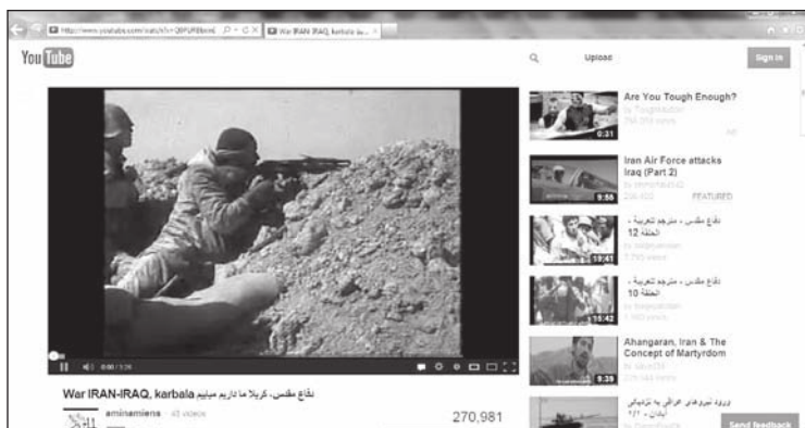
Figure 10. One of the most frequently viewed clips retrieved on YouTube using the Persian search terms for “Sacred Defense.” The audiovisual content was produced with Iranian state support during the Iran-Iraq war and has not been altered by the uploader.