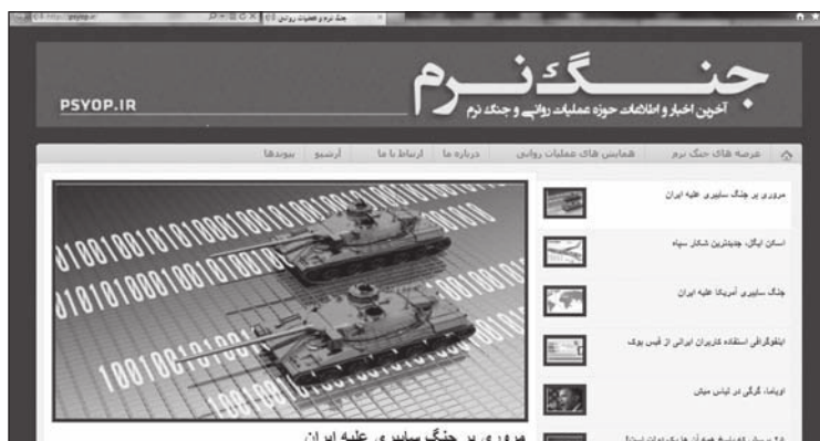
Figure 16. The Soft War Web site, whose URL is the perhaps telling psyop.ir.

Jang-e Narm emphasizes that new strategies are being used against Iran that require new responses. A November 2011 piece on the site covering Ayatollah Khamenei’s warnings about a “cultural invasion” begins with the following epigraph from Khamenei’s speech: “My