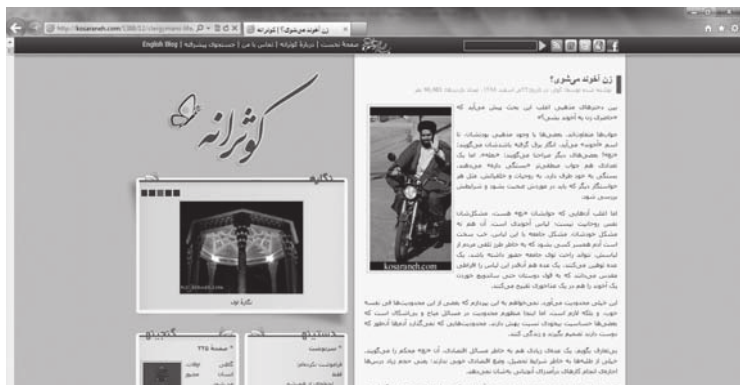
Figure 6. A screen capture of “Would You Marry a Cleric?,” one of the most frequently read posts on the blog of female seminary student Kowsar. The March 13, 2010, post considers the responses of religious women to the question.