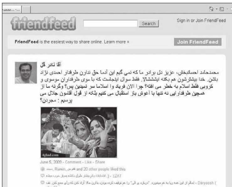
Figure 14. This public Friendfeed post in support of reformist candidates uses a photo circulated by the Ahmadinejad campaign to question the hypocrisy of some of its tactics.

commenting on them in real time and interacting with others who were doing the same. In essence, users transformed Friendfeed into a transnational viewing community where participants from around the world could act as both audience members and debate analysts.