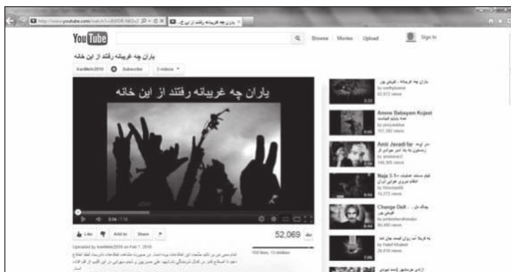
Figure 12. This video's soundtrack uses a Sacred Defense song that is most often affiliated with commemorations of fallen soldiers during the Iran-Iraq War. The YouTube user has repurposed it to commemorate the lives lost in the aftermath of the disputed 2009 election.

reappeared in relation to the post-2009 opposition is Koveitipoor's "Gharibane," a song lamenting the loss of comrades. It was originally composed in remembrance of the Iran-Iraq war dead, and it has had an online life in this capacity; popular video clips mix the song with various scenes from the war. 30 Yet the song has also resurfaced in relation to those who were killed in the aftermath of the 2009 election, and several videos used the song as a tribute to the fallen. 31