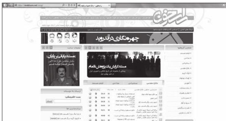
Figure 9. The Web site Rasekhoon offers audio and audiovisual content on the topic of “Sacred Defense” for streaming and download. The site also contains prominent ads that link to political documentaries about Iran’s former king and the Mujahedin-e Khalq organization.

In addition, hundreds of blogs are solely devoted to the war. Many of these began in 2004. It is likely no accident that this is the year that the number of published memoirs and fictional accounts related to the eight-year conflict spiked. While these blogs are ostensibly independent, they must be read both in relation to the explosion of offline content and state-supported production of material online. 13 Discussions of the war and its legacy are also evident on blogs that are not expressly devoted to the issue. These have been largely produced by those who self-identify as religious and who often express allegiance to the ruling system. However, this positionality does not always translate into an affinity with government-favored narratives; these bloggers have offered some of the most biting critiques of the conflict’s legacy, especially the current situation of veterans (Akhavan 2011). Whatever their particular take on the conflict, the countless blogs that are devoted to the war open new forums for virtual content production and circulation, including audiovisual content. 14