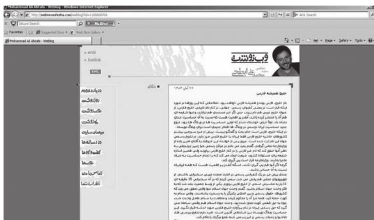
Figure 3. The November 16, 2004, blog post of Mohammad Ali Abtahi, who at the time was vice-president of Iran, in support of Persian Gulf campaigns. Abtahi, a reformist, was a pioneer in embracing digital media and was the first official to start a personal blog.

Abtahi, who was vice-president of Iran at the time, used his personal blog as a vehicle for supporting state and individual efforts to challenge the National Geographic Society. He also proudly credited blogging Iranians as being in the vanguard of activism on the issue. 32