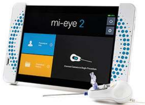
Figure 1. Device. The mi-eye 2 device from trice medical, which includes the tablet and disposable probe. The needle sheath is retracted by pushing back on button found on superior portion of device.

The patient should be placed in a comfortable position during the procedure; the knee should be in 90° of flexion, which can be done in a seated position or supine position with a bump under the patient's heel ( Figure 2 ). Landmarks are then palpated and marked, including the medial, lateral, and inferior borders of the patella as well as the patellar tendon. The standard medial and lateral portals are marked 0.5 cm inferior to the inferior pole of the patella, just medial or lateral to the patellar tendon; a trans-patellar tendon portal, located 1 cm inferior to the inferior pole of