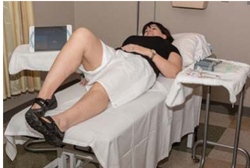
Figure 2. Patient set-up. The patient is set up with the knee at 90° in a comfortable position. This picture demonstrates the patient in a supine position. Alternatively, the patient can be positioned sitting with the knee bent to 90°.

the patella, can be marked and used as well ( Figure 3 ). If further evaluation of the patellofemoral joint is necessary, standard supero-lateral or supero-medial portals can be used. Once the intended portal sites are marked, the skin is prepped in a sterile fashion and 2 cc of 0.2% lidocaine