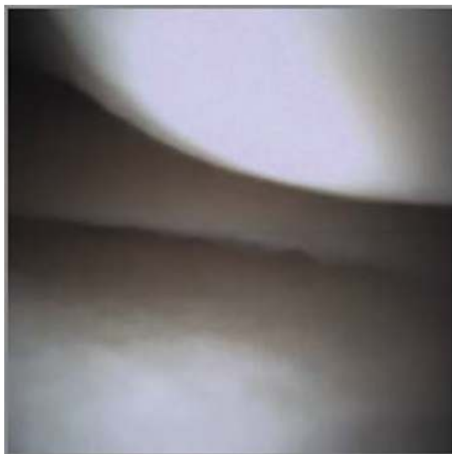
Figure 4. Medial knee compartment. Visualization of the medial meniscus and medial chondral surfaces using the in-office arthroscopy system.

without epinephrine is used to anesthetize the skin directly over each portal sites. An additional 20 cc of 0.2% lidocaine without epinephrine is injected intra-articularly. Allow approximately 10 minutes for the analgesia to take full effect. The skin is then sterilely prepped a second time, prior to insertion of the mi-eye 2™ probe into the knee joint.