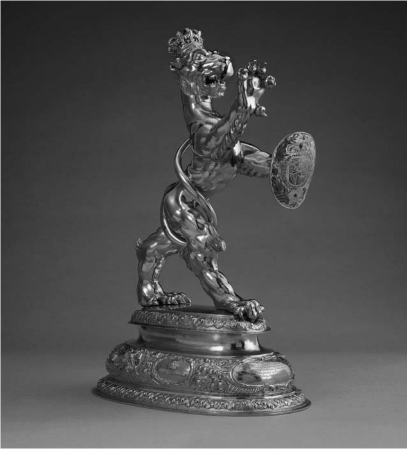
Figure 2: Lion drinking cup, Emanuel Jenner, 1690. Historisches Museum Bern.

bribery to attain political goals. Despite all good intentions, no treaty was concluded in the late seventeenth century, however. Towards the end of the War of the Spanish Succession, there were new talks about a defensive treaty with the Netherlands, which finally materialised in the Alliance of June 1712. Saphorin played an important role in these negotiations. Berne eventually delivered 3,200 to 4,800 mercenaries during peacetime, and a further 4,000 in the event of war, whereas the Dutch would pay contributions to the equivalent of twenty-four mercenary companies should the canton be attacked. It was the first time that a Swiss canton accepted a formal alliance treaty without pension payment. 17