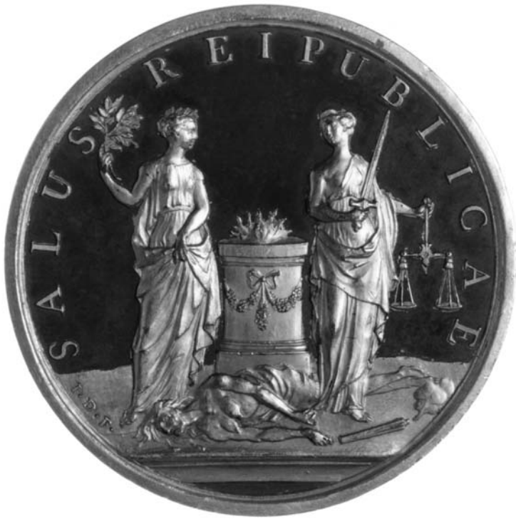
Fig. 9: Jean Dassier, Medal of the Genevan Mediation , 1738, reverse, gilt bronze, 54.7 mm, Cabinet de numismatique, Musée d'art et d'histoire, Geneva.