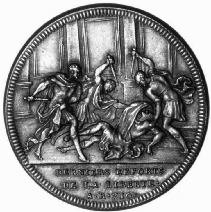
Fig. 1: Jean Dassier and sons: Brutus / Death of Caesar ('Last efforts at Liberty'), reverse, silver, 31.6 mm, from the series Histoire de la République romaine, ca. 1748. Cabinet de numismatique, Musée d'art et d'histoire, Geneva.

lectors, who assume that the set was issued without a dedication. Its absence would be difficult to explain, however, as each of the workshop's large series – the Métamorphoses d'Ovide (1717), 6 the Hommes illustres du siècle de Louis XIV (1723), 7 the Réformateurs de l'Eglise (1725), 8 and the Rois d'Angleterre (1731) 9 – was dedicated to a prominent person. We may suppose that a set of the Histoire de la République romaine was given privately to William IV and his English consort, Princess Anne of Hanover (1712-1759), daughter of George II and Queen Caroline, and that subsequently the dedication was withdrawn when the series was announced publicly in France. We can comprehend the motivation behind such an act, unprecedented in the history of the Dassier workshop. The prince of Orange was a logical recipient for a work glorifying the ancient