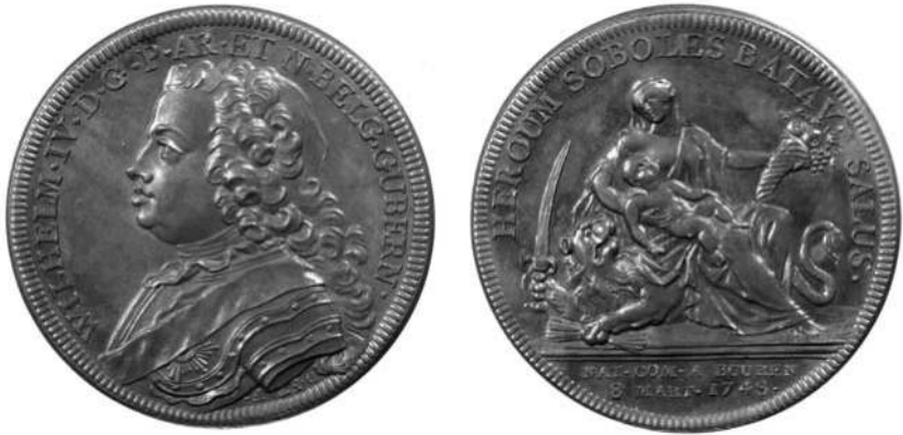
Fig. 11: Jean Dassier and sons, Birth of William V, Prince of Orange , 1748, bronze, 31.8 mm.