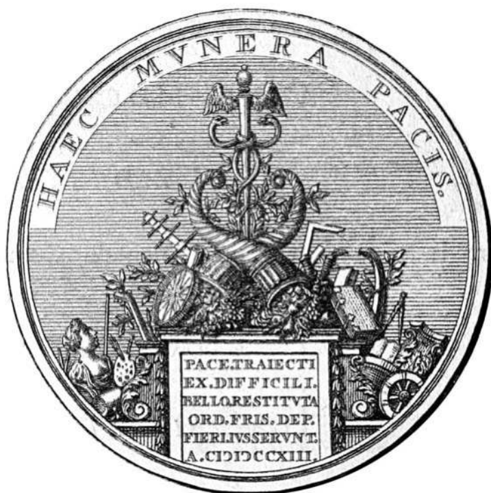
Fig. 8: After Jean Drappentier, Commemorative medal of the Peace of Utrecht (1713) , reverse, engraving from Van Loon, v, 1737, p.227, n. 1.

The obverse is a rather free rendition of the standard portrait by the French painter Hyacinthe Rigaud; the rigid formality of the picture is broken by the vivacious expression and dishevelled hair of the medallic bust. Once again, Dassier's model for the reverse was Dutch. Both text and image were based upon a work executed for Friesland by Jan Drappentier commemorating the Peace of Utrecht (1713) marking the victory of the Netherlands and its allies over the ageing Louis XIV (fig. 8). 28 The Dutch medallist designed a trophy composed of the instruments of all manner of art (painting, sculpture, architecture, navigation, etc.) with a caduceus as the central motif. Dassier merely inserted Hercules's club within Mercury's attribute and modified the original legend HAEC MVNERA PACIS. (Such are the fruits of peace) into a text paying tribute to Fleury's sagacious policies which reversed the failures of the Sun King's declining years.