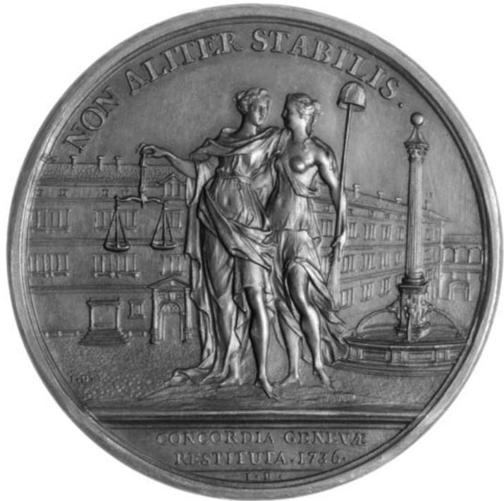
Fig. 5: Jean Dassier, Concord Restored in Geneva (Justice and Liberty) , 1736, reverse, silver, 55 mm, Cabinet de numismatique, Musée d'art et d'histoire, Geneva.

led to a bourgeois rally which was promptly disrupted by the government. A truce was arranged on 18 February, after which the regime granted legal representation to the accused, a minor concession in view of the fact that such rights were an integral part of the edict of 1734. Dassier's medal (fig. 5) 22 therefore celebrates an event which could hardly be viewed as a victory for his own faction. The legend engraved in the exergue on the reverse, CONCORDIA GENEVÆ RESTITUTA , distorts its meaning and exaggerates its importance. The work's production can best be viewed as the expression of a desire for peace and reconciliation