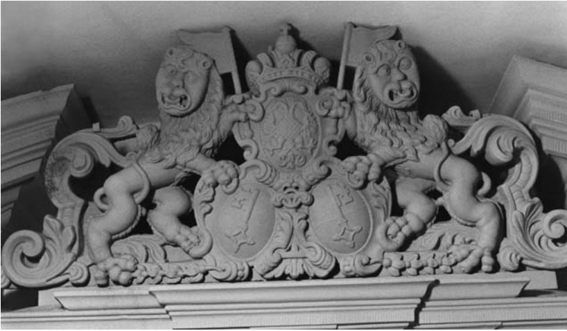
Figure 1: Supraporta of the town hall of Obwalden in Sarnen around 1730. Staatsarchiv Obwalden, Sarnen, Switzerland.

pointed by the Emperor, but had already been an elected community representative for centuries. Still, the reference to the medieval office of the Reichsvogt shows why the original cantons maintained their imperial symbols for so long. The reeve represented the Emperor as the source of all legitimate authority and his most noble duty consisted of presiding over capital punishment trials. This is why even the patrician governments in Berne and Luzern continued to pronounce the death sentence using the phrase ‘according to imperial law’ ( nach Inhalt keÿserl. Rechtens ) until 1730. 22 This formula did not refer to positive law of the Empire, such as Charles v’s Constitutio Criminalis Carolina , but to the Emperor as source of jurisdictional power. However, these references could mean more than just a framework of legitimacy, especially in the Catholic rural cantons. Unlike the hostile Protestant cantons, most of these petty states were so small and weak that their independence depended on the moral and political powers of the Emperor and the Pope. The conservative, static, ‘medieval’ notion of political order therefore seemed to suit them best.