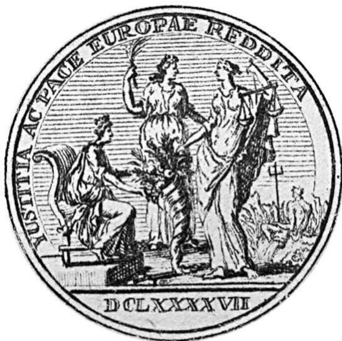
Fig. 6: Unknown artist, Commemorative medal of the Treaty of Rijswijk (1697) , reverse, engraving from Van Loon, IV, 1736, p. 266, n. 24.

Dassier's Liberty appears to have been inspired by yet another Dutch medal, celebrating the partial demilitarisation of the Netherlands following the Peace of Aachen in 1668, in which the United Provinces are represented by a standing female figure holding a pole surmounted by a Liberty cap. 24 In contrast to its cold reception of the Le Fort medal, the government's reaction to Dassier's latest venture was positive. The Conseil thanked the artist and offered two louis d'or to his assistants. The favourable response suggested that the government may have considered appropriating the medal for its own political purposes.