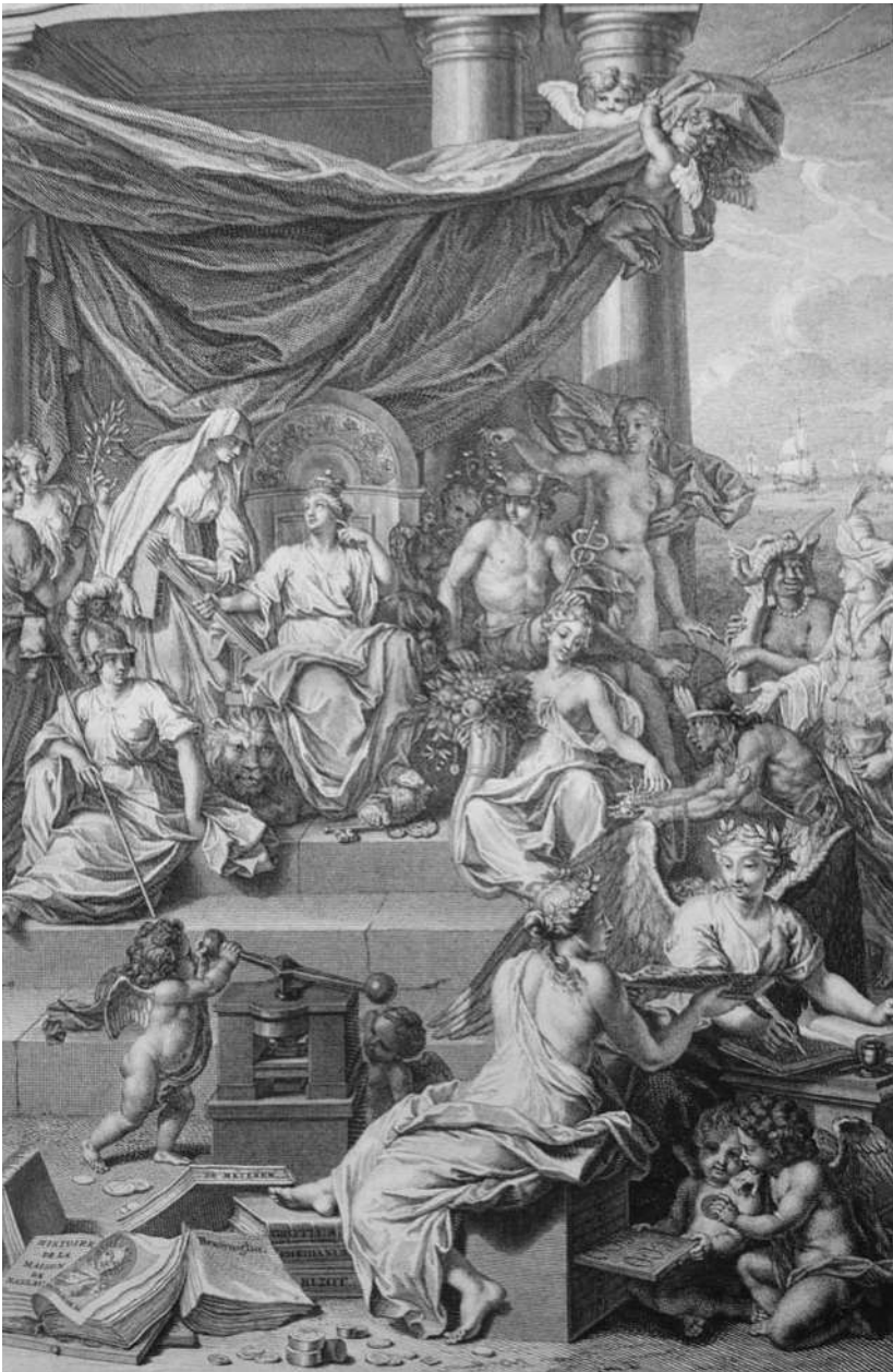
Figure 3: Frontispiece of Jean le Clerc, Histoire des Provinces unies des Pays-Bas (Amsterdam 1723). Zentralbibliothek Zürich