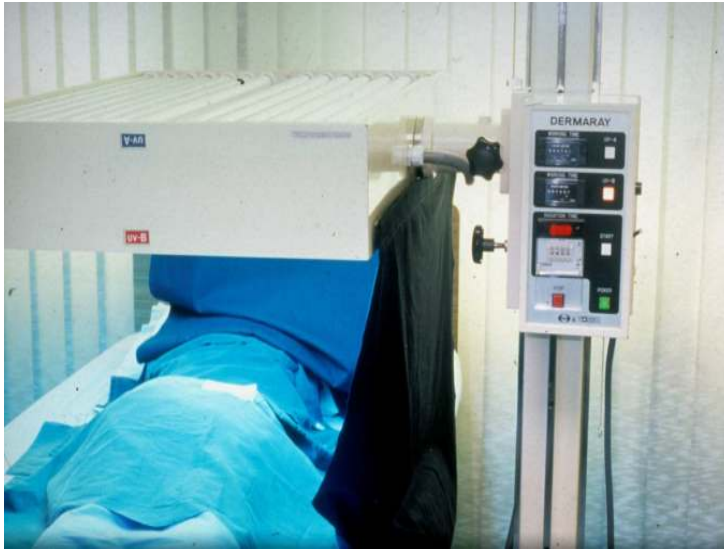
Fig. 2. A targeted UVA light source for PUVA therapy

solution or have the solution directly applied to affected areas. Psoralens may not be used in pregnancy and there is a higher risk of burns, cutaneous malignancy and eye injury.