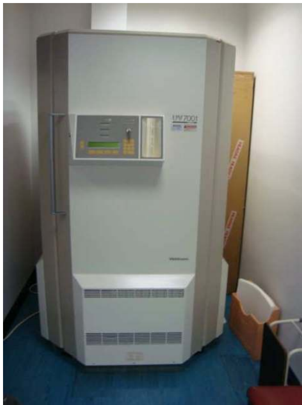
Fig. 1. A Narrowband UVB body box

Ultraviolet B (UVB) phototherapy is one of the most common vitiligo treatments used in the world today, and has evolved from the use of broadband ultraviolet B (BB-UVB) lamps to narrow-band ultraviolet B (NB-UVB) machines (Figure 1) with an emission spectrum of 310-315 nm (e.g. Philips TL-01). Vitiligo was the second most frequently treated disease by NB-UVB reported in a review published from a major U.S. phototherapy referral centre.