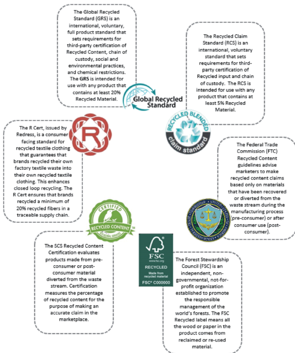
Figure 2. Labels for recycled products.

Many voluntary and nonprofit organizations run campaigns to conserve natural resources by creating awareness of both downcycling and upcycling recycling