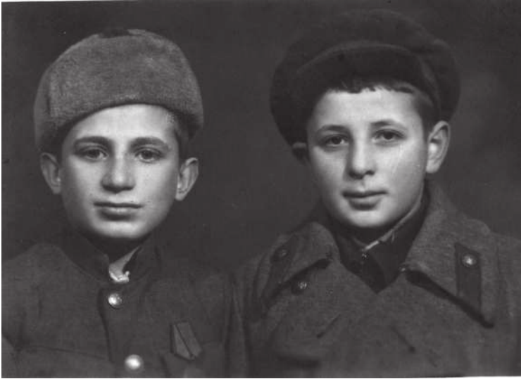
18. Children-partisans in the Jewish children's home in Helenówek.