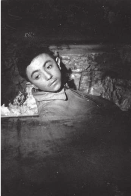
12. Author as child actor in the Yiddish film Undzere Kinder ( Our Children ) — Lodz, 1948.