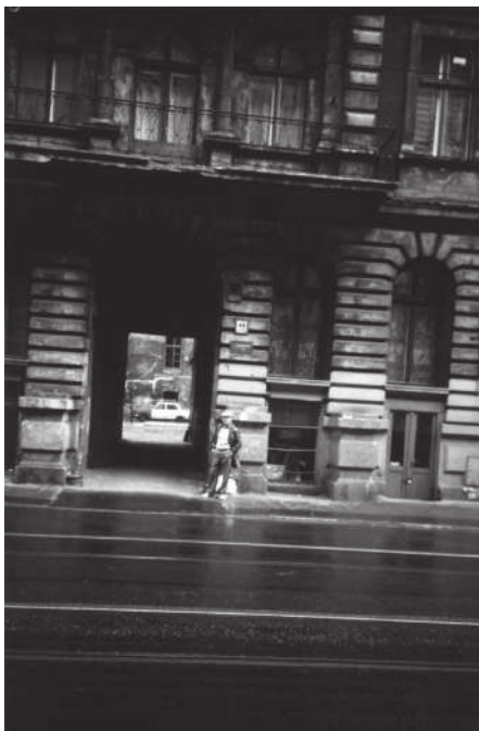
1. Author at the entrance to 49 Kilinskiego Street, Lodz, April, 1987.