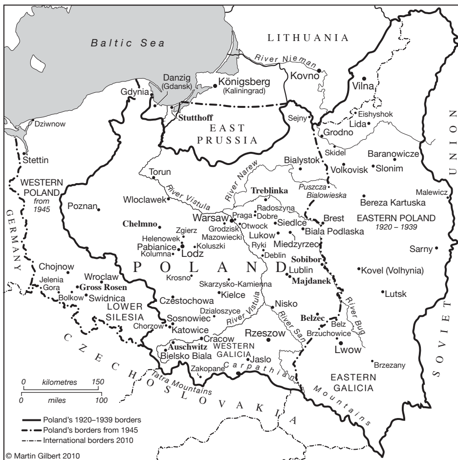
Wartime and postwar Poland, showing the locations mentioned in this book.