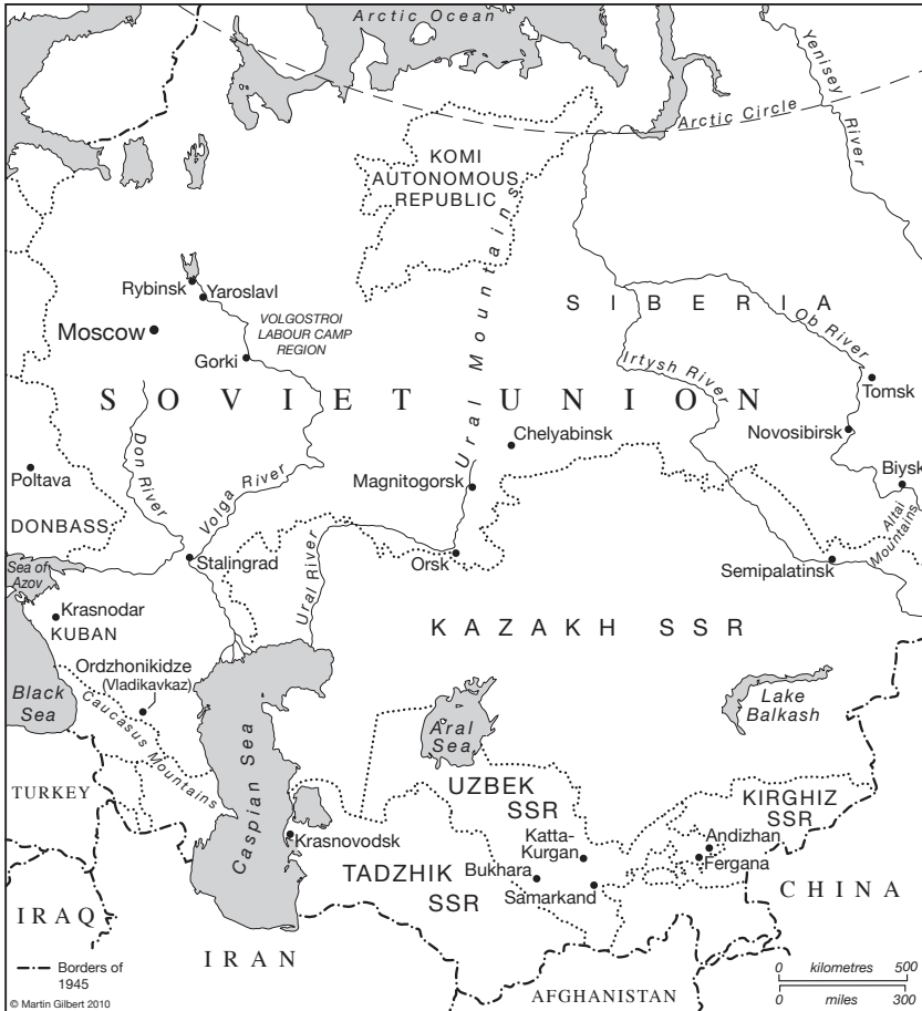
The Soviet Union, showing the locations mentioned in this book.