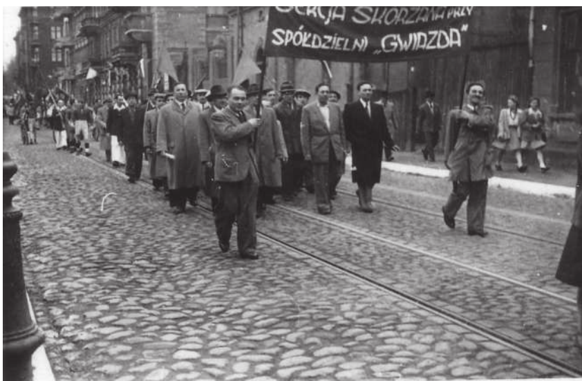
16. Members of a Jewish leather products cooperative in a 1st of May demonstration in postwar Lodz.