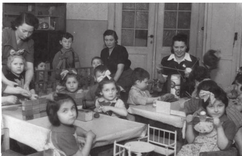
24. At the Koordynacja children's home on 88 Piotrkowska Street in Lodz.