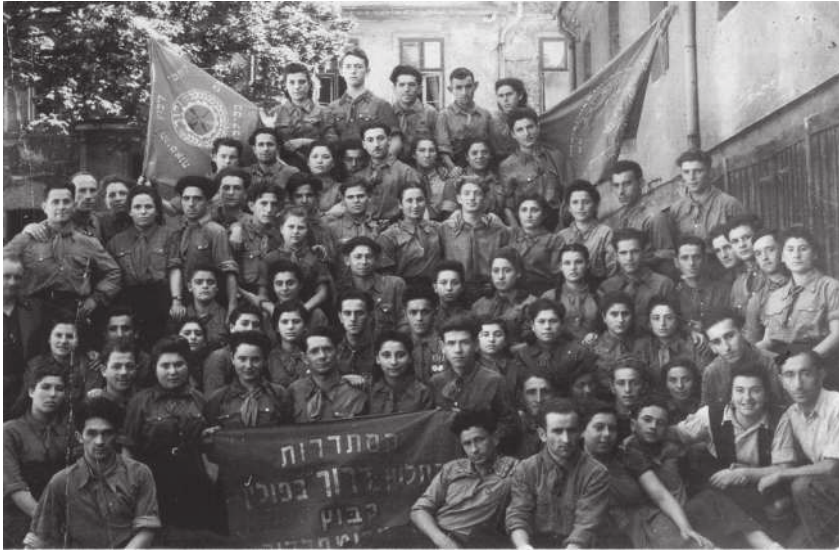
25. A Dror kibbutz in postwar Lodz.