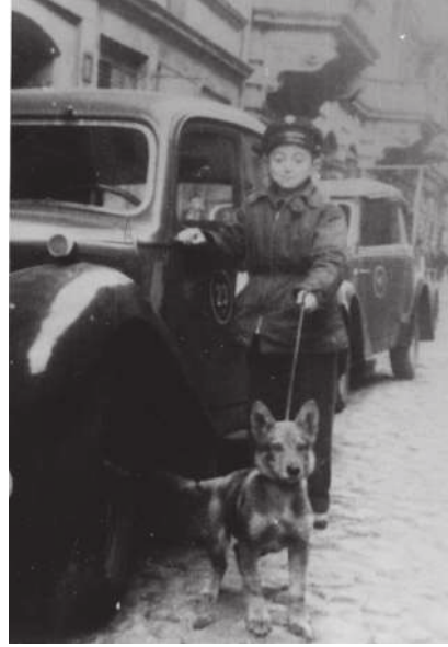
5. Author at 33 Gdanska Street. Lodz, winter 1948.