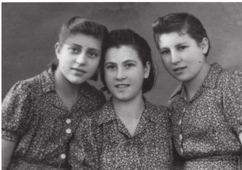
17. Young girls in the Jewish children's home in Helenówek, 1945.