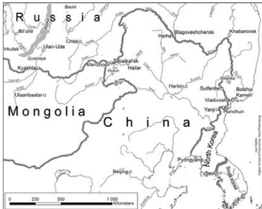
Figure 1 Map of north-eastern Russia-China borderland