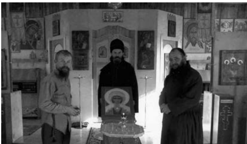
Figure 11 A s'ezd ('congress') of Far Eastern Old Believers in the mid-1990s held in Bolshoi Kamen'