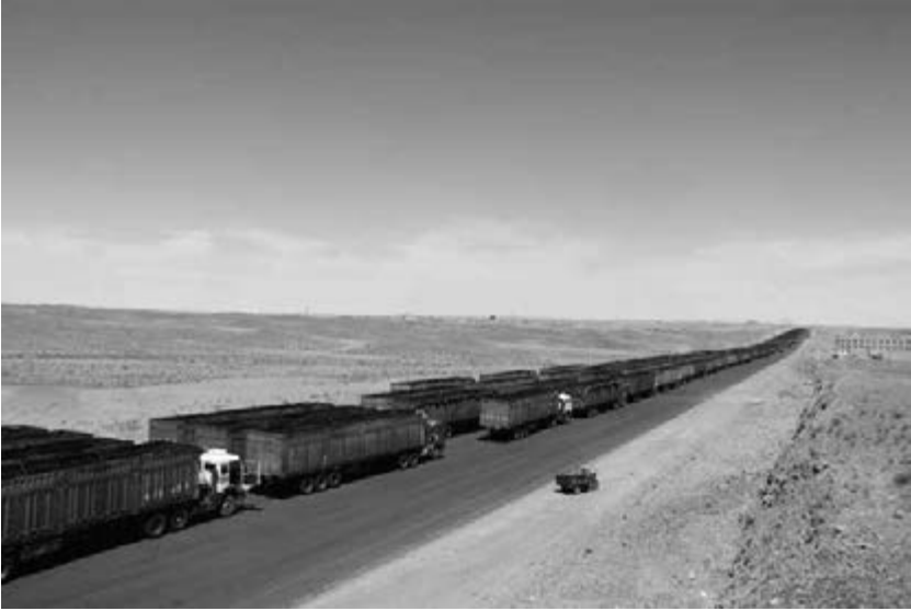
Figure 7 Trucks lining up to cross the border to transport coal from Mongolia to China, 2013