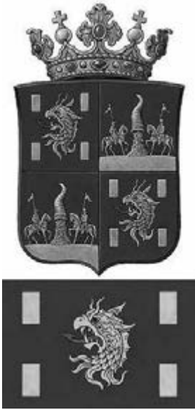
Figure 2 The Coat of Arms and official flag of Kyakhta, Russia

this is not just a head of a dragon: as an 1861 document states, it was meant to depict ‘a severed head ( otortvannaya golova ) with red eyes and red tongue’; 9 when the dragon as a whole signified China itself. The same symbol of the guillotined dragon became the official flag of Kyakhta town, which is still in use. 10 It should be noted that a beheaded and vanquished dragon is one of the most popular motifs of Russian orthodox iconography, depicting Saint George’s victory over pagans. Indeed, the newly established border was perceived by Russians as the front line of the confrontation between European Christianity and Asian pagans. Perhaps this is one reason why Kyakhta was so rich in large Orthodox churches; it has the most outstanding and impressive ecclesiastical architecture in all of Asiatic Russia east of the Urals. The largest and most monumental, the Church of the Resurrection ( Voskreseniya ), 11 was built just a few meters from the border next to the