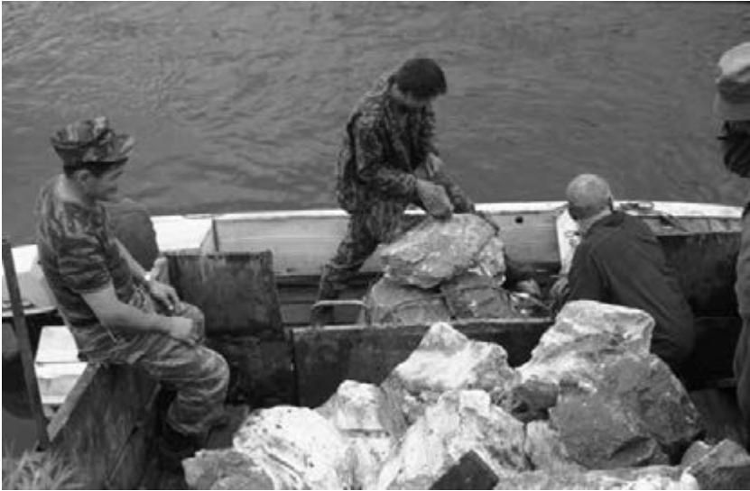
Figure 16 One of the Sunshine's operations. Guards reload raw jade to transport it across a river. Jade is on its way from mine to warehouse

through the reindeer farm, which was simultaneously used as a storage place, watch post, and canteen. All of these changes were also very much in favour of the reindeer herders, who had often suffered from the lack of supplies before.