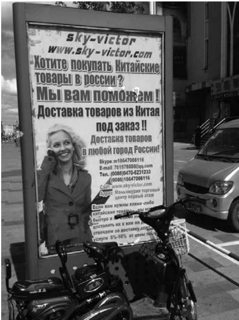
Figure 17 Advertisement for a company offering help with on-line purchases in Manzhouli, China

to the brothers' invention (i.e. they are mediators between Russian purchasers and the Chinese bazaar), but some are more similar to the technical architecture of Taobao itself. For example, the company 'Russian Bridge' simultaneously offers online shopping on Taobao and other means and