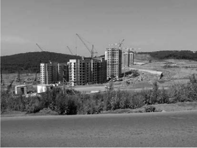
Figure 13 The 'Eastern Breeze' complex, Vladivostok, 2013