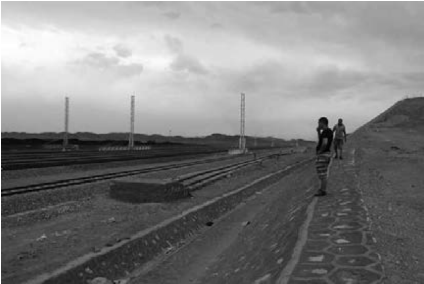
Figure 8 Buyan standing reflectively by an unused railway, 2013

China and Mongolia have been trying to find a common ground by linking their 'Belt and Road' and 'Steppe Road' projects at the governmental level, as laid out by the presidents (Mongolian: tolgoi , 'heads') of the two states in recent years. This is a basic framework for cooperation that needs to be activated through more practical connectivity between them, including infrastructural hardware like railways (see Figure 8), roads, or tunnels, as well as cultural and social interaction between the two peoples. In other words, the cooperation between the two countries not only relies on good