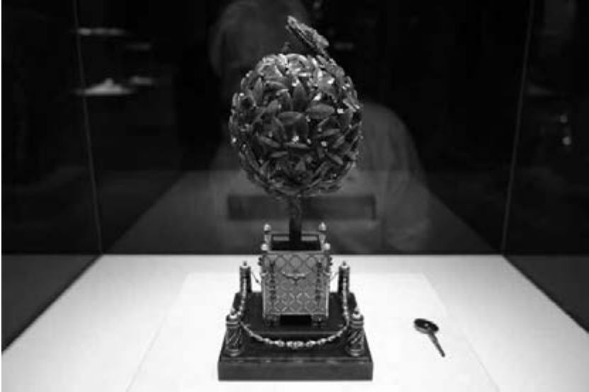
Figure 15 Carl Fabergé’s Easter egg, made predominantly of jade from a private collection of Viktor Vekselberg, the fourth richest person in Russia. The object is on display at special private museum in Saint-Petersburg, Russia

was part of an elitist lifestyle and jade was never reconfigured as a Russian stone in a democratic sense: it did not become popular or recognizable, and no artisan craft arose to work the stone into objects of value. This situation was in some ways similar to the heyday of jade in Chinese history, when only the members of royal family and those close to it were permitted to own jade. Even though jade objects like imperial eggs are of Russian origin, their price now is determined at auctions abroad, and foreign experts play important roles in the process. In this respect Russian buyers are similar to Chinese ones: they buy these objects because of the emotional ties they feel towards them.