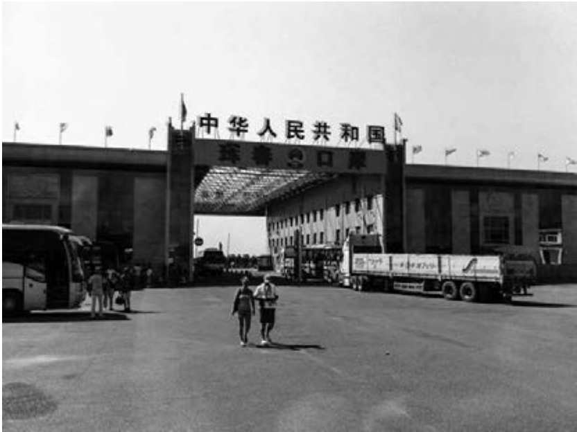
Figure 5 The border crossing at Hunchun-Kraskino