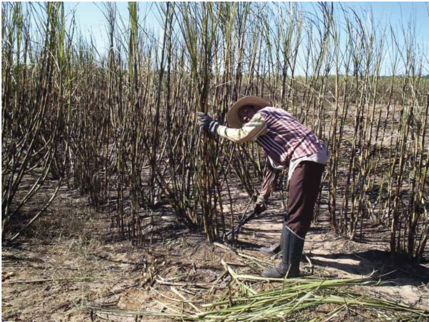
Figure 3. Hand sugarcane harvesting.