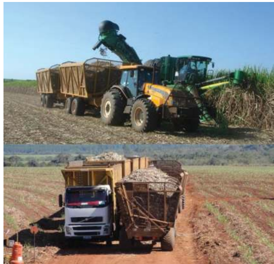
Figure 5. Transshipment to aid the transport of sugarcane from the plot to the truck or train.

Sugarcane has a great economic importance in Australia. According to Higgins and Davies [31], in this country, the sugarcane is mostly concentrated in the northeast, and the cut begins in the winter and goes until the end of spring, when the highest percentage of sucrose is concentrated.