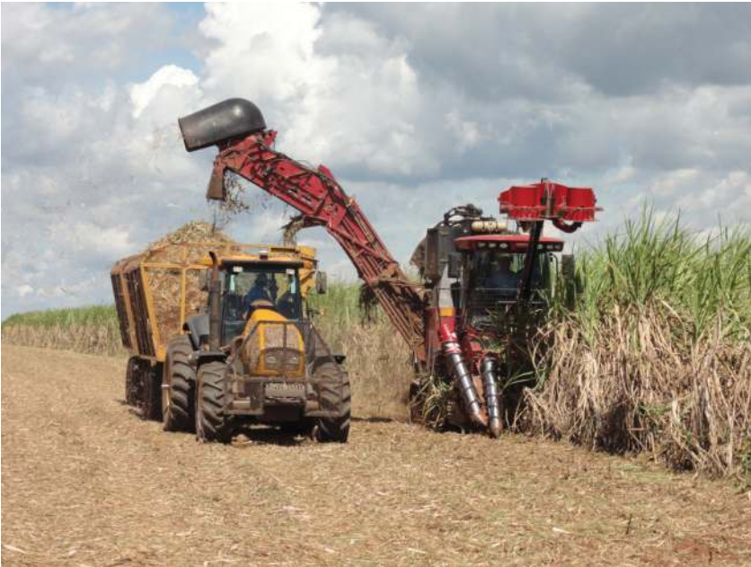
Figure 4. Sugarcane mechanized harvesting.