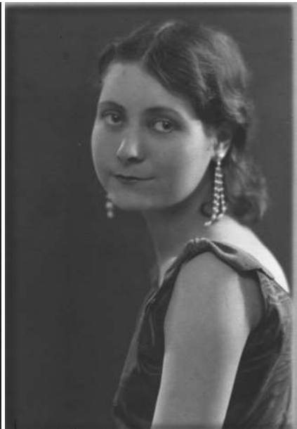
In Atlantic City, 1932