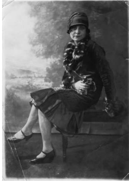
At a photographer's studio, 1932