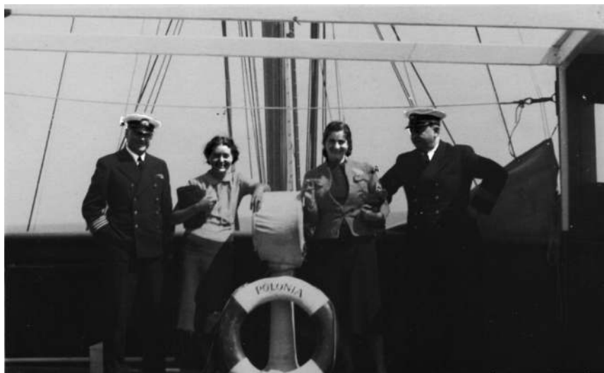
On the ship Polonia on the way to Poland, 1937