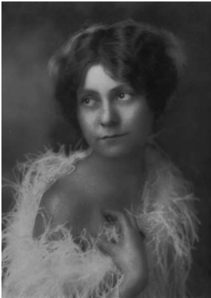
In Atlantic City, 1931