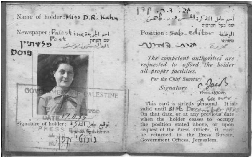
Journalist's ID card from The Palestine Post , 1933