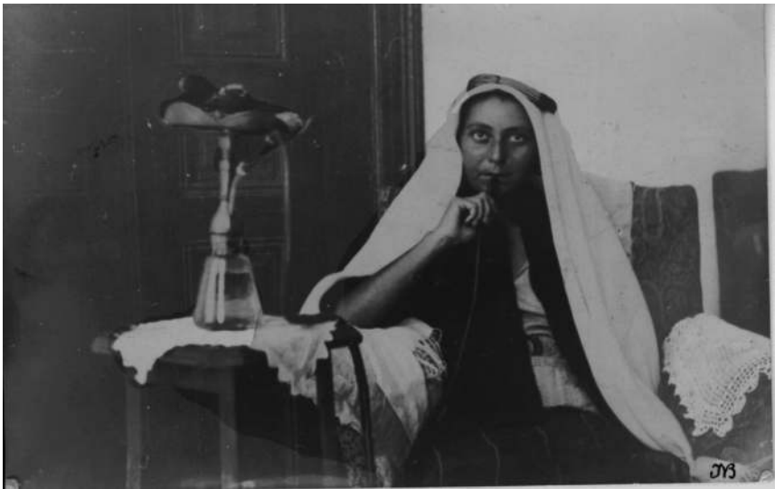
At the wedding of Trans Jordanian Prince Talal, 1934