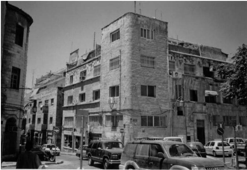
Building of The Palestine Post