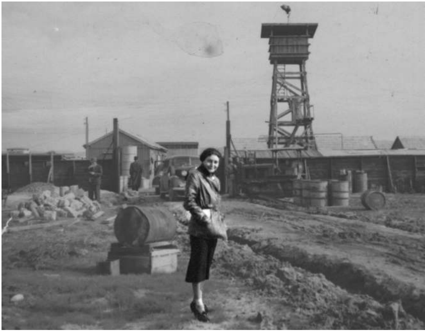
Visiting a new settlement, 1938