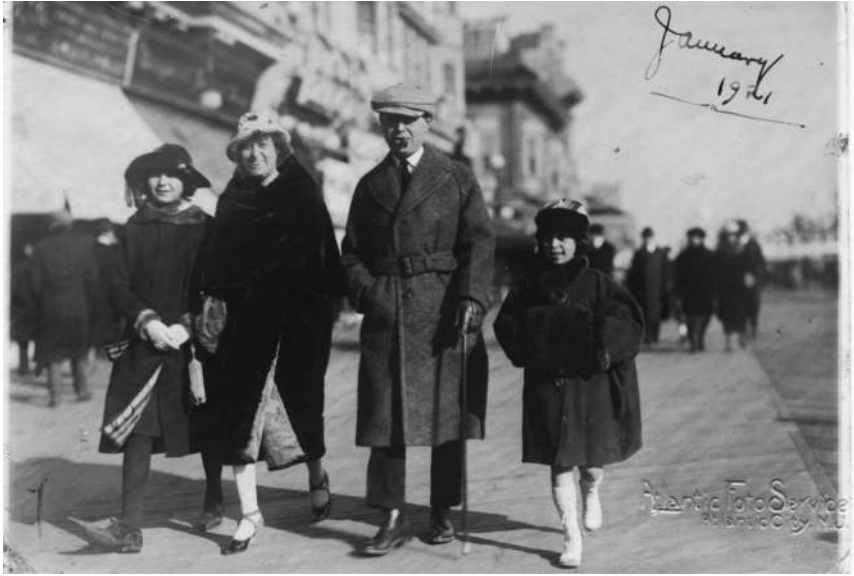
On Atlantic City boardwalk with parents and sister, 1921