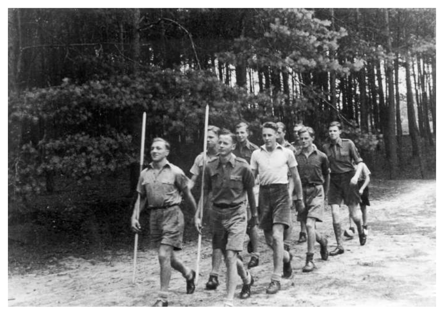
10. Illegal scout troupe in Arnhem.

To a certain extent, the commemorative exercise underscores our distance even as it is used in an attempt to help us remember. It is at once an appeal to common memory and an implicit statement of difference about those who experience the event as