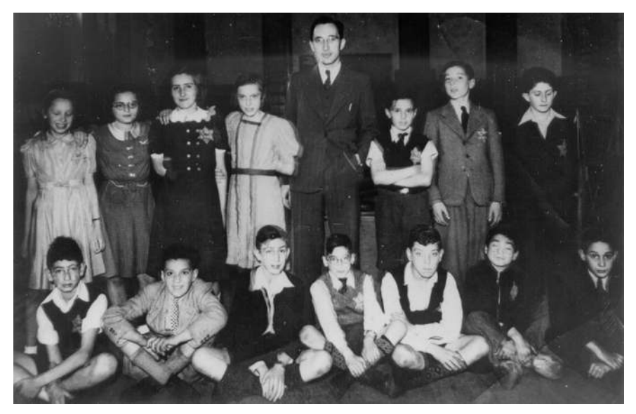
6. Grade six of the Jewish school at Bezemstraat 3 in The Hague.

The element of loss found in these narratives reflects a very real feature of the memory of the occupation for a certain segment of the population of the Netherlands. There are those who claim that the post-war prosperity which the Netherlands enjoys coincides with a loss of social cohesiveness, and lament the loss of solidarity represented by recent developments. References to a culture of solidarity recur again and again in stories people tell of life under the occupation: we had no material goods, but at least we were close to our neighbors, and we shared a common hope for a better future. Thus an oral history of the reconstruction of the country in the immediate postwar era is entitled "How beautiful peace looked while we were still at war."<sup>13</sup> An article about Piet Calis' dissertation, a study of illegal literary journals during the occupation,<sup>14</sup> entitled "We were happy only in the midst of the fire. Writers and journals during a wonderful time behind bars",<sup>15</sup> formulates a sentiment still occasional-