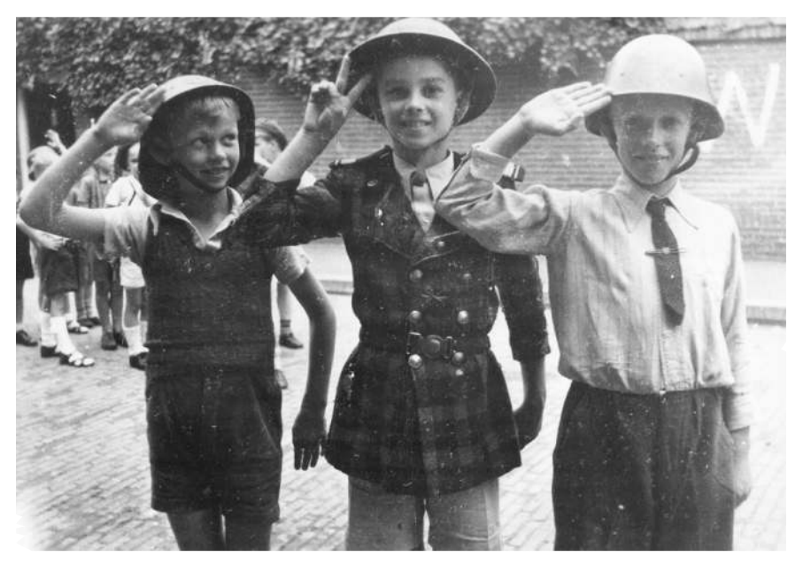
13. Dutch children during the liberation.

Thinking of the possible function of practices of inclusion/exclusion as a component of community-building sheds light on the possible motivations for not only spontaneously persecuting (former) collaborators<sup>28</sup> right after the war (an act which many outsiders can understand if not justify), but also for refusing to recognize their children as innocent and even for continuing this persecution for many decades –