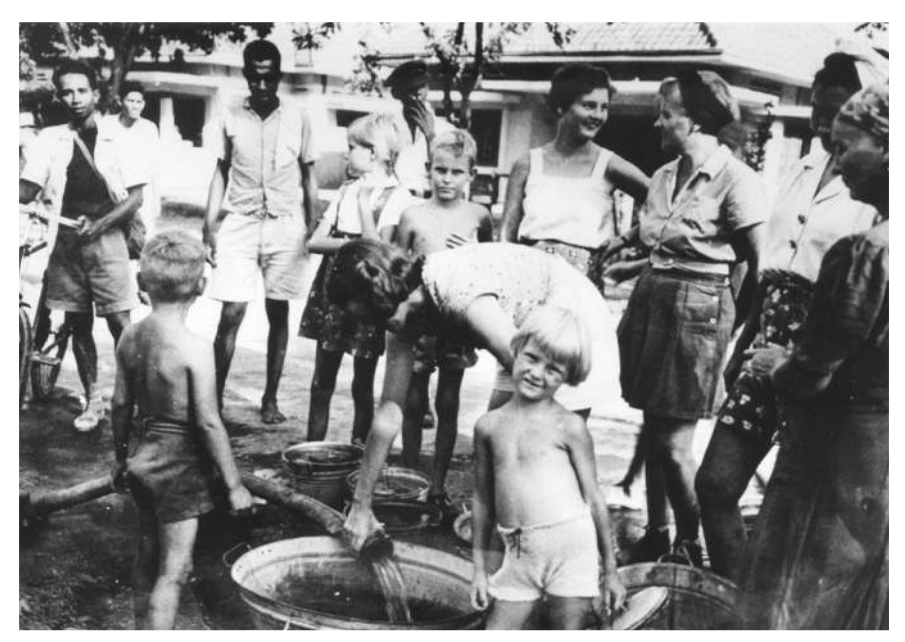
17. Children and adults in a former Japanese prison camp.

The silence or "mildness" Brouwers refers to failed as a strategy of integration because it not only did not help the survivors gain the place they desired in Dutch society, but also prevented them from coming to terms with their past. The "symptoms" of the trauma sustained during the internment and the motifs related to the narrator's memory of camp life might at first blush seem extreme. They are, however, consistent with the expectations of certain current psychological and therapeutic models. If the symptoms seem extreme, it is interesting to know that this fact need not be interpreted as exaggeration on the part of Brouwers the author. It should rather be noted that the phenomena mentioned fall within the realm considered normal or expected by psychological practitioners who deal with delayed traumatic symptoms, and in particular resemble patterns of behavior of men who were interned in Japanese camps as young boys. Whether this fact means that Brouwers' characters' experiences are generally "true" in some sense, or whether one concludes that this demonstrates only