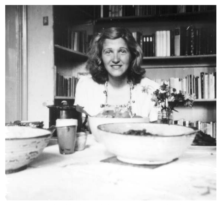
4. Marga Minco, hair bleached, in hiding (ca. 1943).

While Marga Minco's De glazen brug , published in 1986, shows striking thematic similarities to The Assault , any discussion of the text or its context must begin with one major difference – that of viewing the memory of the occupation from the perspective of Jewish subjects. In some sense, nearly all of Minco's works from 1957 to the present deal thematically with the occupation and its consequences for post-war