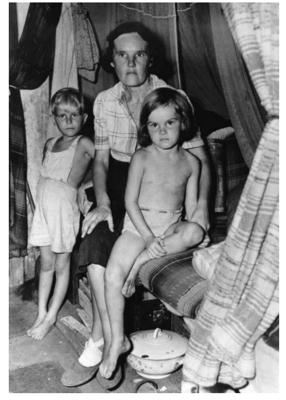
A mother and two children at Tjideng camp, Batavia, Java.

In addition, the protagonist's "misconnected" relationship with his mother is also rep-170 resented as related to his violent fantasies about his (female) lovers, an effect which may on the surface seem extreme. Aesthetically speaking, this repetition is another instance of "octaviteit." On the other hand, an ICODO study on the experiences of young boys interned in Japanese camps offers evidence of possible developmental reasons for such reactions from the psychological point of view. If this is correct, the feelings and responses represented in Sunken Red are not nearly as extreme or exaggerated as some readers have claimed, but rather very much in concert with what would be predicted on the basis of psychoanalytic theory applied to the situations of the camp. Once again, the appropriate conclusion would be not that Brouwers lied, or exaggerated - thus losing credibility with the general public - but rather, that his presentation of the past falls within the realm of responses considered appropriate, "normal", by his culture. Whether one considers his symptoms in line with what psychological theory has indicated to be appropriate, or whether one prefers merely to note that his responses are in concert with what would be expected of those in that specific cultural situation, there is no doubt that the feelings and behaviors he attribut-