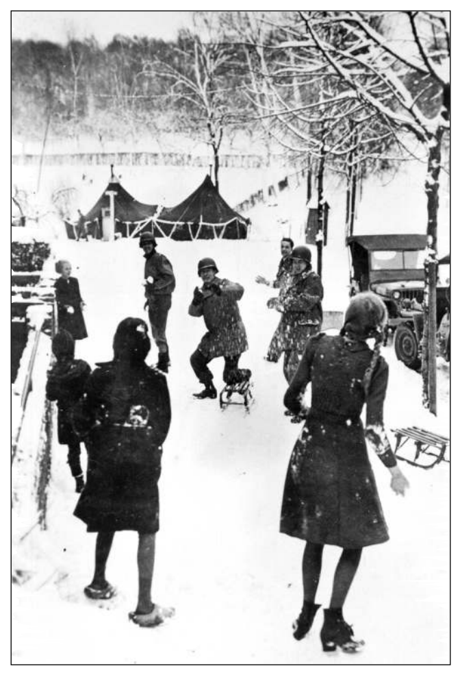
12. Dutch children enjoying a snowball fight with U.S. officers.

And there are people who did not experience the war because they were born after the war had ended. There are more and more of that sort. They have to