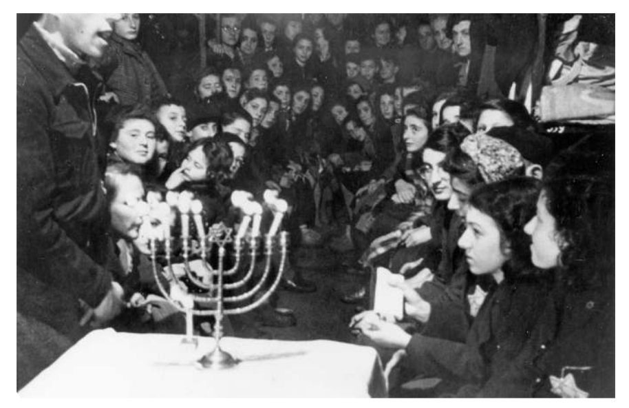
7. Westerbork Transit Camp in the Netherlands.

ly expressed by Dutch citizens who survived the occupation. Fortunately, their bluff has not been called in recent decades.