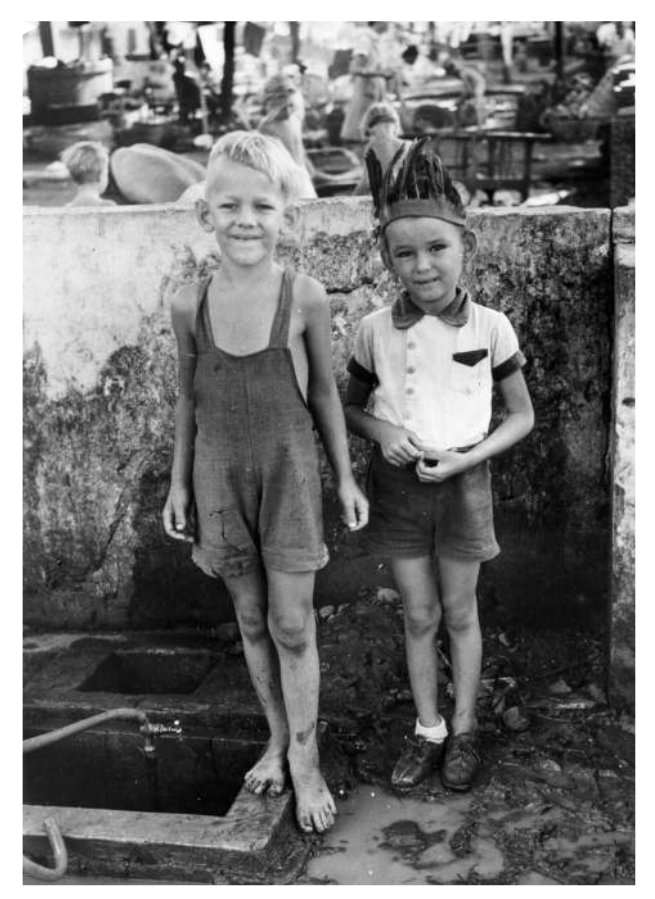
15. Children from Tjideng prison camp, Batavia, Java. Photograph taken after the liberation.

Throughout this text, I have identified a number of works in Dutch literature which show a marked interest in the history and memory of children of the war, and I have discussed a number of fictional and non-fictional texts published in the Netherlands in the 1980s which use the memory of World War II as their thematic material. Evoking the memory of World War II allows the Dutch authors I have considered to take on any of a number of issues; their reasons for doing so range from predominantly formal concerns to the engagement of notions centrally important to the culture. First, the war as a thematic element can provide challenges to the writer's craft by providing a means to inject excitement and upheaval in a (fictional) society which otherwise sees itself as a stable and placid land populated by persons whose everyday lives