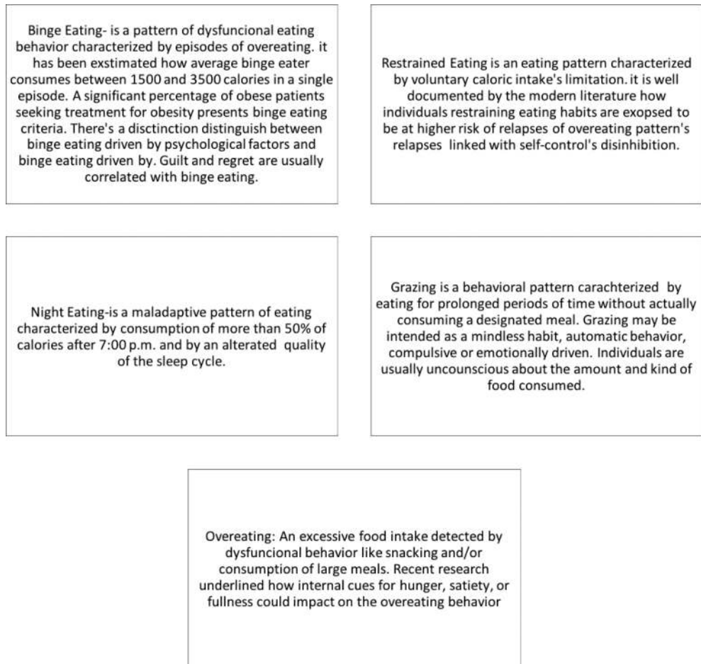
Figure 2. Dysfunctional eating behaviors.

Scientific literature is full of examples about how interventions exclusively aimed at weight loss results in bankruptcy over time, with a regaining of the weight lost during hospitalization within 3 years [5, 6]. It becomes clear that the multifactorial nature of this pathology requires multidisciplinary interventions, able to combine the different needs and urges of each individual, from a clinical, psychological, and social perspective. Psychological factors, in particular, influence both weight loss and, more importantly, long-term weight loss maintenance. Cognitive-behavioral