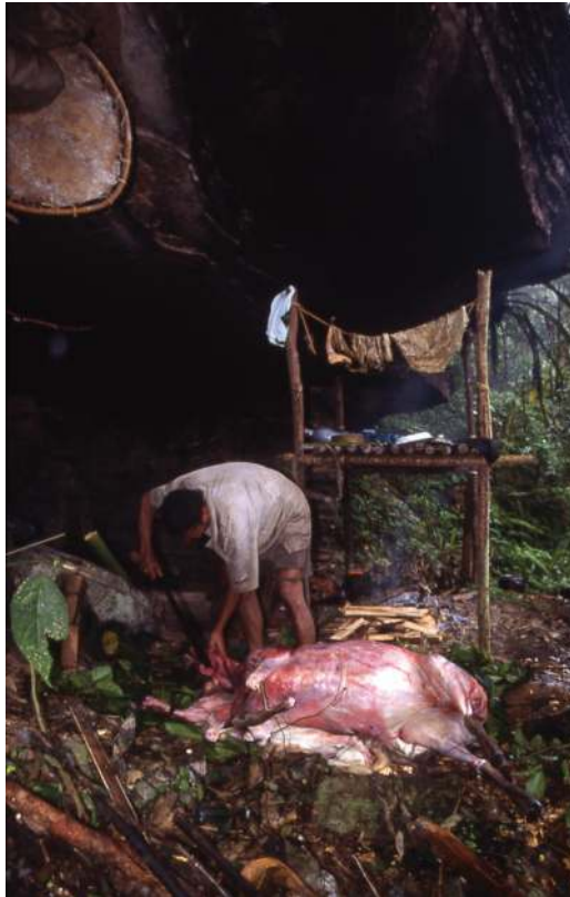
Figure 4. A man who cuts a Timor deer at his liakika .

Some of the awa or sira tana are good spirits ( alowa oho ), while others are evil ( alowa kina ). Natural spirits who inform the villagers of their names in their dreams are good. The villagers