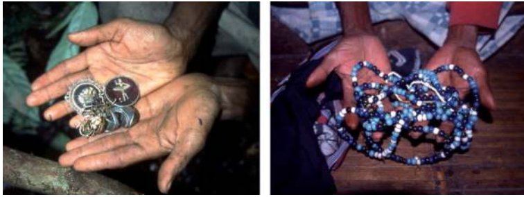
Figure 5. Offerings to sira tana and awa .

believe that if a trapper intones the names when offering or setting traps, he or she succeeds in trapping. On the other hand, there are evil natural spirits such as the awa kina , who try to make hunters fall from trees or get injured by machetes. Then there is the evil sira tana that makes villagers get lost in the forest. A forest where a villager once disappeared or a villager lost his/her way is considered as a place in which evil natural spirits have been dwelling. These forests have not been used for a long time by the imposition of seli kaitahu .