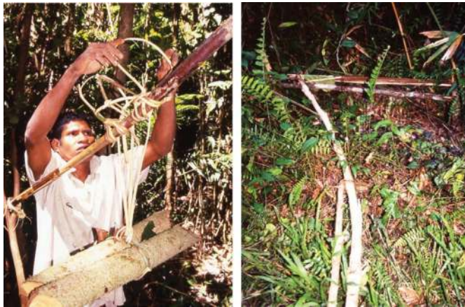
Figure 3. Left: a weighted noose trap, sohe . Right: a spear trap, hus pana .