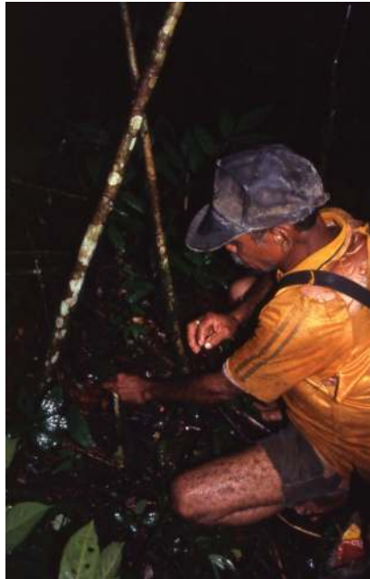
Figure 6. A man who conducts a ritual to impose seli kaitahu .

After the ritual is completed, nobody including the person who imposed the seli kaitahu and the forest owner can trap or hunt in that area until the populations of forest games recover. That if one violates seli kaitahu , he or his family members will surely meet with misfortune such as falling from a tree, getting injured with a machete, suffering from illness, and so on, because of the sanctions imposed by the spirits.