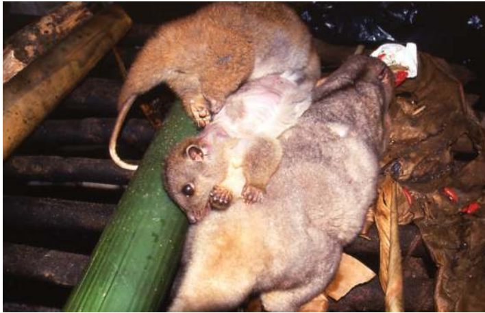
Figure 2. Cuscus ( Phalanger orientalis ).