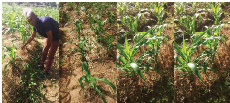
Figure 4. Cross section of mulched maize farms available in the study area.

aeration and moisture holding capacity of the soil. Types of grasses usually used for mulching purposes in the study area include: spear grass ( Heteropogon contortus ), and guinea grass ( Panicum maximum ). [57] observed that growing of varieties of crops on the same plot of land is an appropriate adaptation strategy for farmers because it helps to avoid complete crop failure as different crops may be affected differently by climate variability and may also require different soil nutrients.