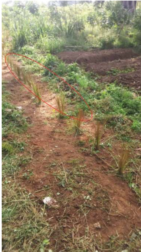
Figure 5. The type of vertiva grass (red circled) that is planted for controlling erosion on farm farms in Anambra State.

Consequently, some smallholder maize farmers plant vetiver grass ( Chrysopogon zizanioides ) in ( Figure 5 ) to control erosion menace on their maize farms.