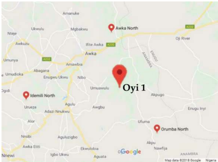
Figure 3. Map of Anambra state showing the four sampled study sites of Akwa North, Idemili, Orumba North and Oyi 1 local government areas (L.G.A.).