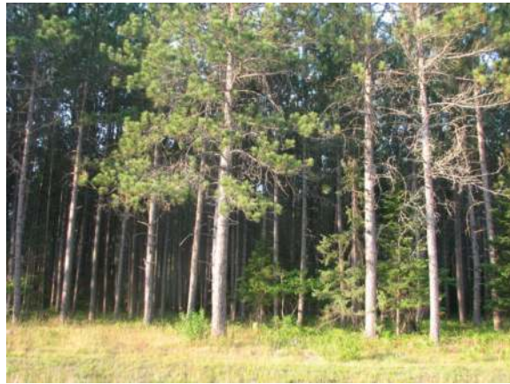
Figure 2. Image of sample number 67 of a forested landscape in the upper peninsula of Michigan (visual score of 38.548).