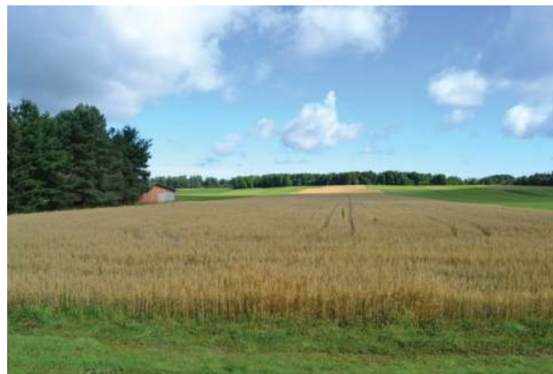
Figure 3. Image of sample number 80 of a farmland landscape in north-east of the lower peninsula of Michigan (visual score of 44.09).