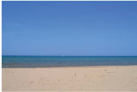
Figure 11. An image of a great lakes coastline, generating a score of 47.8.

The results of this study and related studies indicate that land cover type is a strong predictor of visual/environmental quality. In planning and design circles, the nuances of the built environment are heavily debated with small details carefully examined by experts. Yet respondents evaluate these cover types relatively uniformly. In other words the refined changes and differences observed by experts and taught in planning and design schools are not necessarily observed/detected by the public. For experts the differences between communities can be quite distinct. As Charles Jencks indicated, there are at least two levels of cognition: the expert's and the public's [41]. For example, architects debate the merits of buildings; however, the research suggests that a poor building in a warehouse district or a noted piece of architecture such as Frank Lloyd Wright's Falling water house are perceived as simply structures and the less of them comprising the view, the more the environment is preferred [23].