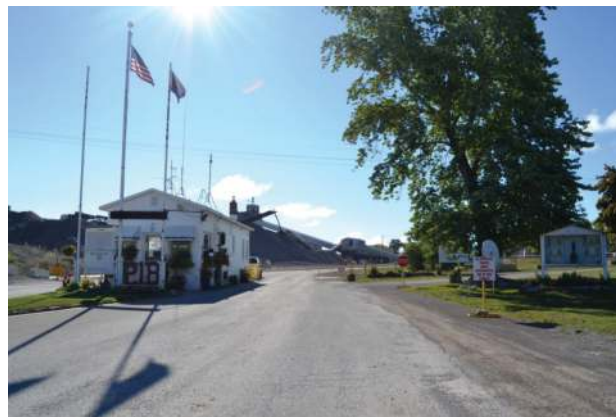
Figure 6. An image of sample number 77 of an industrial environmental (with a visual score of 78.778).