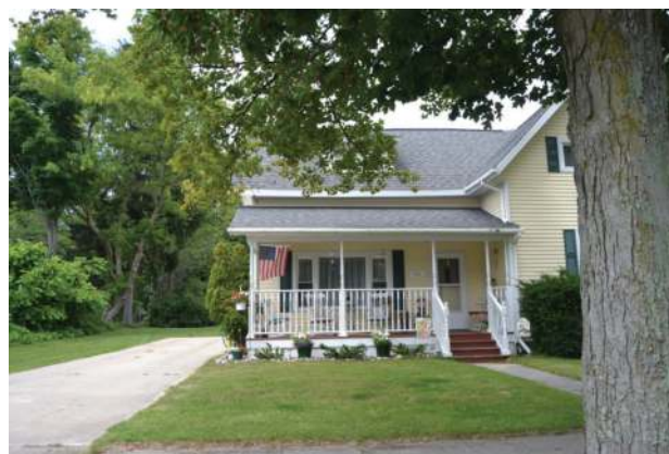
Figure 4. An image of a residential landscape (urban savanna with visual quality score of 46.587), sample number 12 in the northwest of the lower peninsula.