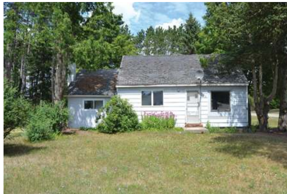
Figure 9. An image of a modest rural residential setting collected in the study area with a score of 46.6.

The map resulting for this study is an image representing the spatial perceptions of the respondents concerning the quality of the landscape across the state. As the land is managed and developed, the scores can be recomputed to estimate the perceived changes (both improvements and degradation) for the state. With additional research, the map could be considered a metric of the state's general perceived environmental quality. Across the globe, people are concerned about the impacts of human's transforming the environment; yet, comparatively, the compiled total environmental quality has not appreciatively changed since the arrival of Europeans, Africans, and Asians (a score predicted to be around 43 between the years 1816 and 1858 to a score of 47.4 in the year 2001, which is not significantly different in perceived quality) [40]. Figures 9–11 are images from the landscape with scores near the current expected mean for much of the state. Notice none of the images are spectacular; however, none of the images are dismal either.