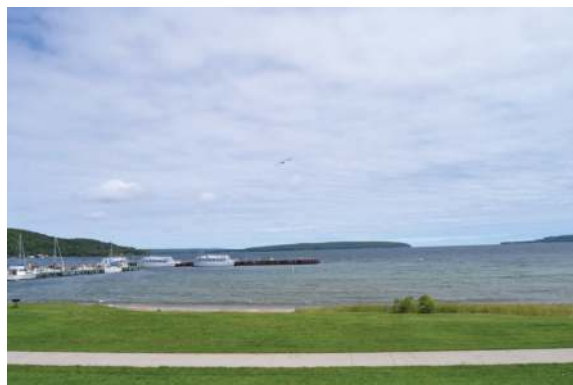
Figure 7. An image of sample number 46 of a primarily open water environment of Lake superior (with a visual score of 41.498).