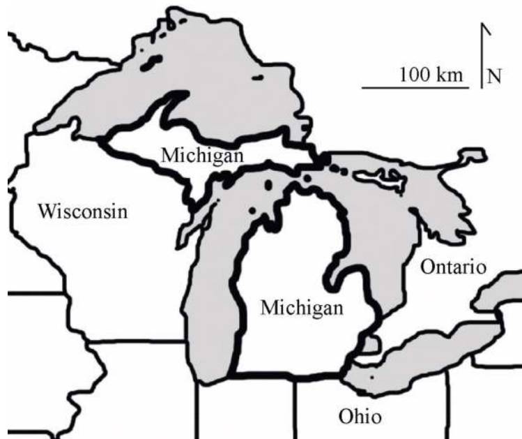
Figure 1. The location of Michigan, the study area in North America.

Also during this recent timeframe, attempts to explore mapping making potential were renewed. Lu et al. examined the Lower Muskegon watershed, located on the west side of the lower peninsula in Michigan [26]. He and his colleagues studied images of urban areas, farmland, wetlands, and forests and attempted to construct an environmental quality map of his study area. The results he obtained through statistical analysis revealed that the relationship between his predictions in the map and the real photographs are in concordance and at a reasonable (95%) confidence level. He concluded that visual/environmental quality could be mapped and reliably predicted in the Lower Muskegon Watershed. There was a strong relationship between the perception of environmental quality and land cover. Following Lu, Jin examined the southern portion of Michigan, an area much larger than the Lower Muskegon Watershed [27]. She reported similar results to Lu. She had demonstrated that it was possible to develop reliable maps for much larger areas, but still not at the scale of a province or state.