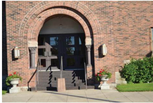
Figure 5. An image of sample number 73 of a downtown environment (cliff detritus with a visual score of 82.766).