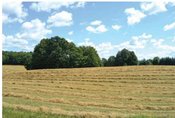
Figure 10. An image of a typical agricultural landscape found in much of Michigan. This image produced a score of 44.1.