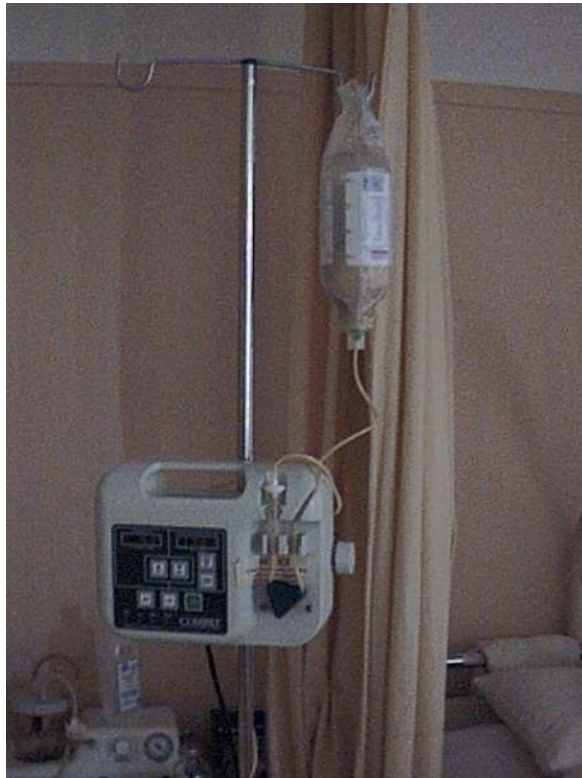
Figure 2. The enteral feeding pump type COMPAT. The system is a relatively simple, lightweight, easy to use for managing all types of enteral feeding. Have an audible and visual alarm that alerts you when each of the following conditions: empty container feeding, low battery, change the dose, or the existence of free flow out of the system (waste). The memory of the pump retains infusion rate, volume delivered, dose limit even after turning it off. It is designed to provide precision dosing. Start enteral feeding schedule and progress.

where enteral feeding is expected to be required for longer than 2–4 weeks, for example in patients with acute stroke [91]. Although complications of PEG tube feeding are rare in stable patients, they become increasingly common in critically ill and debilitated patients. One of most feared complication of enteral feeding: aspiration hypoxia/ pneumonia. Clinically, gastric residual volume (GRV) measurement was frequently used as marker to predict aspiration & pneumonia. Elevated GRV: associated with comorbidities such as vasopressor use, sedation sepsis, vomiting. GRV: no significance between GRV > 200ml and GRV > 400ml, low sensitivity as a marker of aspiration [92].