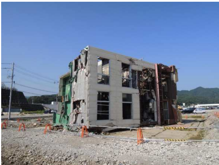
Figure 1: One of the three damaged buildings left in situ in Onagawa Town (photographed in July 2012 by Akira Matsuda). This building was subsequently dismantled and removed in January 2015.

notion of preserving ruins of the tsunami became so popular and yet so controversial.