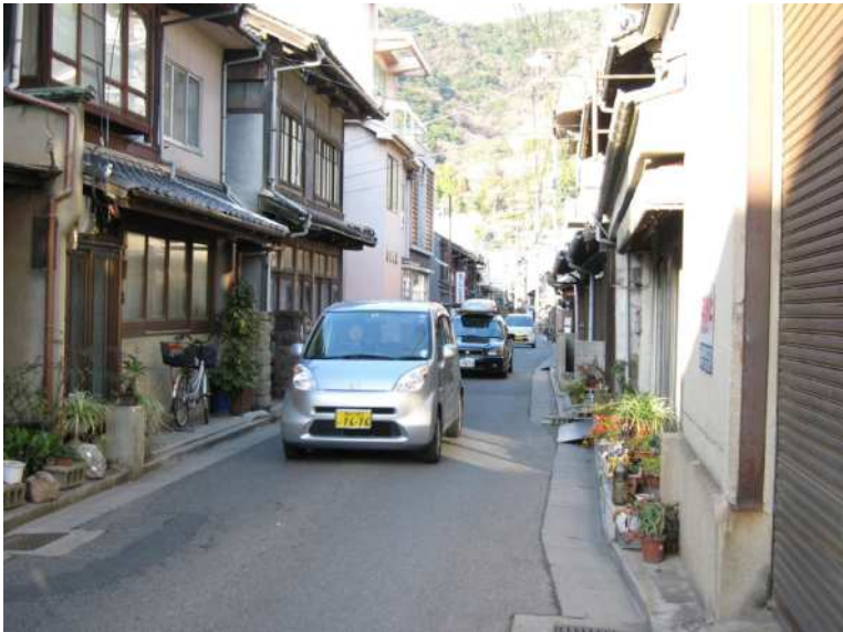
Figure 2: The main road in Tomo, which is only about four metres wide

by constructing a bridge on reclaimed land in the historic port. While the bridge was intended primarily to improve the living conditions of local residents, rather than to achieve large-scale economic development, the impact of its construction became a focus for the endemic tension between the town's economic growth and historic preservation, highlighting the difficulty of operating within the legislative framework for the protection of Tomo's unique cultural landscape. If construction of the bridge had gone ahead, large vehicles that until then had been unable to enter Tomo would have been routed through the town, inevitably affecting its historic landscape and potentially endangering its residents. A number of local residents protested against the plans and initiated a lawsuit demanding that permission for land