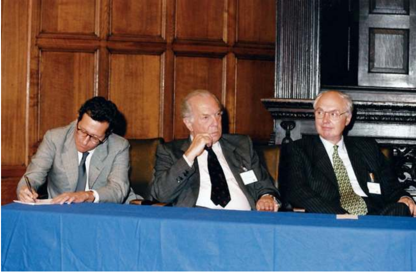
Figure 17: At the Fiftieth Anniversary Conference of the IISS, Oxford, 1998.