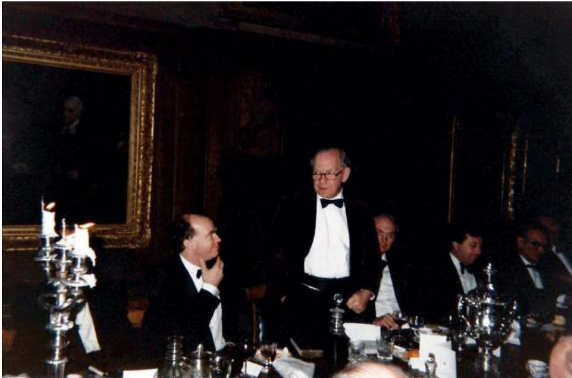
Figure 11: Sir Michael Howard responding at a dinner to mark his 70th birthday, All Souls College, Oxford, December 1992.