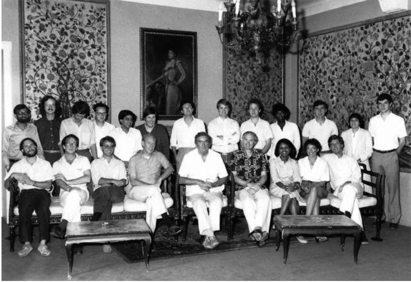
Figure 6: IISS/ACA 'New Faces' Conference, Bellagio, Italy, July 1984.