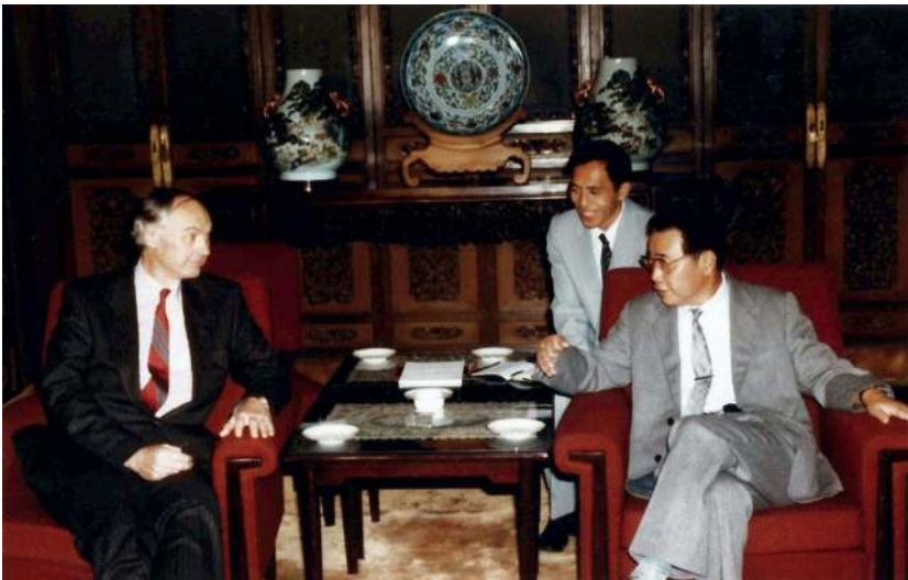
Figure 9: Robert O'Neill with Deputy Premier Li Peng, Beijing, September 1986.