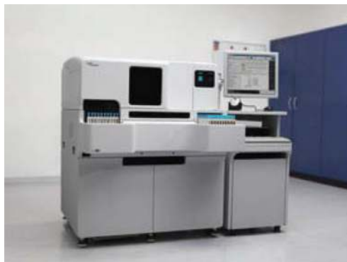
Figure 1. Cs-5100 systems to measure FDP and D-dimer (Sysmex Corporation., Hyogo, Japan).

In our facility, FDP and D-dimer are measured by an immunoturbidimetric method using Cs-2000i and Cs-5100 systems (Sysmex Corporation., Hyogo, Japan; Figure 1 ). It takes about 15–20 minutes to measure FDP and D-dimer with this instrument.