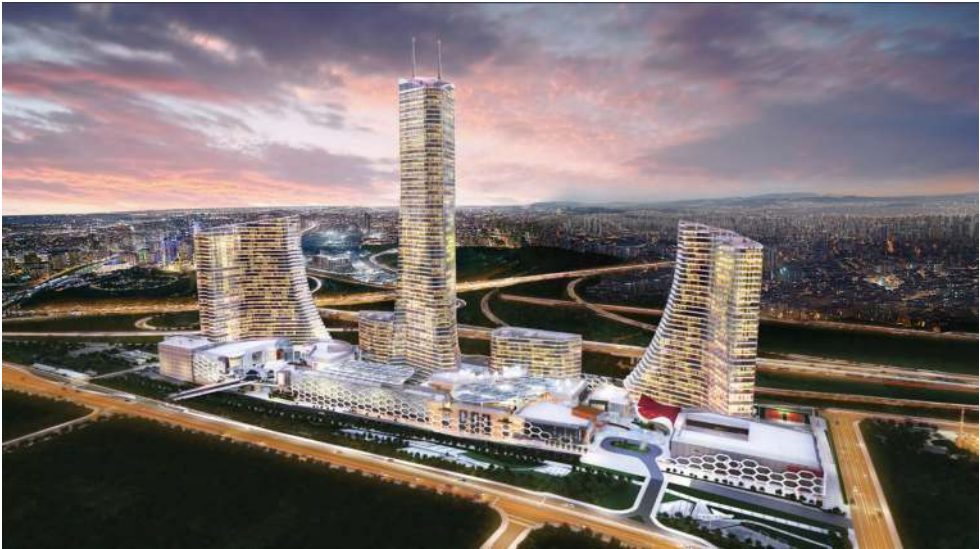
Figure 1. The image of a gated community in İstanbul named Metropol-Istanbul.

( Palaces of Istanbul ) instead of a worldwide star like Jennifer Lopez, one of the unforgettable actress of Turkish cinema, Nebahat Çehre appeared. Even though Nebahat Çehre appeared in national movies and series that highlight our traditional values, she has the image of a modern woman in the eye of the public. She became famous after the beauty pageant she entered and then she continued her career as an actress. Even though she is in her seventies, she is still a popular figure on screens with her beauty and attractiveness.