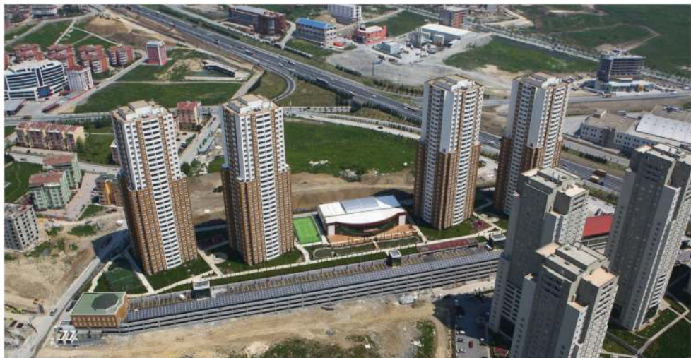
Figure 5. The image of a gated community in İstanbul named “Solarkent Evleri” –Solarkent Residence.

Even though attractiveness and credibility of the celebrity is exploited in housing advertisements, we see that other meanings that the celebrity possesses are important in terms of