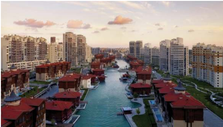
Figure 3. The image of a gated community in İstanbul named “İstanbul Sarayları” (palaces of Istanbul).

In housing advertisement where the credibility trait of the celebrity endorser is emphasized, it is possible to run across examples where celebrities have expertise in fields that are directly or indirectly related with construction sector like engineers, architects, and investment specialists.