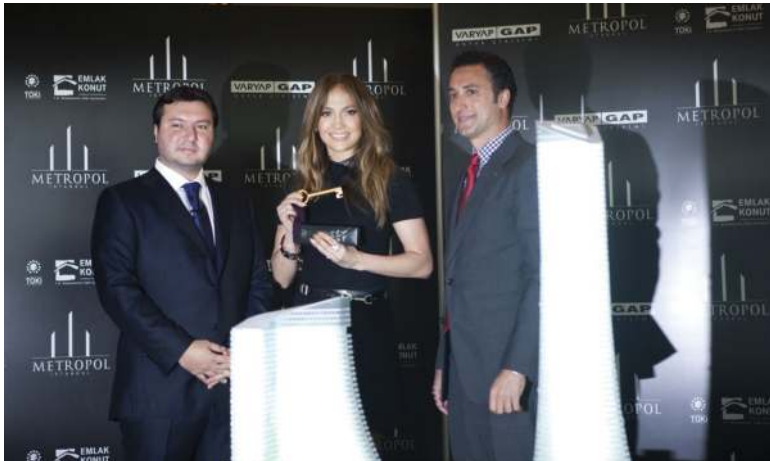
Figure 2. Launching event of the Metropol-Istanbul Project where the spokesperson was Jennifer Lopez.

( Palaces of Istanbul ) instead of a worldwide star like Jennifer Lopez, one of the unforgettable actress of Turkish cinema, Nebahat Çehre appeared. Even though Nebahat Çehre appeared in national movies and series that highlight our traditional values, she has the image of a modern woman in the eye of the public. She became famous after the beauty pageant she entered and then she continued her career as an actress. Even though she is in her seventies, she is still a popular figure on screens with her beauty and attractiveness.