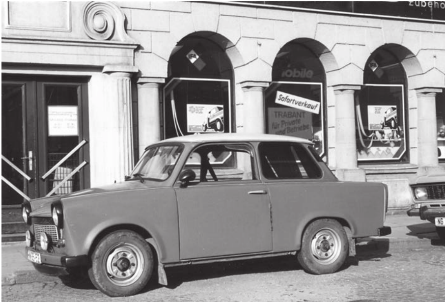
Figure 8.1 – Rudolstadt 1989/90, Trabant – instant sale

A West German furniture salesman who had opened a business in Rudolstadt right after the Wall fell, selling remnants bought up in the FRG, explained that it did not matter what he brought, it all sold anyway, “the people wanted everything, as long as it came from the west.” When traders from Bayreuth, a relatively nearby West German town, brought their wares to the market in Rudolstadt, everything sold like hot cakes, despite the fact that a pineapple cost 24.95 DM and a bar of chocolate 7.50 DM. With wages many times lower than in the FRG (even at the fictitious exchange rate of 1:1), these prices were indeed “überteuert [exorbitant],” but as the residents of Rudolstadt asked a local journalist: “Wann habe ich einmal die Möglichkeit, das Alles einzukaufen [when will I be able to buy all this?].” 12