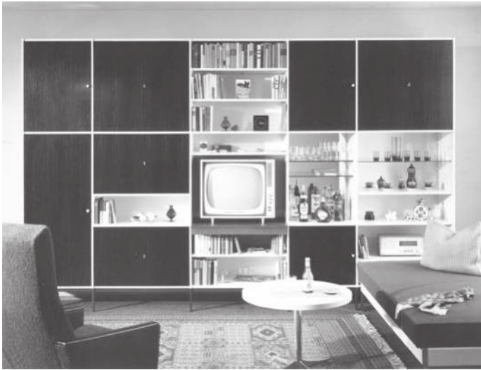
Figure 4.7 – East German living room, undated, late 1960s