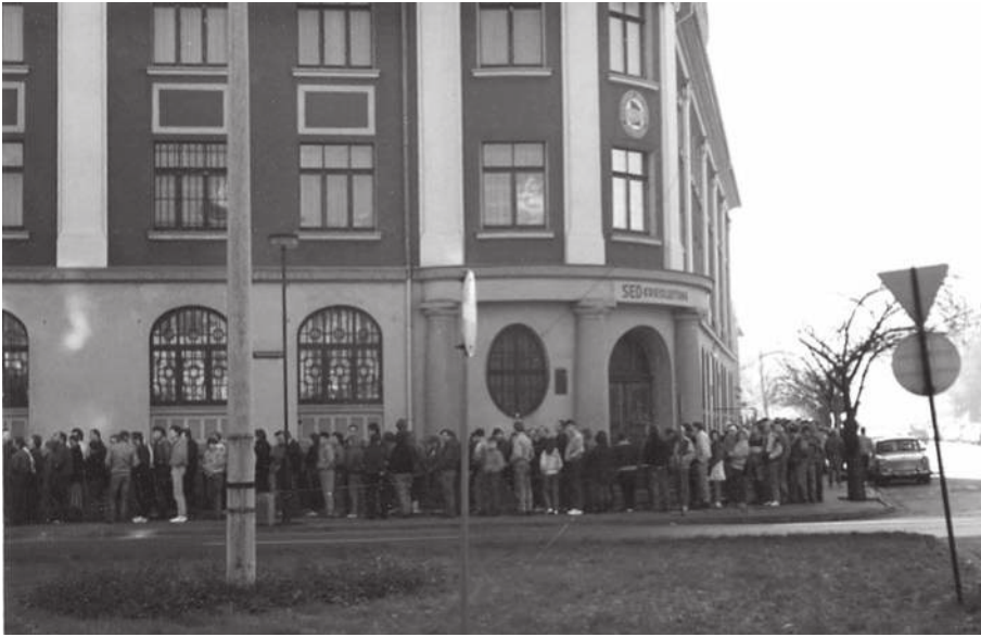
Figure 8.2 – Rudolstadt, July 1, 1989: Währungsunion [monetary union], queue in front of Rudolstadt's bank