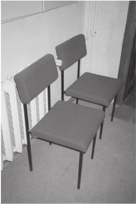
Figure 4.13 – Chairs in a waiting room in Rudolstadt, 1994