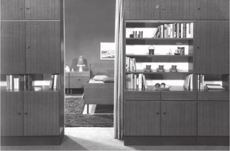
Figure 4.8 – Multiple room wall system ‘Frankfurt,’ undated, early 1970s