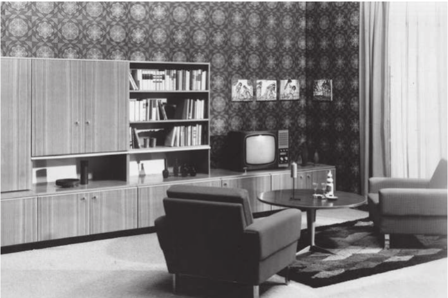
Figure 4.9 – East German living room interior with wall system ‘Carat,’ 1972