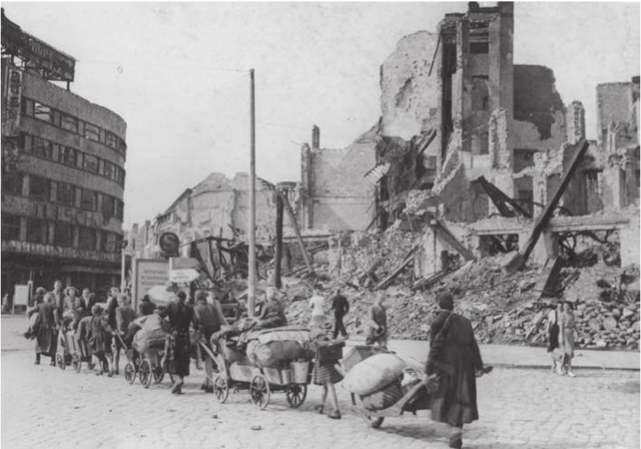
Figure 2.2 – Berlin, 1945, refugees