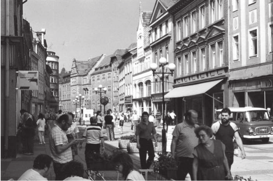
Figure 1 – Rudolstadt, 1994, main shopping street

looking world of the west came to be seen as the place of “fulfillment and ultimate arrival.” 3