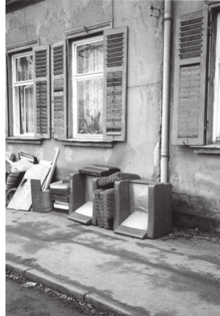
Figure 4.1 and 4.2 – Rudolstadt, 1994, pile of rubbish

libraries and town halls, the decoration in the few shops not yet renovated, and the little East German neon signs that were still there. I happened to visit Weimar on the day when the municipal rubbish collectors picked up large items, thus allowing me a glimpse of the remnants of people's interiors that were now piled up on the side of the street. The overall scene left an impression similar to the ones I had encountered in the waiting rooms of public buildings. The colors were rather dreary. Most objects were rectangular, hardly adorned or plain, and rather drab. As far as the objects were decorated, these decorations did not seem to match the overall rectangular shapes of the objects. When I returned home, my general impression was that the GDR had had a rather severe material culture. When I later bought a catalogue with pictures of former East German consumer goods, this impression was confirmed. 2