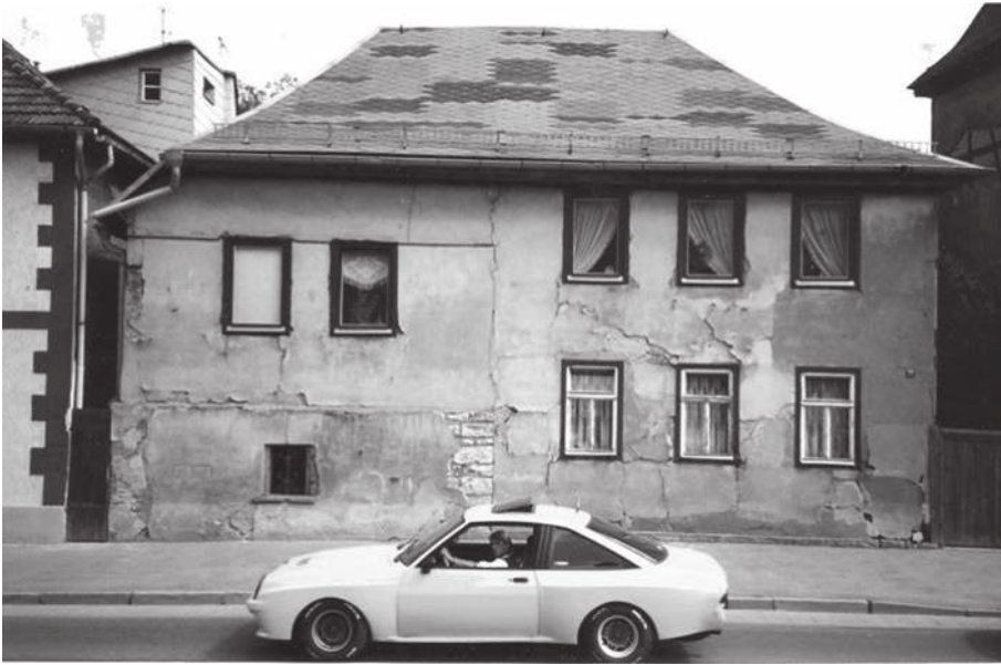
Figure 8.5 – Saalfeld (neighboring city, 6 miles away from Rudolstadt), 1994

the cheap lace blouses, plush animals, “crystal” glasses, bright flowery “porcelain” dinner services, “real leather” jackets for 10 DM, and jeans recommended as “real Live’s Strauss [sic]: there is nothing more American.”