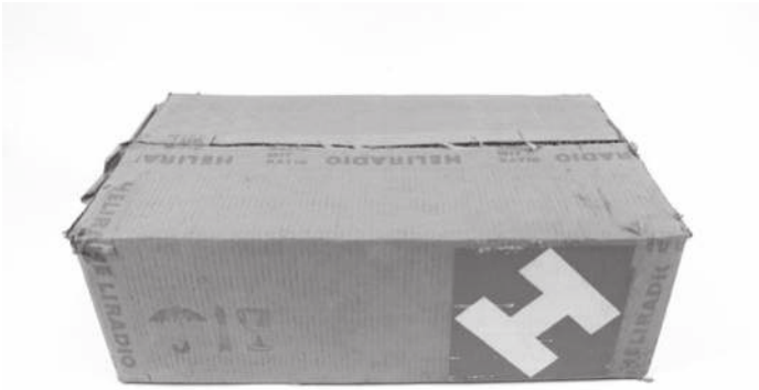
Figure 4.12 – Packing of a Heli-Radio receiver. Regular corrugated cardboard was used in combination with a tag showing the company's brand label. Heli-Radio, a private company until 1972, was famous for the professionally designed corporate design of the mid-1960s as well as for their functionalist radio designs. Undated, probably 1970s or 1980s.

Besides quality, the appearance of most consumer goods also suffered from the poor economic circumstances, the director of Gera's Museum of Applied Arts explained, while showing me the museum's East German packaging and consumer goods collection. Going past the material remains of the old days, he repeatedly drew my attention to the poor and loveless appearance of the products. "And then always this serial production," he sighed, pointing to the drugstore products.