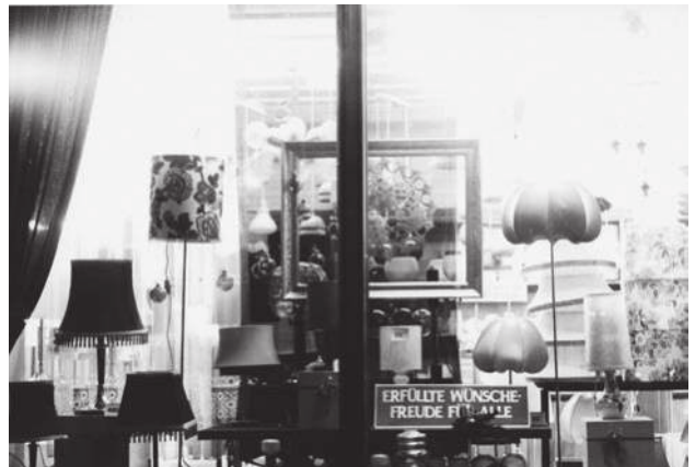
Figure 4.5 – Eisenhüttenstadt, Leninallee, lamp and electric appliances shop, undated, 1970s