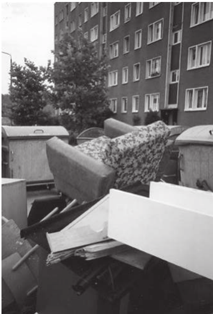
Figure 4.4 – Rudolstadt, 1994, pile of rubbish