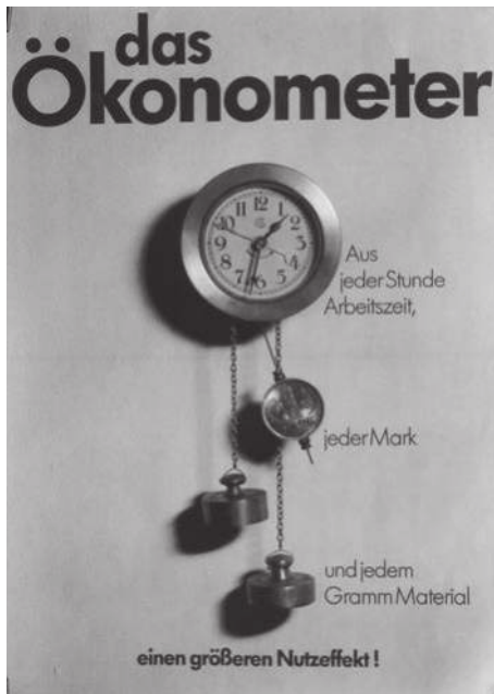
Figure 4.10 – Ökonometer

was almost perpetually the case: then there were no medicines for headaches, and then there was nothing for rheumatics or corns, etc.