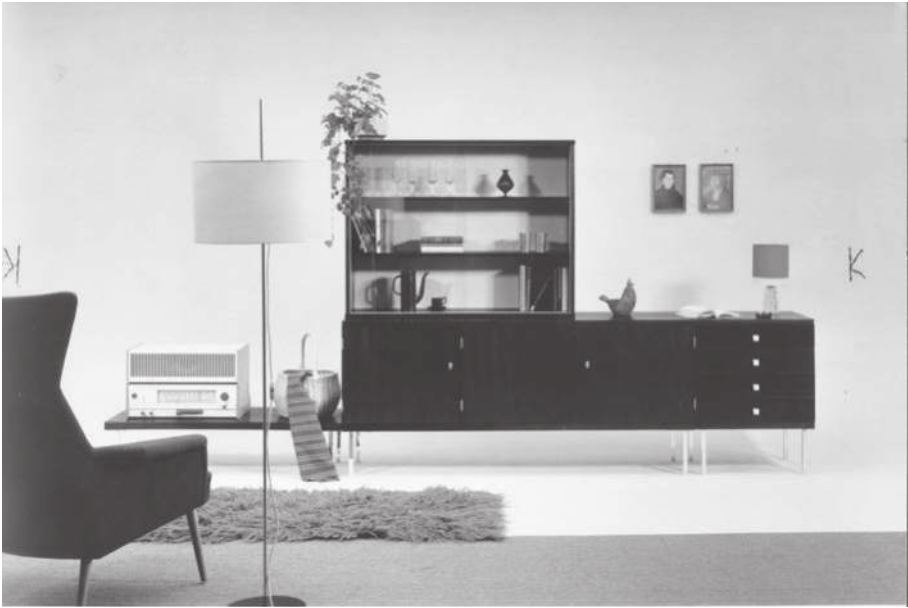
Figure 4.6 – East German living room, late 1960s