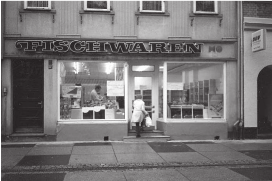
Figure 4.3 – Rudolstadt, 1993, fish-shop