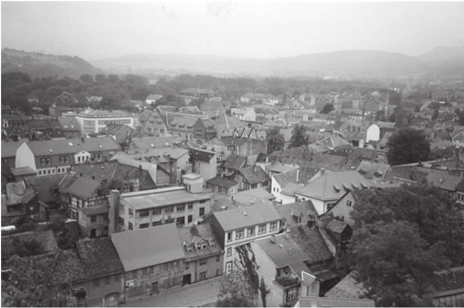
Figure 8.3 – Rudolstadt, 1994, the city as seen from the Heidecksburg (castle on Rudolstadt's hill)

differences were visible between the buildings and streets that had been renovated, and those that had not. Whereas some shops were identical to the shiny, garishly colored shopping paradises that overshadow the shopping streets in the west, others had not changed visibly in forty years. If you looked down from the castle that towers above Rudolstadt to the town below, you see a similar picture unfolding. Buildings that had obviously not been touched for forty years stood next to those that had recently been given a complete make-over. Similar contrasts between old and new, neglected and renovated were visible everywhere: at parking places and on motorways, where next to the shiny, brightly colored Mercedes and four-wheel drives, a great many old Trabants were still chugging along. Comparable differences could be seen in the interiors of houses and public areas. In chapter seven, I described the visible differences between the decoration and interior design of the houses that had undergone an entirely new refurbishment and those which showed no sign of having being changed in the past forty years. Whenever I visited people at their place of work, the same picture was evident; there was often a great contrast between the rooms where the managers worked and those that could be accessed by everyone or where subordinates worked. The differences in outward appearance were so obvious that people going to work everyday became aware of