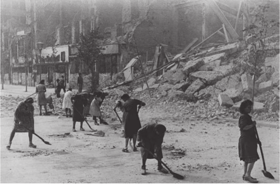
Figure 2.1 – Berlin, 1945, clearing the ruins