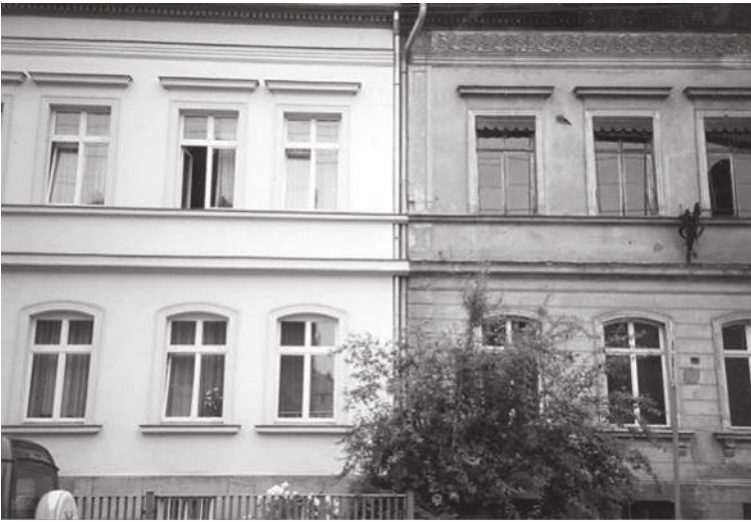
Figure 8.4a and b – Rudolstadt, 1994, houses

a divided society, one half of which scarcely seemed to matter, while the other half appeared to be fully in control.