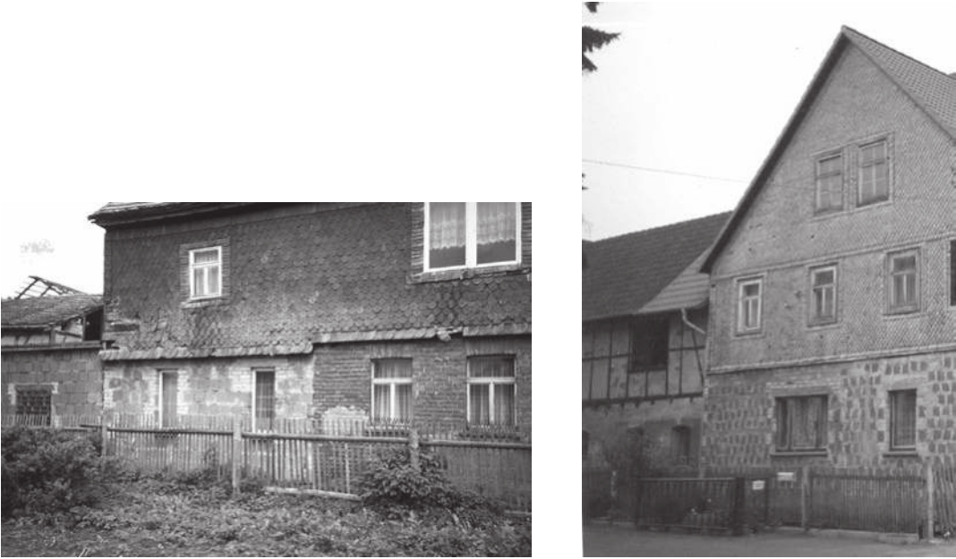
Figure 4.14 a and b – Houses in (the vicinity of) Rudolstadt, 1994

in the children’s wear shop, for instance, who could have a seat in exchange for babies’ nappies.