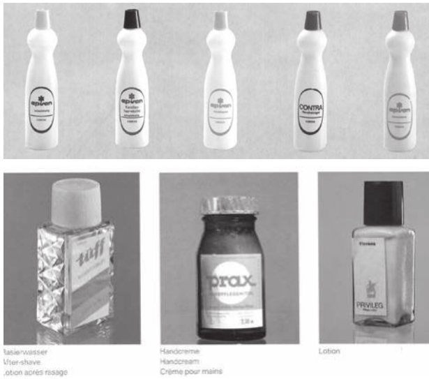
Figure 4.11a and b – East German drugstore products