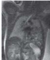
Fig. 1. 34-week fetus with left-sided congenital diaphragmatic hernia.

All fetuses with CDH should be evaluated for the presence of syndromes and/or additional major malformations given that they so commonly coexist and significantly affect the prognosis. Involvement of a medical geneticist in the evaluation of these families can be helpful. The measurement of either the expected/observed LHR or the lung volume by fetal MRI have been useful to predict outcome; however, since the predictive value of these measurements varies from center to center, results must be interpreted with caution.