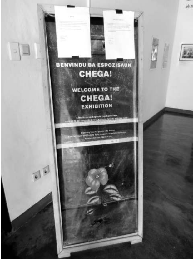
1.2: Sign welcoming visitors to the Chega! exhibit at the former Comarca prison facility, Balide, Dili, Timor-Leste.

away. In fact, they have spread from post-conflict zones in the global South (especially Latin America and Africa) to developed countries, most notably Canada and Germany. Appearing as a “restorative justice” alternative to the “retributive justice” model of criminal prosecutions of human rights violators, they answer a clear need in many societies. 9 And they are said to offer the bonus of building reconciliation between communities previously in conflict—most famously, in post-apartheid South Africa, where the country was to be healed by a truth and reconciliation commission. As chapter 2 explains, scholars have offered a mixed verdict on the South African experience of reconciliation and the model of truth commissions it bequeathed. Nevertheless, the increasing use of truth and reconciliation commissions around the world demonstrates that the tool meets the perceived needs of multiple societies.