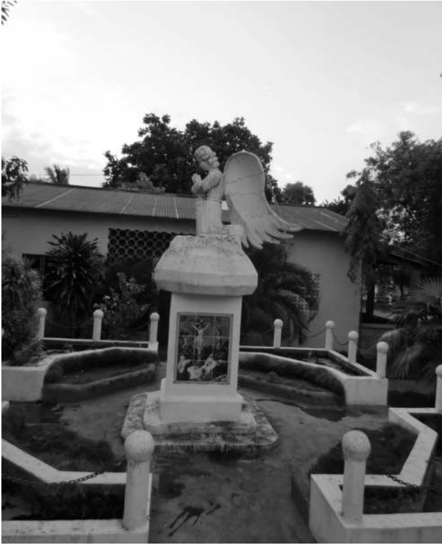
1.1: Popular monument to victims of mass killings outside the local Catholic church, Liquiça, Timor-Leste.

recent truth and reconciliation processes in a part of the world sprawling from Sumatra to Solomon Islands, from the islands of Southeast Asia into the islands of the Melanesian Pacific. The authors include scholars and human rights practitioners, engaged academics, and informed advocates whose conversations and comparisons spawned this collection. We see the hope embodied in truth commissions and in reconciliation processes in post-conflict societies. We see links between the disparate experiences of different places: the way gender concerns came to take a more central place in Timor-Leste and Solomon Islands truth commissions; the efforts to embody Indigenous traditions in truth-seeking processes; the vital role of civil society; the importance of seeing truth-seeking as a process that goes before and comes after truth commissions. We also see the barriers to true reconciliation. When calls to seek truth are denied, conflicts persist. When truth commission reports are not followed up, their impact is weakened.