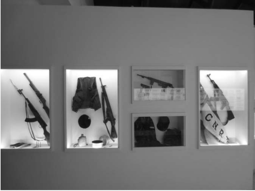
5.1: Display from Archives and Museum of the Timorese Resistance, Dili, Timor-Leste.