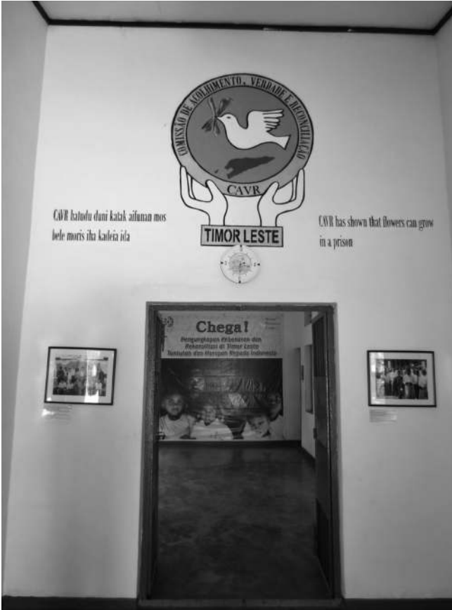
4.1: Entry to Chega! exhibit, Dili, Timor-Leste.

corporations who profited from the sale of weapons to Indonesia to contribute to a reparations program for victims; and for Indonesian officers indicted by the UN-sponsored Serious Crimes Unit and named in Chega! to be denied visas and subjected to other sanctions until their innocence has been credibly established by a court of law.