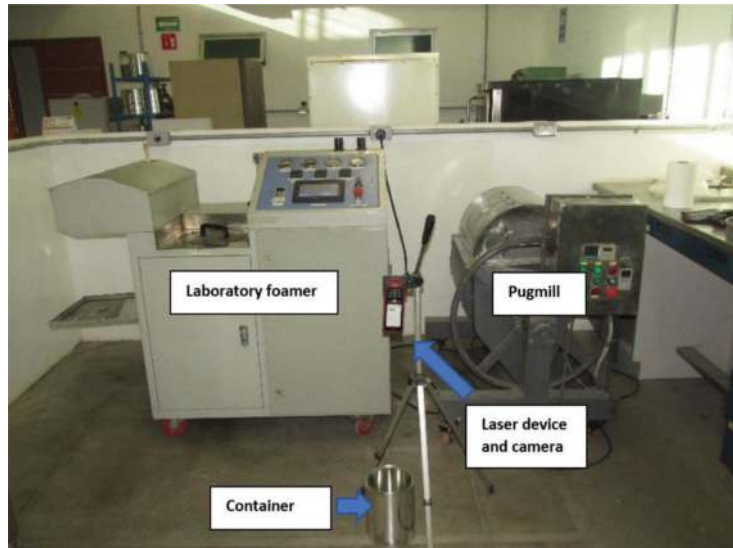
Figure 1. Laboratory test setup for measuring binder foaming characteristics (Lasfalto Laboratory, 2018).