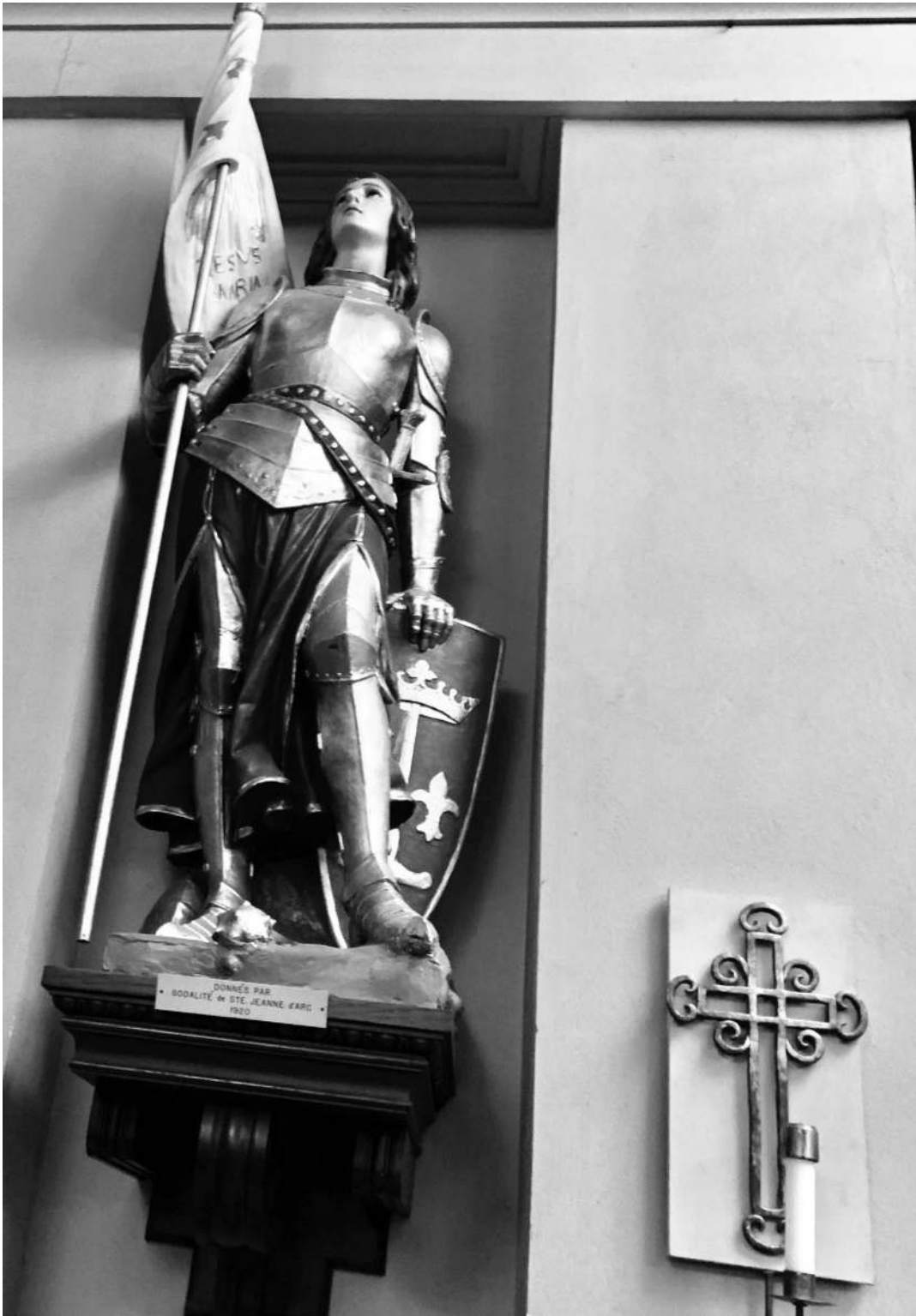
Figure 9: Brown-eyed and brown-haired Joan of Arc in the Cathédrale Saint-Louis, Roi-de-France or St. Louis Cathedral (largely in its current form since 1850) in the French Quarter of New Orleans, Louisiana. Standing figure donated by the Sodalité de Sainte Jeanne d'Arc in 1920. October 2018.