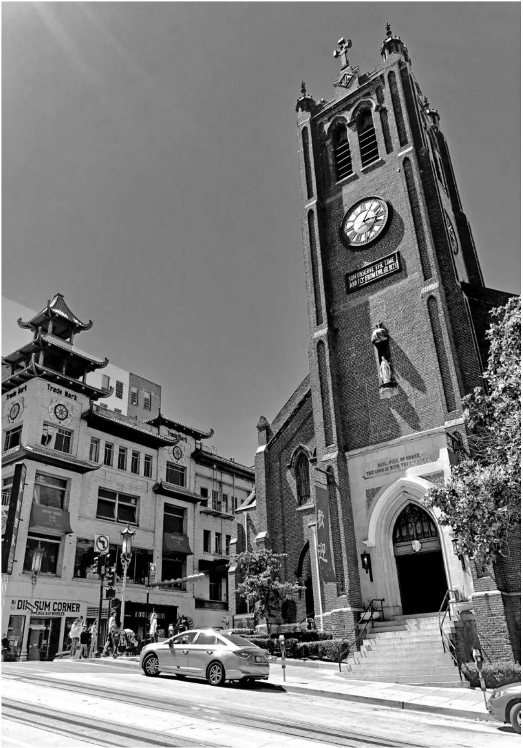
Figure 3: Old Saint Mary's Cathedral and Chinese Mission, San Francisco's Chinatown. Built in Gothic Revival style ca. 1854 on stone foundations from China, the church stands across from the Sing Chong Building built in "Oriental" style just after the 1906 earthquake. July 2019.