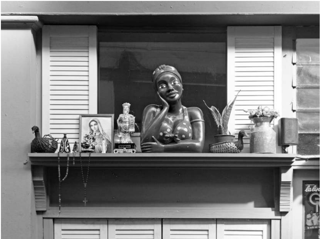
Figure 12: Multicultural storefront in an arcade in Brixton Market, in south London, also known as the “Soul of Black Britain.” In 2006, Jean “Binta” Breeze recorded her “Wife of Bath speaks in Brixton Market” while walking through this arcade. London, March 2014.

In performing Chaucer’s distinctive and bold Wife of Bath in this Black British space, Breeze’s body in motion artfully disrupts perceived social scripts. In “reclaiming” (or reincarnating) Chaucer’s Wife of Bath as a Black British woman, Breeze demonstrates how a contemporary “nation language” of Jamaican English rivals the claims to legitimacy, complexity, and rootedness that Chaucer’s Middle English enjoys.