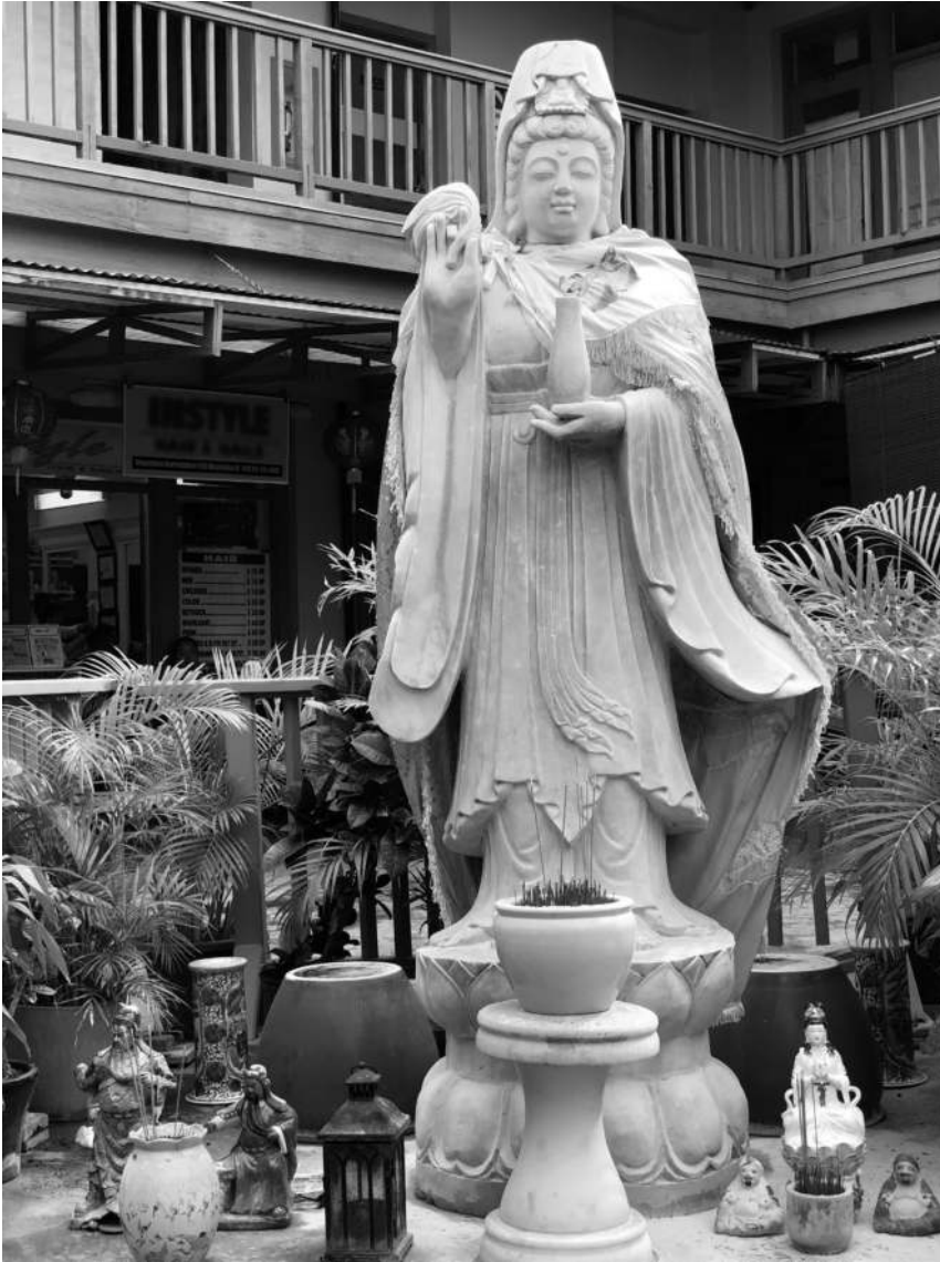
Figure 11: White-robed statue of Guanyin and other female deities in Honolulu's Chinatown. Honolulu, Hawai'i, November 2017.

of a “little bird with a white breast” outside the window with Sin Far “extending ... a blossom from a ... lily plant” at the threshold of a feminized domestic space might suggest to Christian readers the white lily flower so often associated with the Virgin Mary in European literary and artistic traditions, especially representations of the Archangel Gabriel’s appearance to Mary in the Annunciation. 94 Foregrounding fully humanized Chinese characters, this story offers a syncretic and ambiguously racialized annunciation scene. Mermei sits indoors while Sin Far arrives with a “lily” betokening good news. The queer intimacy of this moment also tweaks heteronormative scripts of erotic love, casting Sin Far as the Archangel Gabriel and Mermei as a disabled and deformed Chinese