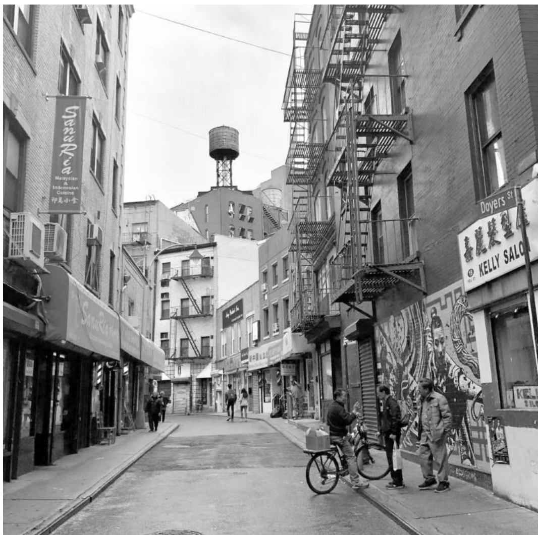
Figure 5: Doyers Street (between Pell Street and Mott Street) in New York's Chinatown today. Wong Chin Foo lived near here and describes Mott Street vividly in "The Chinese in New York" (1888). April 2019.

the environment in and around Mott Street, offering an autoethnographic corrective to white-authored accounts of Chinatown travel. 39 Assuming the position of a "native informant" while strategically employing an objective third-person voice, Wong discusses Chinese hygiene and grooming, religious worship, food preparation, and rich food traditions—dismantling myths of eating rats and opium consumption. "The hygienic functions of cooking elevate the kitchen director in China to high social status," 40 Wong states, noting the quality of dining in New York's Chinatown: "There are eight thriving Chinese restaurants which can prepare a Chinese dinner in New York almost with the