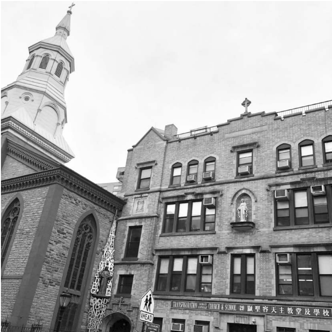
Figure 4: Transfiguration School, Catholic parochial school associated with the Church of the Transfiguration on Mott Street in New York's Chinatown. Situated in a formerly Irish and Italian immigrant parish, the church now serves the largest Catholic Chinese-speaking congregation in the US. November 2019.

tion accusing Chinese men of corrupting young white girls. 37 Throughout the European Middle Ages, “blood libel” traditions (false stories accusing Jews of murdering Christian children to use their blood in religious rituals) incited violence against Jews that continued for centuries, and in his own day Wong addresses how the so-called “rat libel” with its vilifying associations of social corruption contributes to violence against Chinese. 38