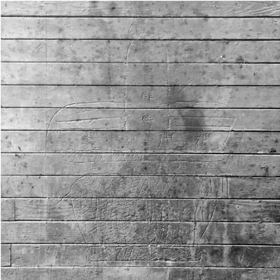
Figure 8: Faint sketch of an ancestral shrine (with multiple family surnames) carved into a wall on the second floor of the former barracks of the US Immigration Station at Angel Island in the San Francisco Bay. July 2019.

Angel Island” poem cited previously is accompanied by a poem that primarily uses identical Chinese characters as its end-rhymes. The response poem begins: 同病相憐如一身 [...] (“I sympathize, the same illness, as if we shared a body...”), and the use of shared rhymes across the two poems formally embodies somatic empathy. 43 A simple drawing of a shrine on the second floor of the barracks creates a “surrogate space” of community with family names sharing an ancestral connection, and elsewhere sketches of ships and houses evoke previous journeys and hometown villages. Crowded writing all over the barracks evokes the immediate context of interrogations as well. Crammed with tiny text, ephemeral “coaching books” helped paper sons and daughters prepare for interro-