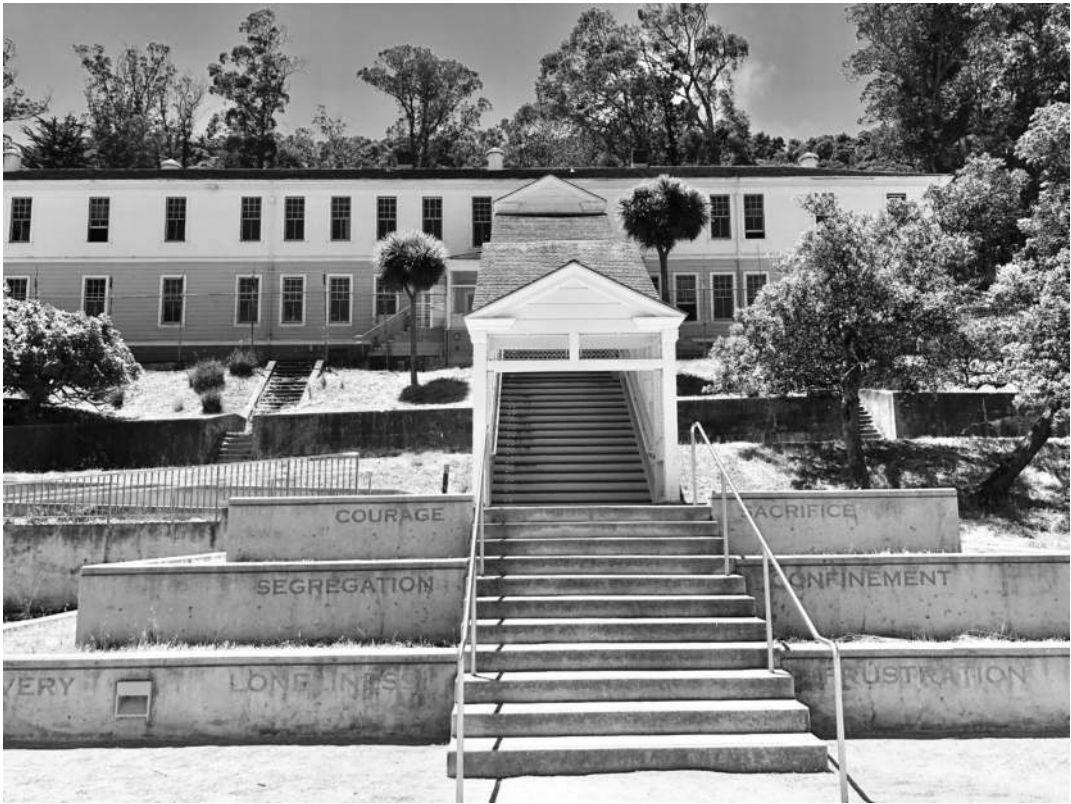
Figure 6: Two-story wooden barracks at the former US Immigration Station at Angel Island in the San Francisco Bay. It operated as a detention center primarily for Chinese migrants from 1910–1940, and the restored site is now a National Historic Landmark. July 2019.

THIS CHAPTER COMBINES medieval literary analysis and ecocriticism to consider the poetic corpus (hundreds of lyrics) that Chinese detainees carved into the wooden walls of detention barracks of the Angel Island Immigration Station, a site in San Francisco Bay currently registered by the United States as a National Historic Landmark due to its cultural significance. Located in waters a boat ride away from the city of San Francisco, CA, this so-called “Ellis Island of the West” was where many newcomers from Asia were processed as they sought entry into the US and it also operated as an immigration detention center from 1910–1940. The majority of the detainees were Chinese with some staying as long as months or years before being deported or “landed” (granted entry into the US). Thick with literary allusions and references to imprisonment and injustice in Chinese myths and literary classics, the mostly anonymous and untitled