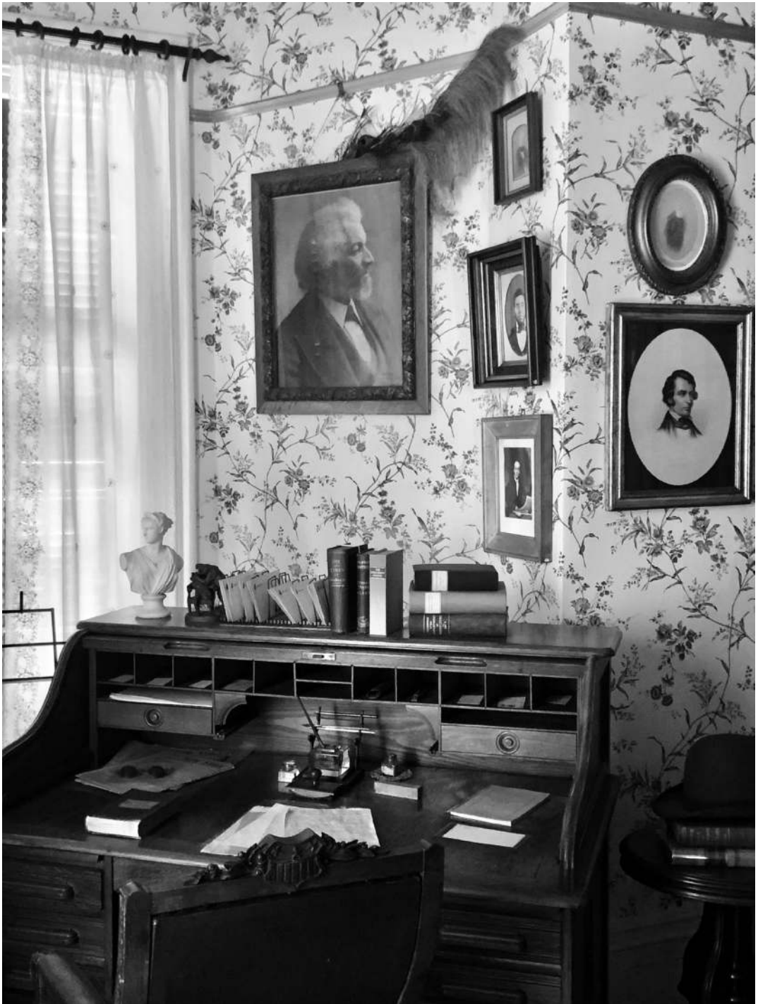
Figure 1: Writing desk of Frederick Douglass in his Gothic Revival residence at Cedar Hill in the Anacostia neighborhood of Washington, DC. His library, preserved much as it was upon his death, includes editions of the works of Sir Walter Scott, historical romances, and slave narratives. Frederick Douglass National Historic Site. December 2019.