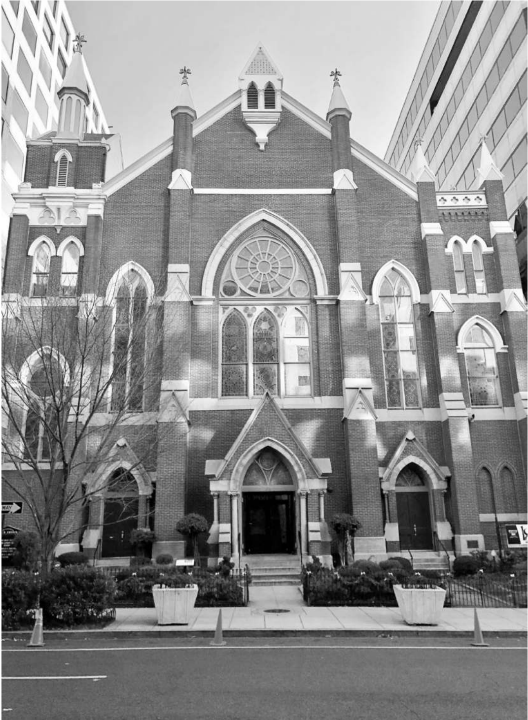
Figure 2: Metropolitan African Methodist Episcopal (AME) Church, featuring grand Gothic arches and stained glass. Frederick Douglass attended this church throughout his residence in the city and his funeral was held here in 1895. Washington, DC. December 2019.