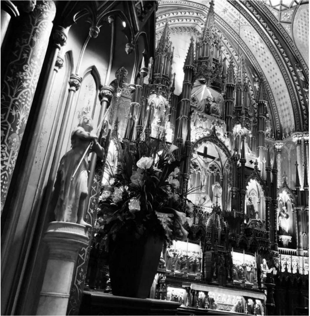
Figure 10: Sculpture of Joan of Arc standing next to the altar at the Basilique Notre-Dame de Montréal in Old Montreal, Québec, a masterpiece of Gothic Revival architecture. May 2018.

for the Chinese half of us.” 79 Informing her proud mother afterwards that the siblings “won the battle,” the narrator awakes in the morning shouting lyrics to “Sound the battle cry” —a hymn laden with chivalric imagery. 80 Alluding to anti-Chinese violence through this tale of childhood harassment, Sui Sin Far uses medieval imagery to express a racialized dual identity. Internalizing “white savior” tropes of progressive missionary uplift, she imagines a chivalric white self who fights on behalf of another self that is vulnerable and Chinese.