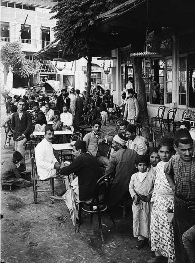
FIGURE 1.3. Cafe at a Beirut public garden during the late Ottoman period, ca. 1900–1920.

class-based lines. With the appearance of these kinds of places, the removal of its medieval city walls, and its newfound status as an imperial capital, Beirut changed profoundly during the late Ottoman period; a modern city was inaugurated, one characterized by a vibrant, middle-class public sphere.