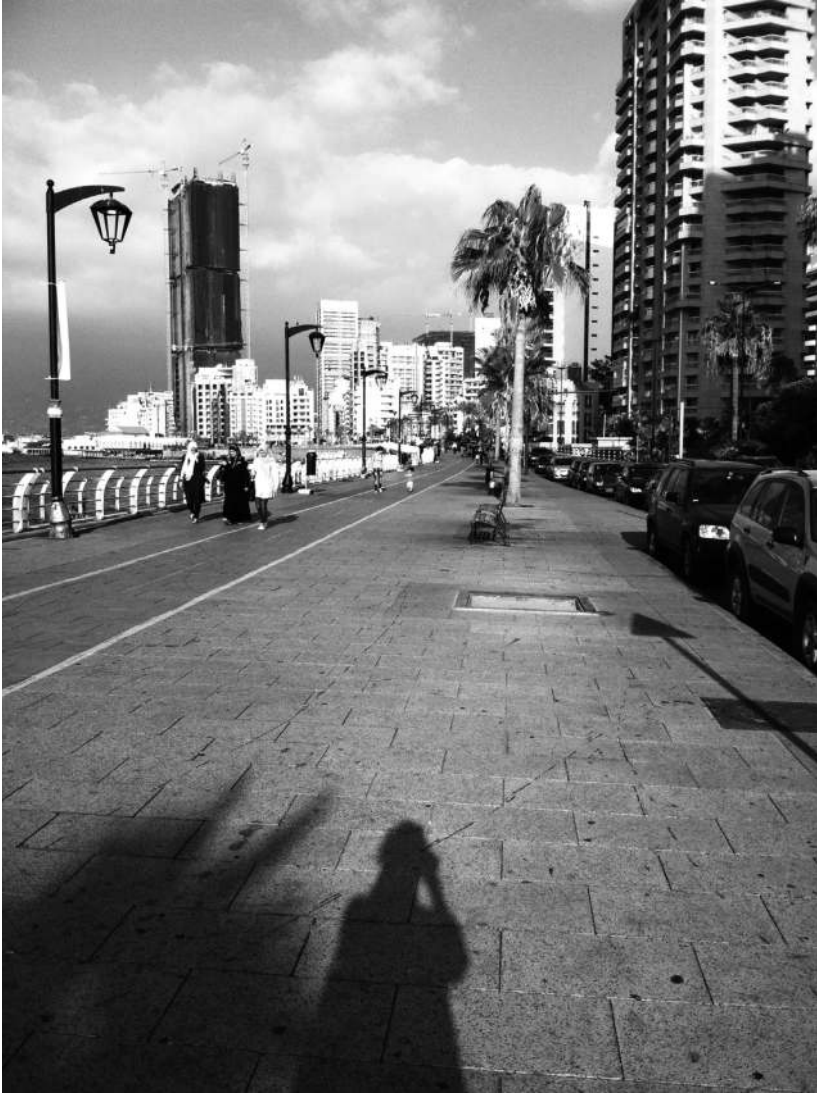
FIGURE 1.4. The Corniche.

parks, 46 the city in fact looks like it perhaps will become less, rather than more, green in the near future: in June 2103, the municipal government announced plans to demolish—and later replace parts of—a park known as the Jesuit Garden in Geitawai, a neighborhood of winding, narrow lanes on the eastern side of the city, in order to build a parking garage. Vigorous