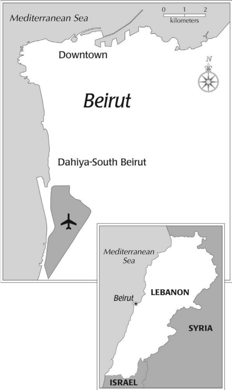
FIGURE 1.1. Map of Beirut in Lebanon and the region.