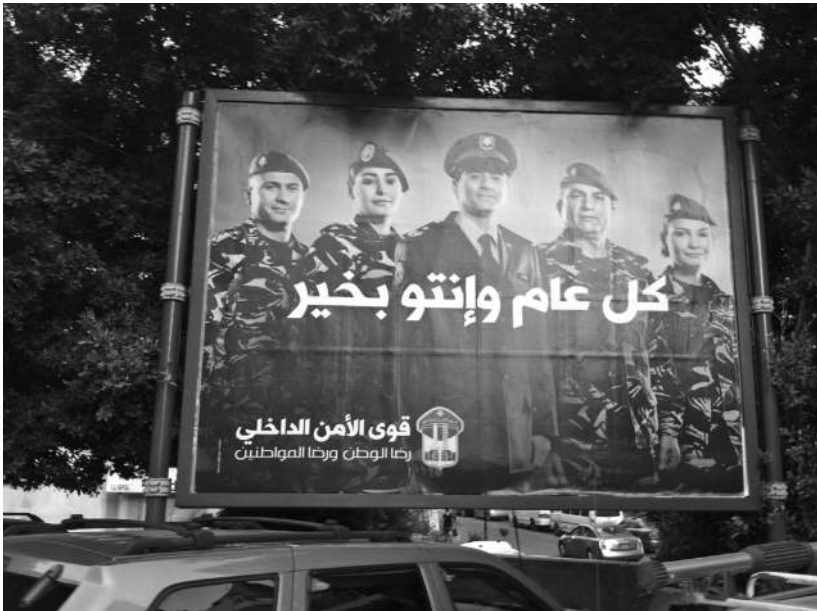
FIGURE 1.1. Internal Security Forces billboard: "Making the nation and the citizens content."

During summer 2013, in the context of a deteriorating domestic security situation because of the spillover from the Syrian civil war, billboards throughout Beirut aimed to send a comforting message about the state's interest in taking care of citizens. The billboards pictured five members of the national police agency, the Internal Security Forces (ISF). The billboard's message was "May you be well and in good health every year," an Arabic sentiment expressed on holidays and special occasions and, below, "Making the nation and the citizens content." With its kind message of well-being and smiling visages of police officers, the billboard cannily personalized and made accessible the state's security apparatus by foregrounding its workforce. This was a strikingly different political sensibility than those expressed by the banners, posters, and images that were draped throughout