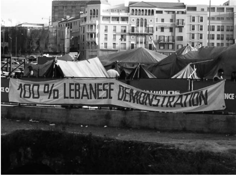
FIGURE 2.1. Tent City: Downtown protestors demand the truth about who killed Hariri and independence from Syrian control, spring 2005.

assassination in front of the seaside Phoenicia Hotel on February 14, 2005, Hariri was buried downtown across from a vacant area known as Martyrs' Square, where a statue that commemorates the nationalists hanged by the Ottoman Turks in the early twentieth century is situated. From the time of his funeral and for months afterward, a line of people wanting to visit his burial site extended out into the street, and Martyrs' Square became a tent city for demonstrators with signs demanding al-haqeeqa (the truth) about the identity of Hariri's assassin. 39