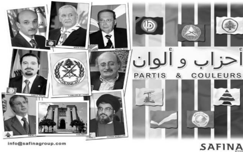
FIGURE 3.1. Lebanese “Parties and Colors” albums and stickers.

suburb” in Arabic), is an assemblage of multiple municipalities and neighborhoods. 13 In the early twentieth century, the land where it is situated was rural, but by 1970 (Deeb 2006, 47) it had become part of Greater Beirut, mainly because of the wave of rural-to-urban migration in the 1950s and 1960s, which I describe in chapter 1. During the years of Lebanon’s war, Shi’i refugees from the northeastern suburbs, the south, and the Bekaa Valley arrived in the area, and these consecutive waves of migration altered the sectarian makeup of the southern suburbs from being a mix of Shi’i Muslims and Maronite Christians to being predominantly Shi’i. Although, in many ways, the neighborhoods in Dahiya are unexceptional, resembling other neighborhoods in Beirut, especially working-class ones, the area is set apart by its population density and the morphology of the built environment. 14 Although, as Mona Harb writes, Dahiya is just another Beirut neighborhood managed “by a sect-based political actor,” by reserving for itself the right of armed resistance to Israel—a claim some Lebanese see as a threat to the legitimacy of the state—the group constitutes the southern suburbs as a realm distinct not only from other parts of Beirut but from the rest of Lebanon (Harb 2007, 13).