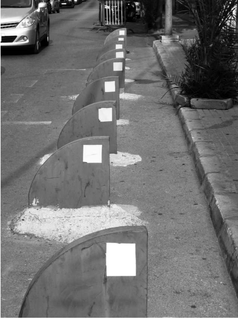
FIGURE 4.1. Shark-fin barriers.

the impromptu aspects of security. Typically consisting of black SUVs with blacked-out windows that often bear no license plates, the convoys are only sometimes led by a police vehicle with flashing lights or a siren. More often, they appear without warning to take over the field of drivers. Thundering past motorists frantically trying to get out of their way, the convoys activate