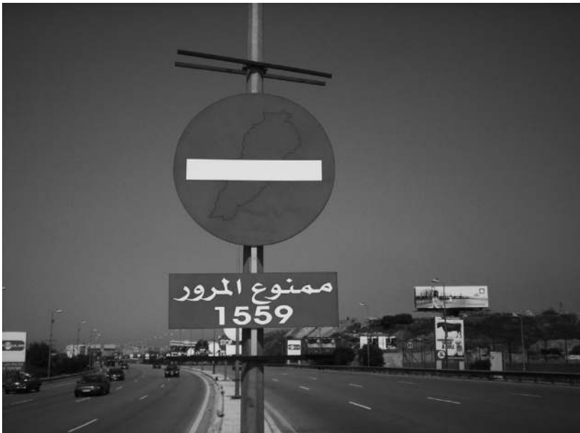
FIGURE 3.2. Traffic sign: “No foreign intervention! 1559 prohibited from passing.”

In March 2005, amid the heated contention between the just-formed March 8th and March 14th political camps, I took a taxi out toward the airport to see traffic signs that had appeared overnight along the median of the highway. They were, in fact, faux traffic signs that used the commonly recognized symbols and vocabulary of traffic control to express political sentiments