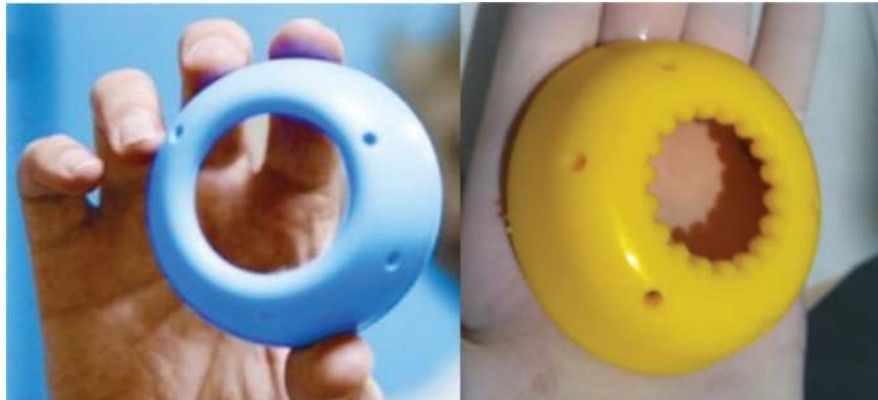
Figure 2. Comparison between the Arabin cervical pessary (blue) and the AM-Ingamed cervical pessary (yellow): They are similar regarding design, size, and texture. The dimensions (largest lower diameter × smallest upper diameter × height) of the most frequently used Arabin pessary are 70 × 32 × 25 mm, and of the Ingamed cervical pessary the dimensions are 70 × 30 × 25 mm.

Pregnant women (n = 137) with a sonographic cervical length ( \leq 25 mm) were randomly selected to receive an Arabin cervical pessary ( Figure 2 ) or expectant management (1:1 ratio). SPB < 34 weeks of pregnancy was significantly less frequent in the pessary group than in the expectant group (16.2% vs. 39.4%); relative risk, 0.41. No significant differences were observed in composite neonatal morbidity outcome (5.9% vs. 9.1%); relative risk, 0.64. No serious adverse effects associated with the use of a cervical pessary were observed or neonatal mortality (none) between the groups.