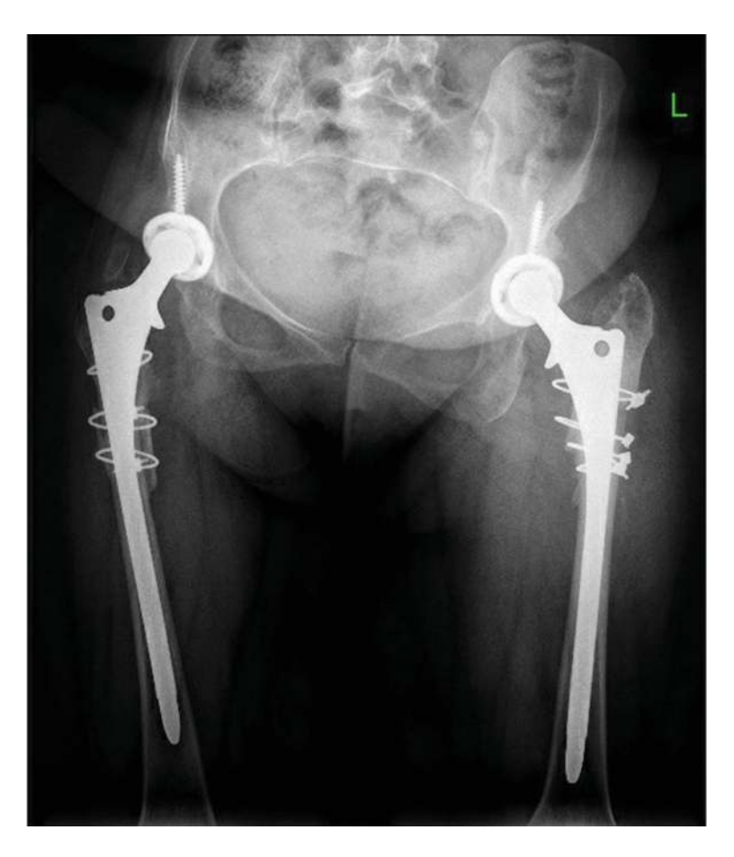
Figure 3. Postoperative radiograph of the pelvis showing bilateral reconstruction. Both acetabular reconstructions are done in a higher position than the true acetabulum because of the acetabular bone deficiency. Bilateral femoral shortening has been performed with usage of resected bone as auto graft.

ter is much with this technique [30, 31]. Subtrochanteric osteotomy preserves the metaphyseal region and has an advantage of correcting the rotational abnormalities with femoral shortening [32, 33]. After subtrochanteric femoral shortening, osteotomy noncemented femoral component can be used but a cemented DDH specific stem is preferable.