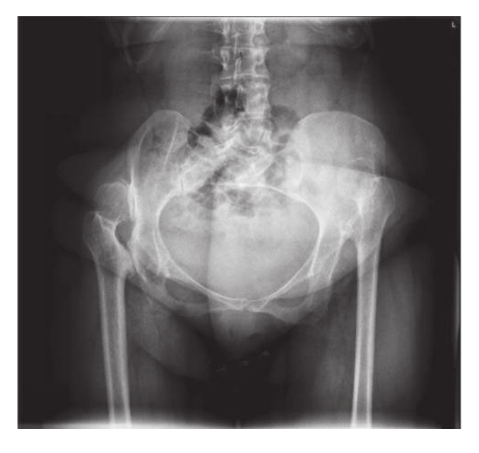
Figure 2. Bilateral Crowe IV developmental dysplasia of the hip. Both acetabula have bone deficiency with narrow femoral canal.

There are two kinds of femoral osteotomies that can be performed in total hip arthroplasty for Crowe Types III and IV hips. First one is trochanteric osteotomy with proximal femoral shortening. Trochanteric osteotomy provides visualization of femur and acetabulum and preserves abductor mechanism with low risk of dislocation [29]. But risk of nonunion of great trochan-