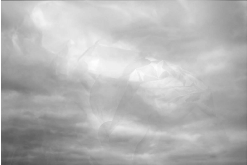
Fig. 6: Joanna Zylińska, Topia daedala 6 , 2014