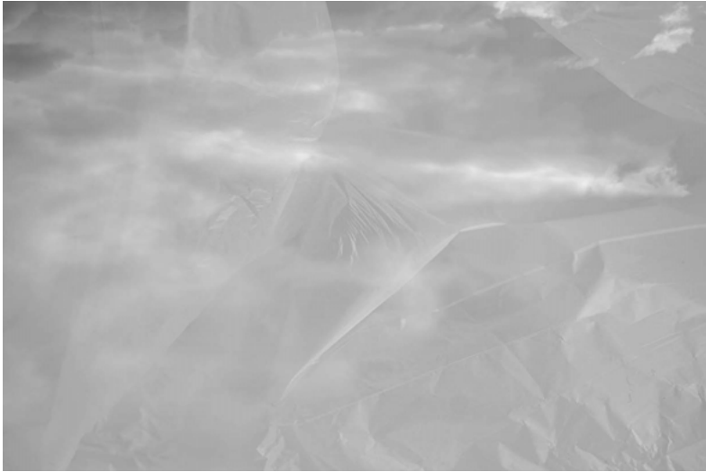
Fig. 8: Joanna Zylińska, Topia daedala 8 , 2014