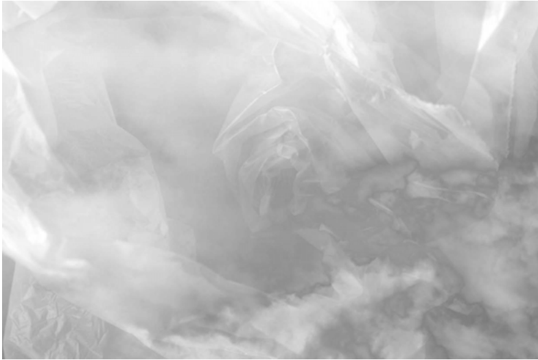
Fig. 12: Joanna Zylińska, Topia daedala 12, 2014