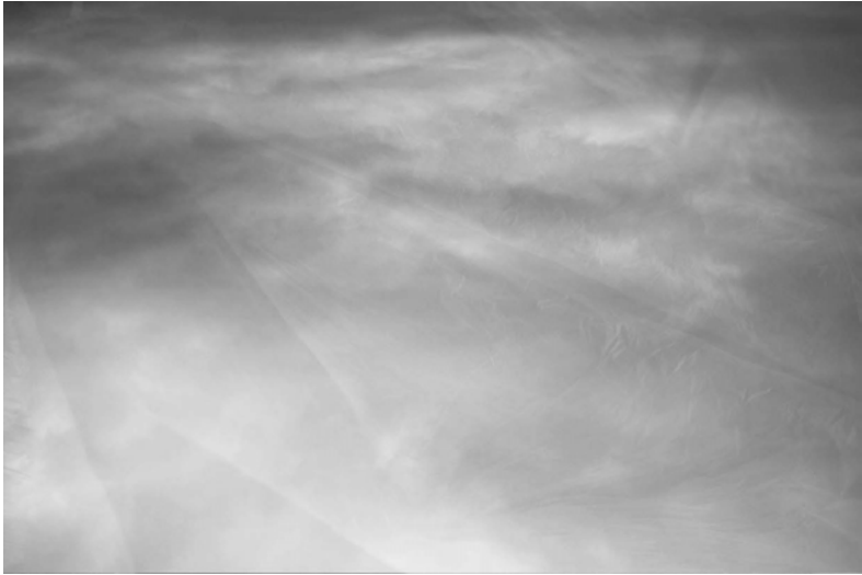
Fig. 7: Joanna Zylińska, Topia daedala 7 , 2014