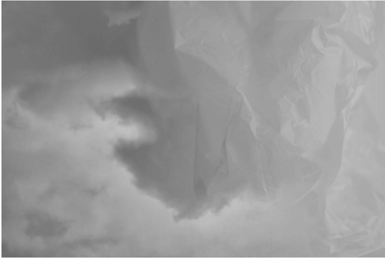
Fig. 4: Joanna Zylińska, Topia daedala 4 , 2014