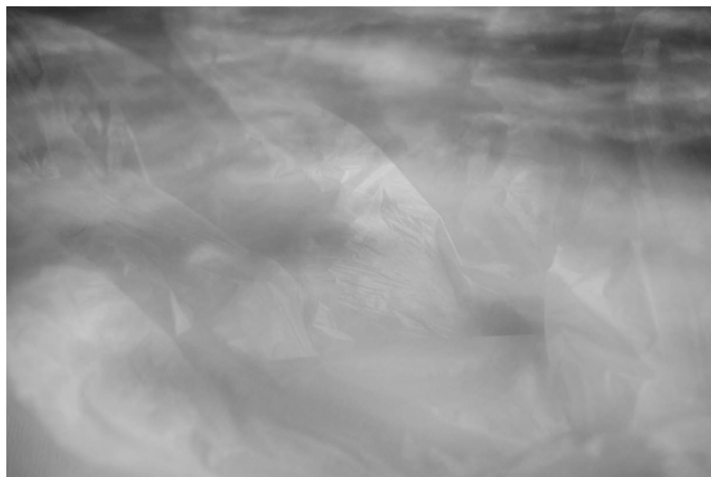
Fig. 5: Joanna Zyliniska, Topia daedala 5 , 2014