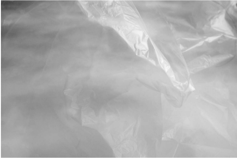
Fig. 2: Joanna Zylińska, Topia daedala 2 , 2014