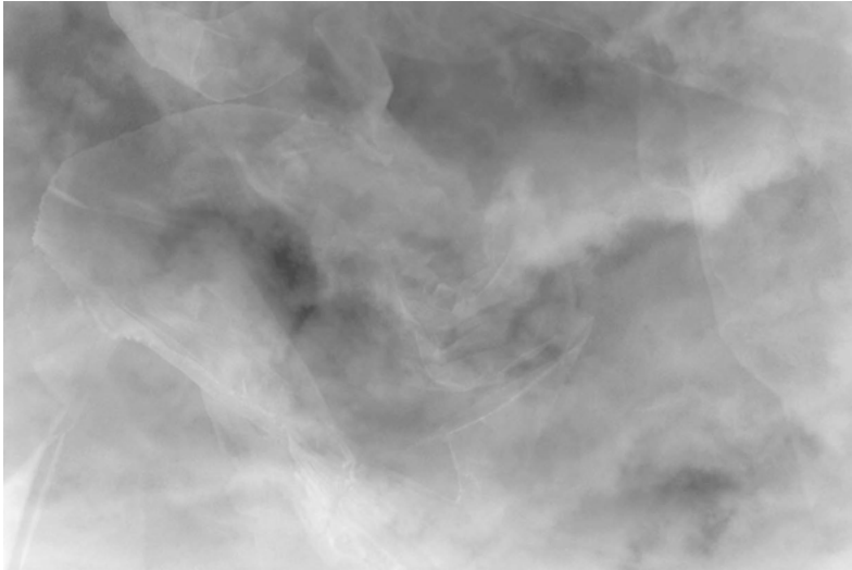
Fig. 9: Joanna Zylińska, Topia daedala 9 , 2014