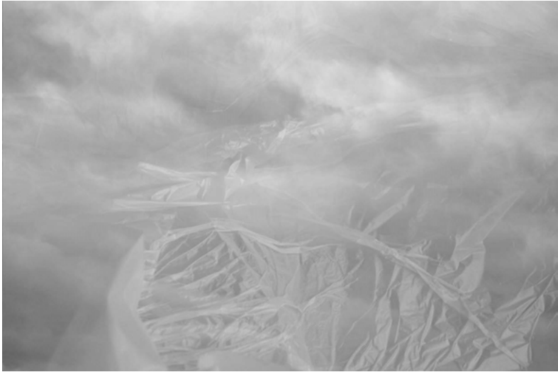
Fig. 1: Joanna Zylińska, Topia daedala 1 , 2014