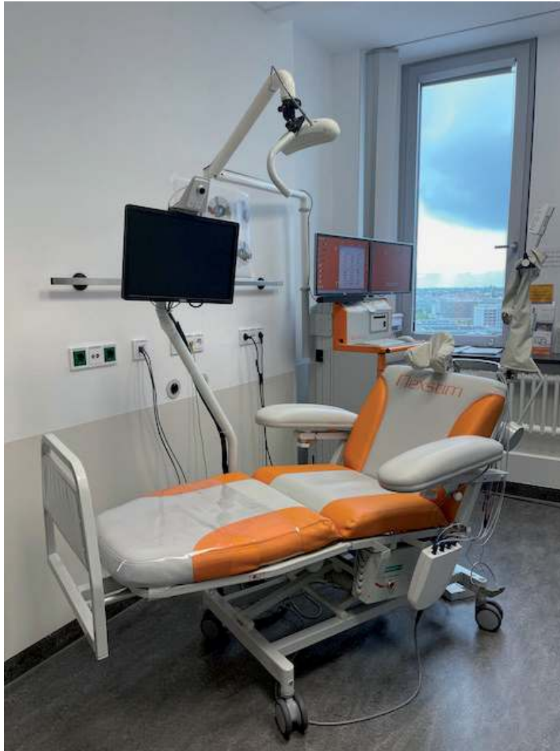
Figure 1. TMS hardware.

sulcus is recommended (please see [12] for more information on how to perform an nTMS session) ( Figure 2 ).