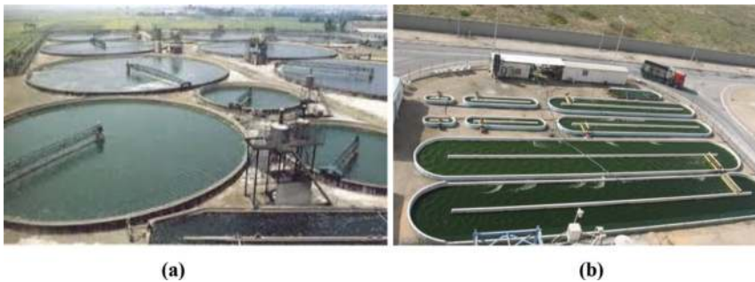
Figure 1. Open ponds cultivation system of microalgal cells. (a) Circular open pond and (b) raceway pond.

the surroundings, the contamination is unavoidable. According to the analysis literature, the productivities in circular pond vary between 8.5 \text{ g}/(\text{m}^2 \text{ d}) and 21 \text{ g}/(\text{m}^2 \text{ d}) [4].