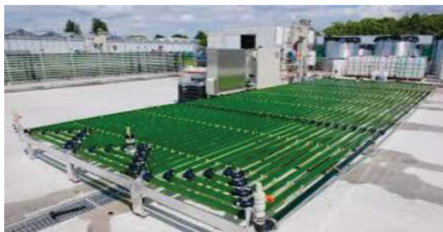
Figure 4. Horizontal tubular PBRs.