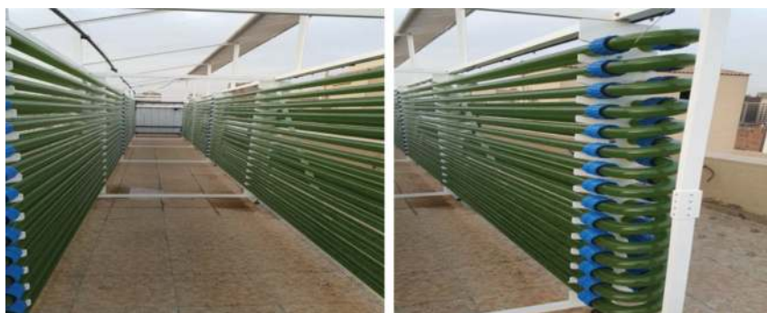
Figure 3. Vertical tubular PBRs.

HPBRs are the foremost standard PBRs. HPBRs disagree from the vertical tubes in many ways, significantly with tube surface and volume quantitative relation [24]. HPBRs ( Figure 4 ) are primarily recognized of tubes organized in multiple potential orientations, like horizontal and helicoidally however all orientations basically add same method. Except for the arrangement