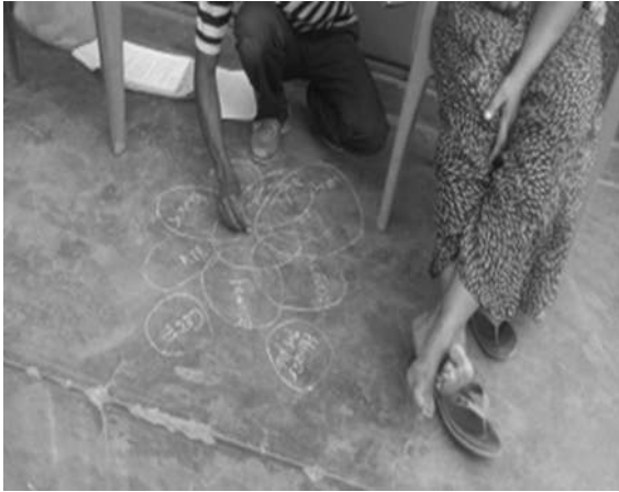
Figure 11.5 A participant guiding the researcher in drawing her Venn diagram in Kiboga district. She argued that she could not write on the ground as if she was a child.