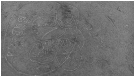
Figure 11.4 A Venn diagram of a male participant emphasizing the significance of religion. He drew a bigger Venn for his local church, Bubago Church of Uganda. “It’s because of God that am still alive and talking to you now”, he said.