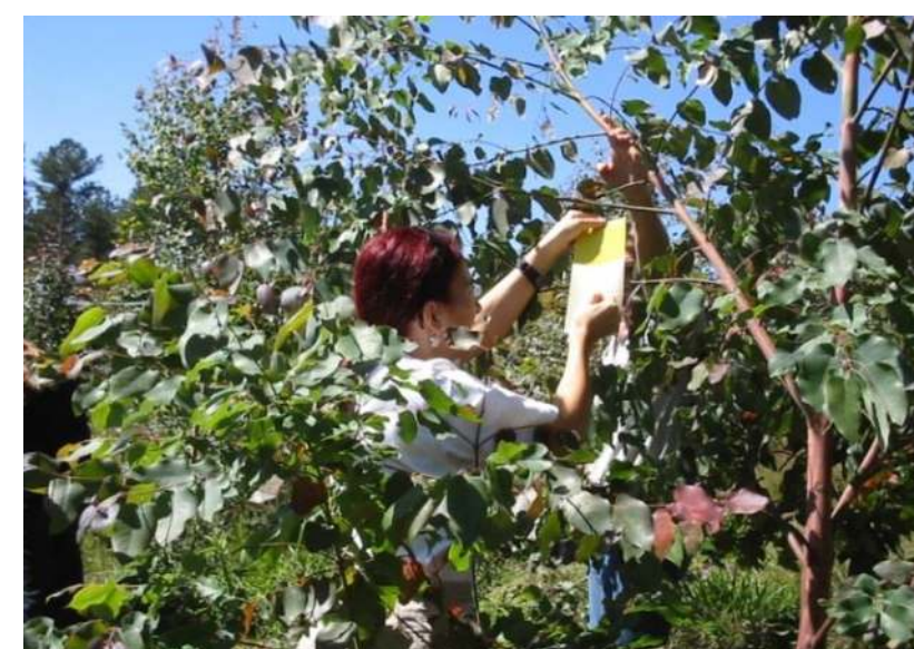
Inspection and monitoring with sticky traps