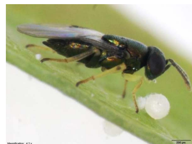
Psyllaephagus blastopsyllae female