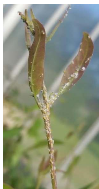
Colony of Blastopsylla occidentalis