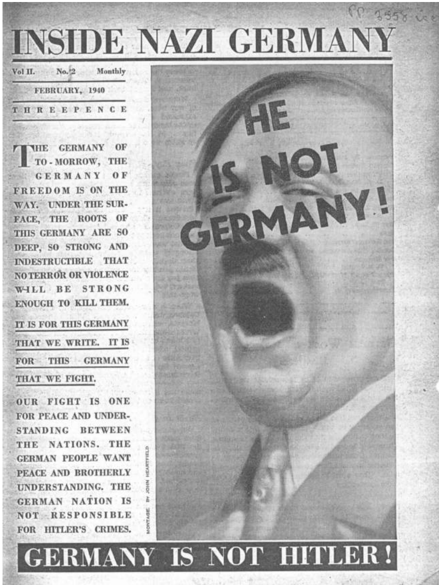
Figure 3.1. 'Germany is Not Hitler!', Inside Nazi Germany , February 1940

This material is not covered by the Creative Commons licence terms that govern the reuse of this publication. For permission to reuse please contact the rights holder directly.