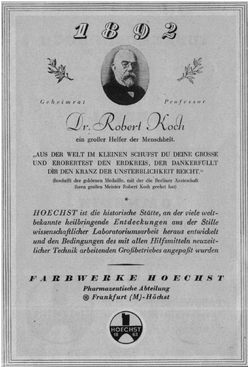
Figure 4.1. Farbwerke Hoechst advertising flyer [1947]

This material is not covered by the Creative Commons licence terms that govern the reuse of this publication. For permission to reuse please contact the rights holder directly.