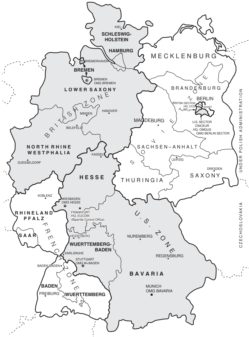
Figure 1.1. OMGUS map of occupied areas of Germany, with zones and Länder

This material is not covered by the Creative Commons licence terms that govern the reuse of this publication. For permission to reuse please contact the rights holder directly.