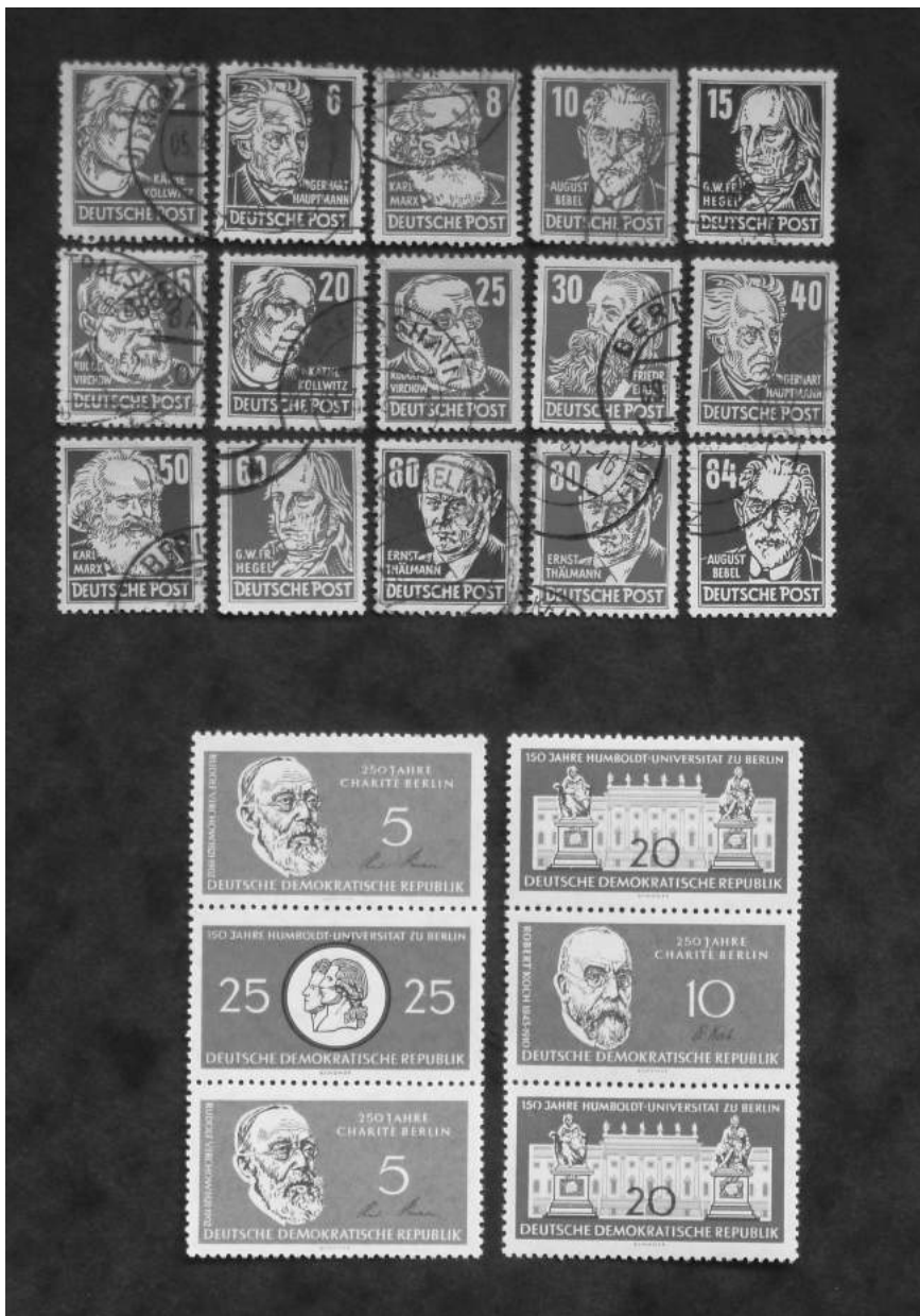
Figure 4.2. Top: Stamps from the series Personalities in politics, the arts and science (Deutsche Post, German Democratic Republic, 1952). Virchow features here among grandees of German Communism such as Karl Marx, Friedrich Engels, August Bebel and G. W. Hegel. Bottom: Stamps from the series 150 years Humboldt University – 250 years Charité (Deutsche Post, German Democratic Republic, 1960)

Virchow also featured in other commemorative stamp series, such as Men from the history of Berlin (Deutsche Post Berlin, 1952; and Deutsche Bundespost Berlin, 1957)