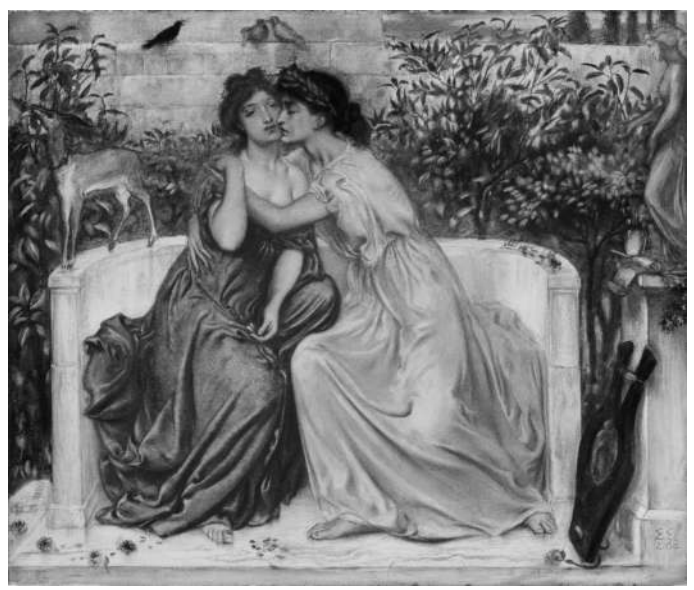
Figure 1 . Simeon Solomon, Sappho and Erinna in a Garden at Mytilene (1864)

this was a world of fluid possibilities." If so, why did such fluidity come to a halt, what boundary did Solomon violate that kept this artwork from public display? He "attracted sustained criticism of 'unwholesomeness' or 'effeminacy," we are finally told. For what? This image?