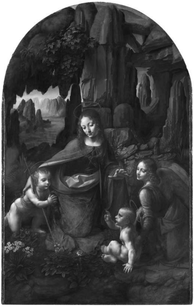
Figure 3 . Leonardo da Vinci, The Virgin of the Rocks (about 1491/2–9 and 1506–8), National Gallery, London.

the question of whether gender is distributed as two separate kinds or as one. An answer perhaps lies in the other doubling so conspicuous that it has come to name the paintings, the rocks.