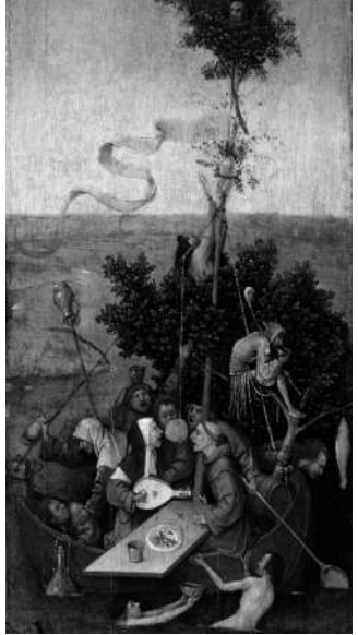
Fig. 1. Hieronymus Bosch, Ship of Fools (1490–1500)